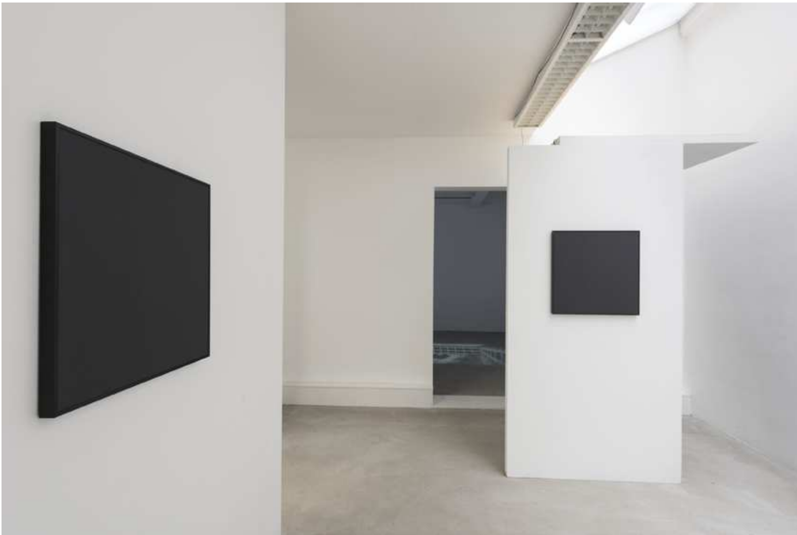
Façá Ornamentation I & II, 2014 programmed sound, directional speaker, mono, 40 seconds 1/3 + 2 ap