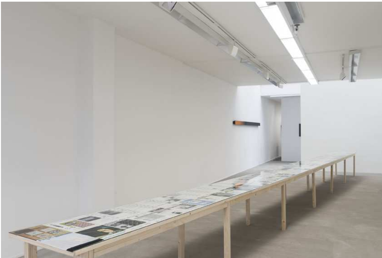
'Faça, 2014 92 pages from magazine, sketches, prints 1090,2 x 65,2 cm unicate