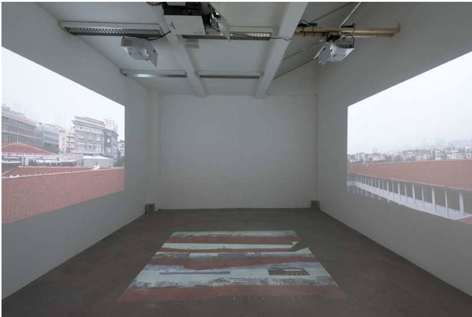
In the courtyard / Avluda, 2002

3- channel video, color, 6 channel synchronized sound, 7:12 min. Loop 3/4 + 1ap