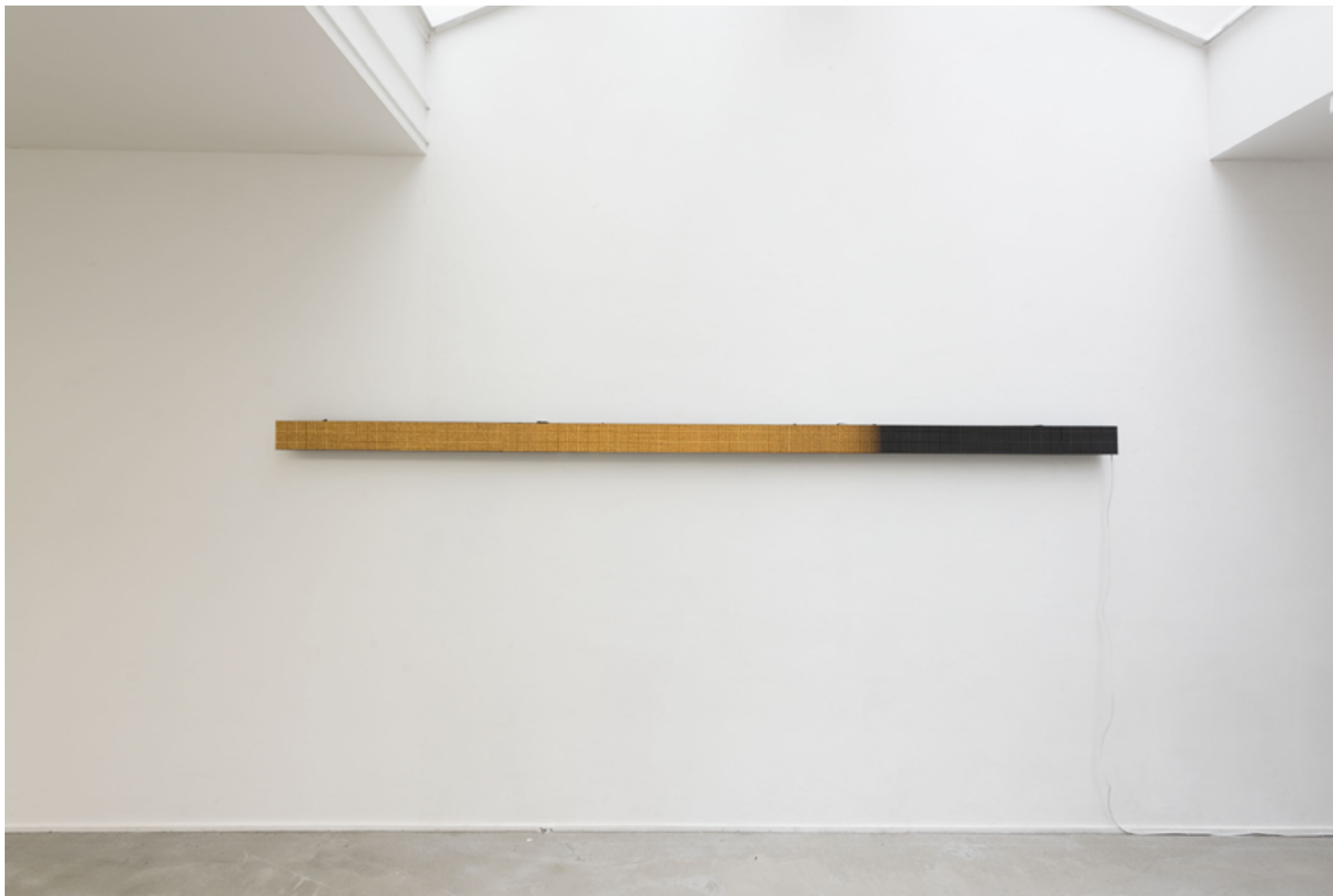
Day (Yellow), 2014 16 x 160 LED display, 3 modules. 1 module = 12 x 121 cm 1/3 + 1ap