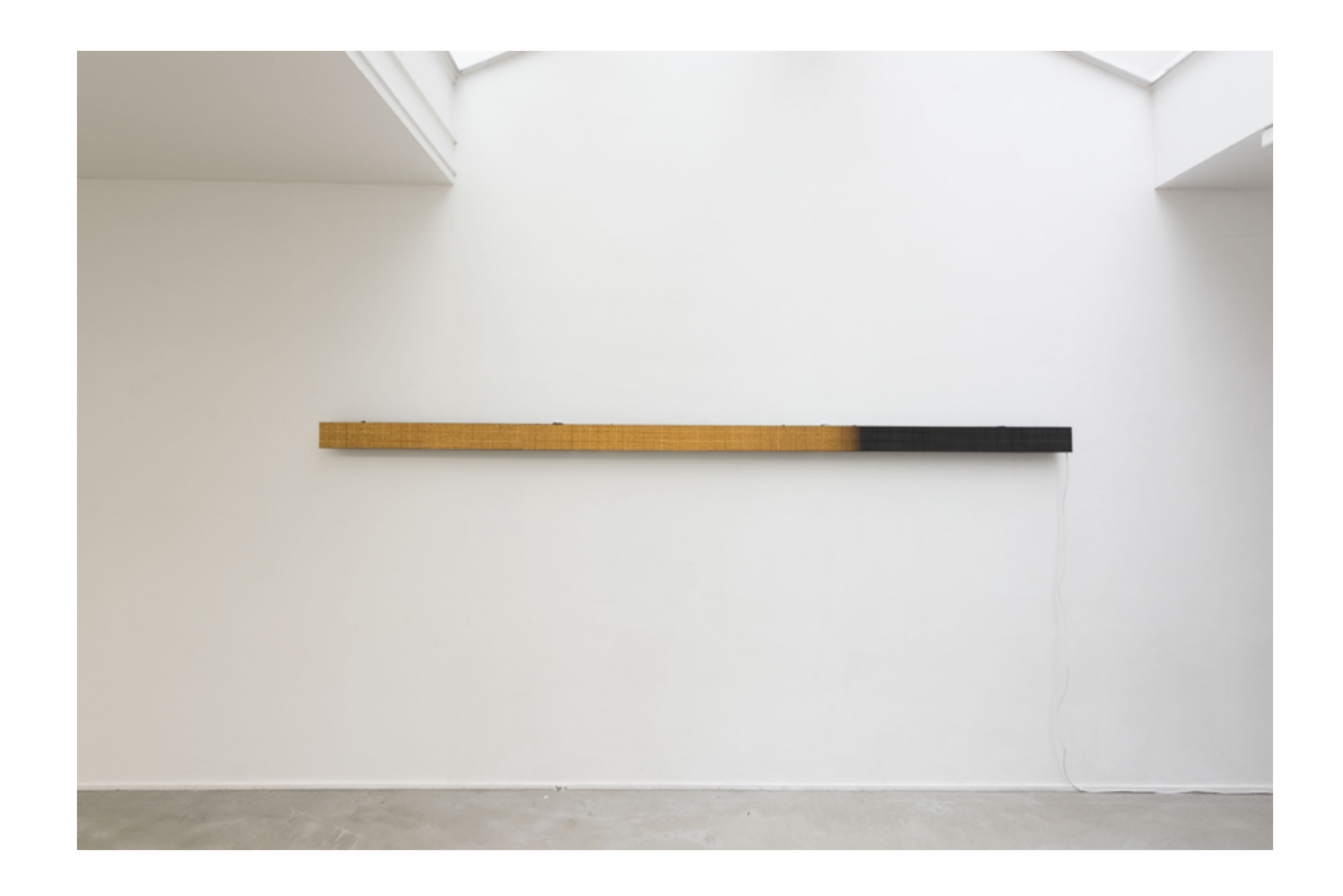
Day (Yellow), 2014 16 x 160 LED display, 3 modules. 1 module = 12 x 121 cm 1/3 + 1ap