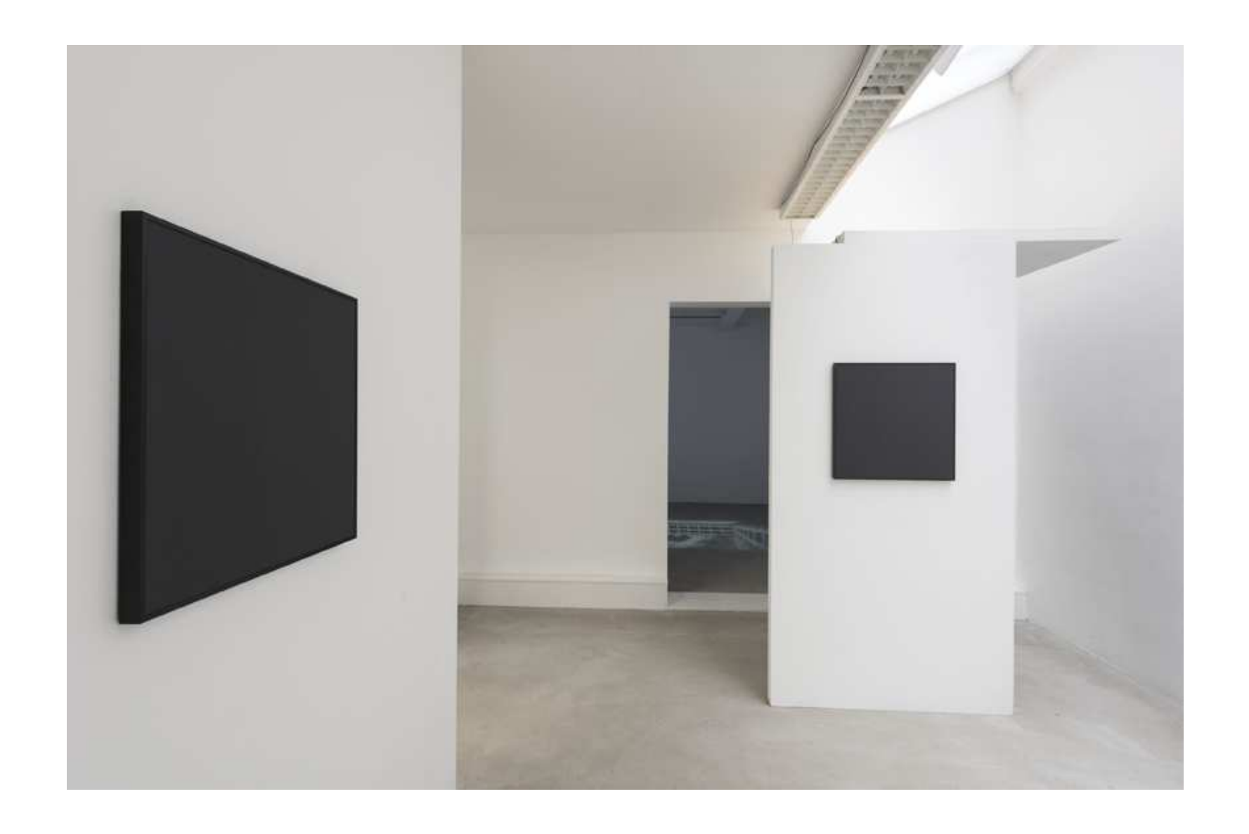
Faça Ornamentation I & II, 2014 programmed sound, directional speaker, mono, 40 seconds 1/3 + 2 ap