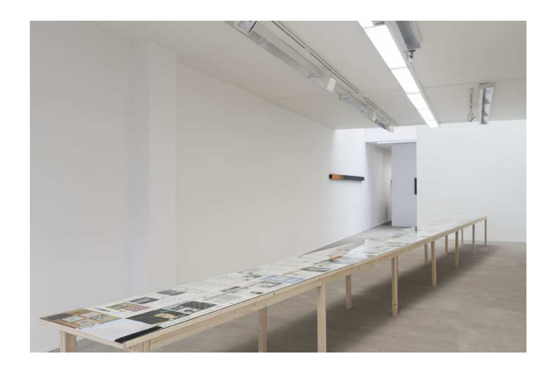
'Faça, 2014 92 pages from magazine, sketches, prints 1090,2 x 65,2 cm unicate