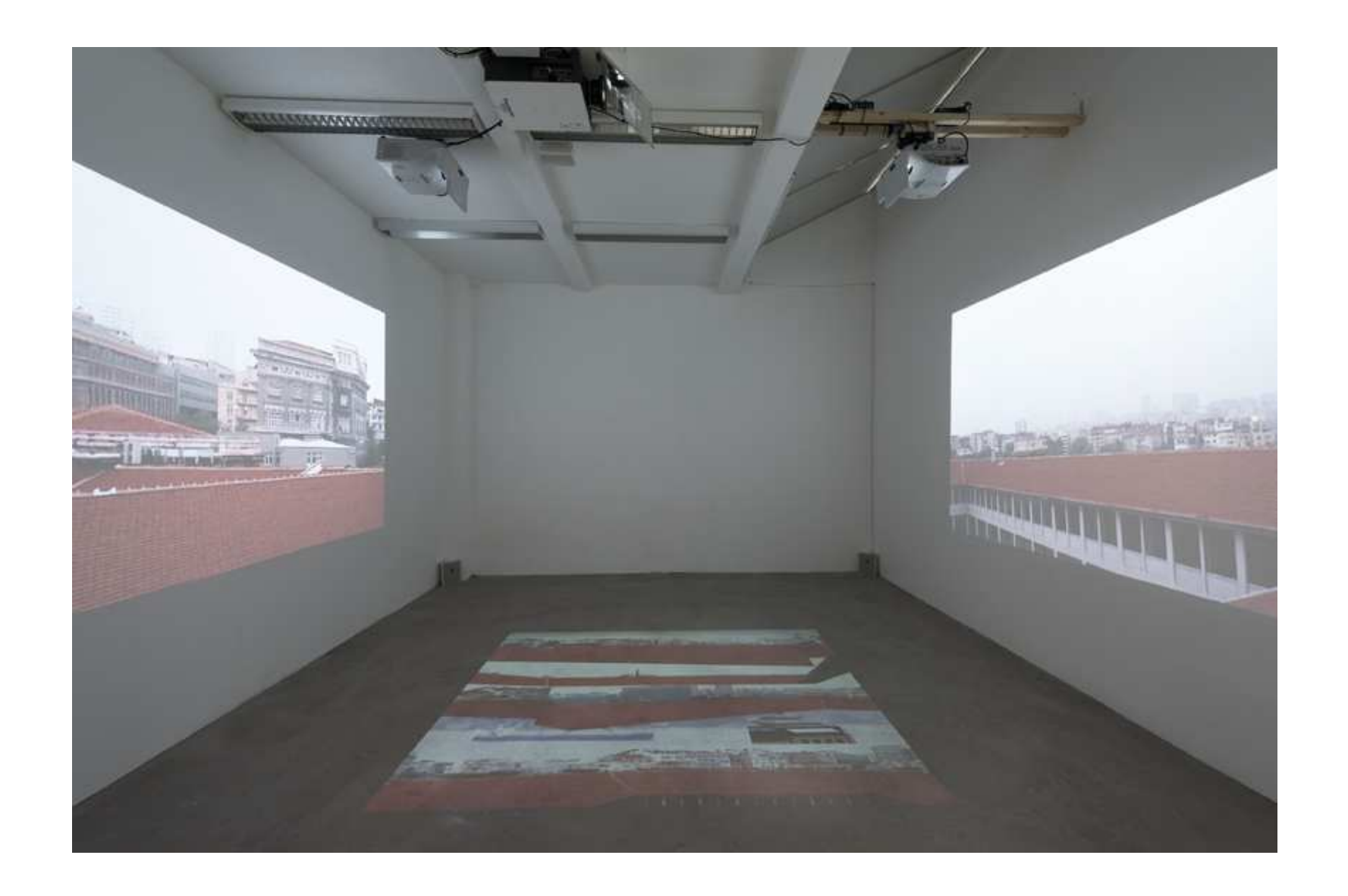
In the courtyard / Avluda, 2002 3– channel video, color, 6 channel synchronized sound, 7:12 min. Loop 3/4 + 1ap