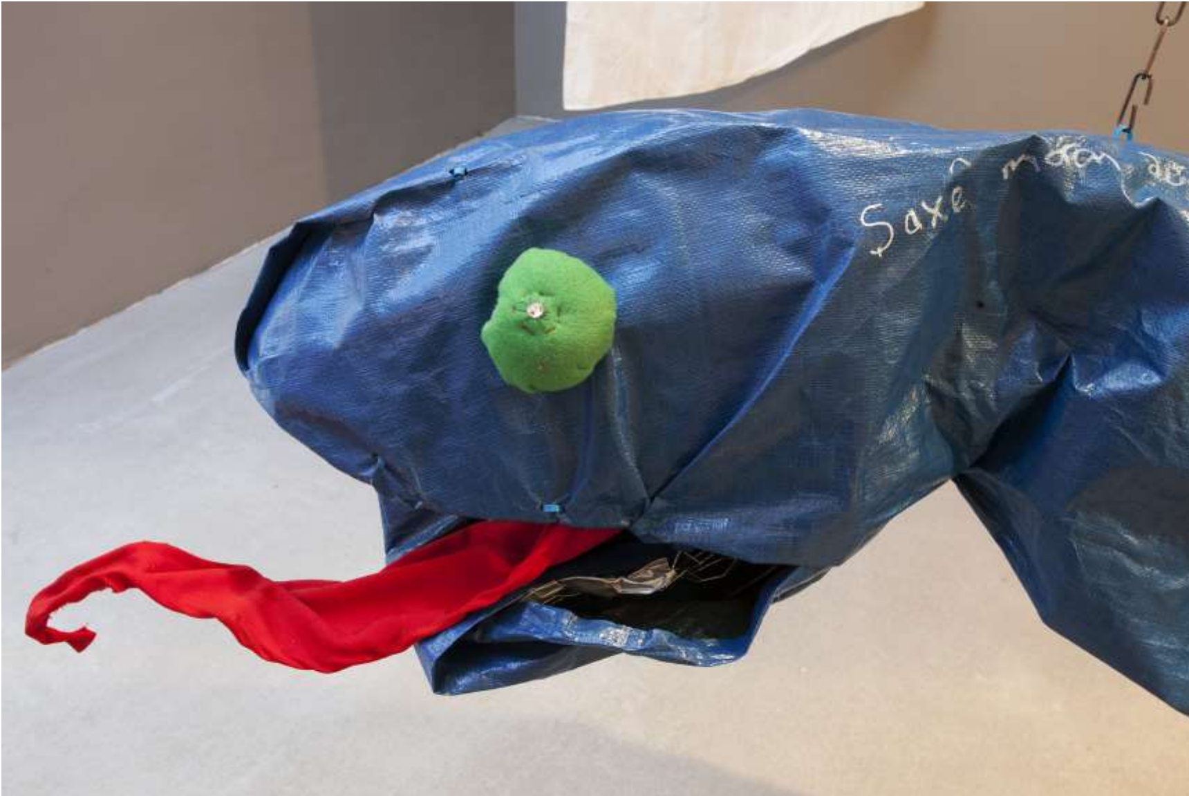
Shahmaran , 2017, Pvc, wire, 340 x 120 x 120 cm, detail, photo Wytse van Keulen