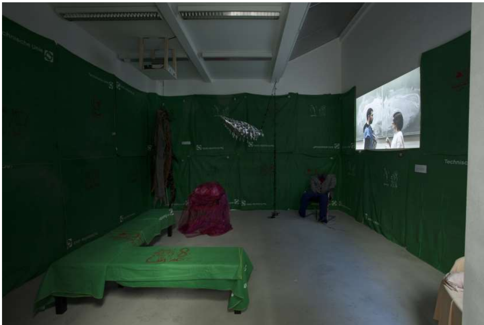
Embracing All the Strange (Installation), 2017, mixed techniques and materials, measurements variable, overview AKINCI