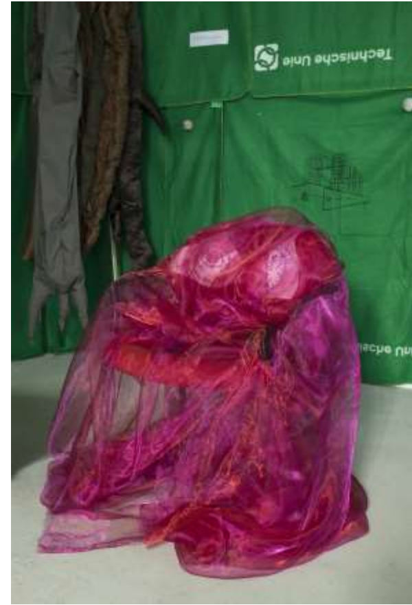
Prostitute Chair , t2017, extile, iron and plastic, 76x48x94 cm And The Wing , 2017, textile, iron, 2017, 90x30 cm