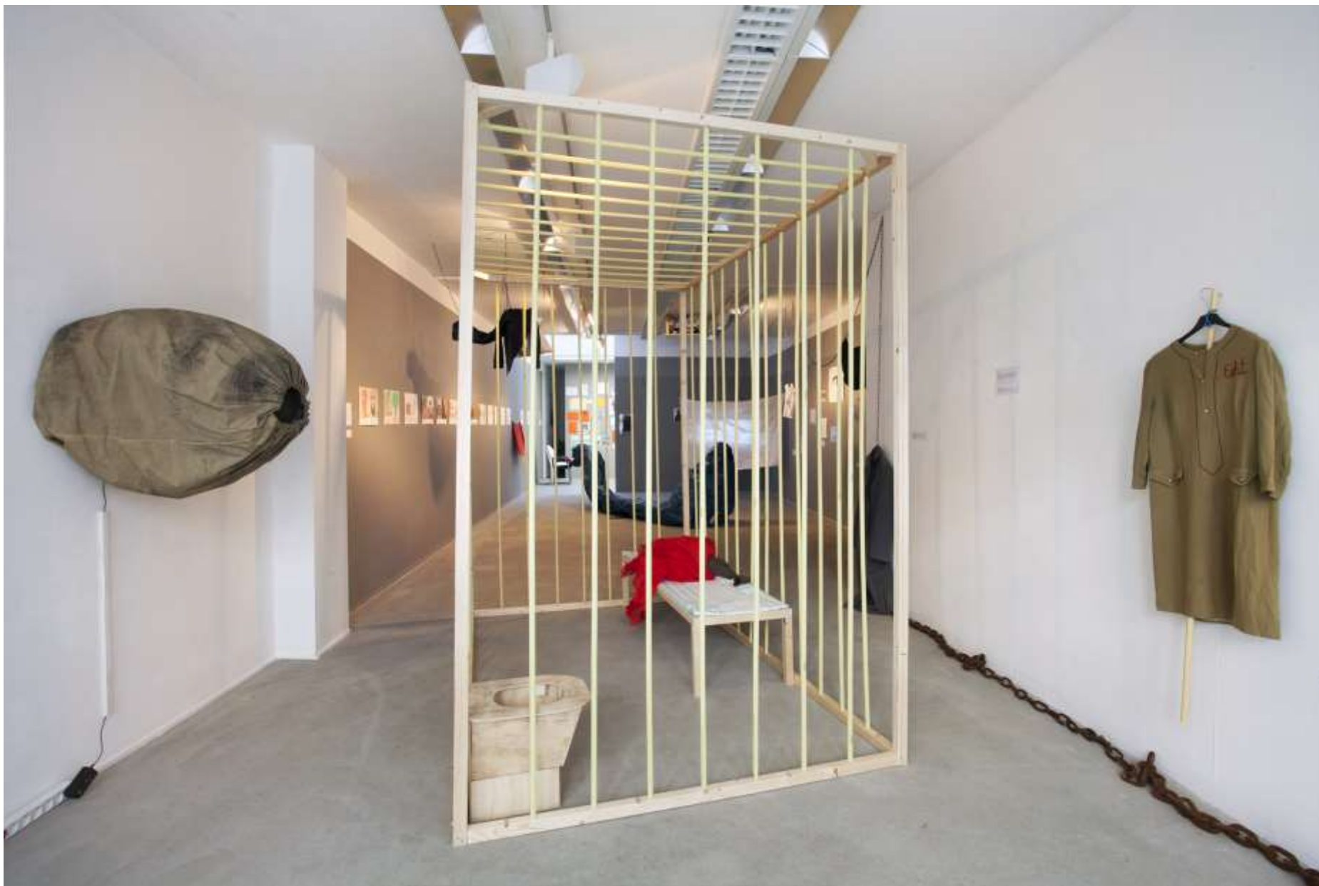
Behind the Carnival , overview at AKINCI, 2018, photo Wytse van Keulen