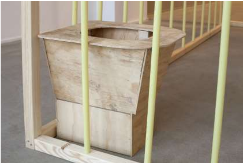
Prison Cell, 2017 , PVC, wood and textile, 270 x 170 x 238 cm, detail, photo Wytse van Keulen