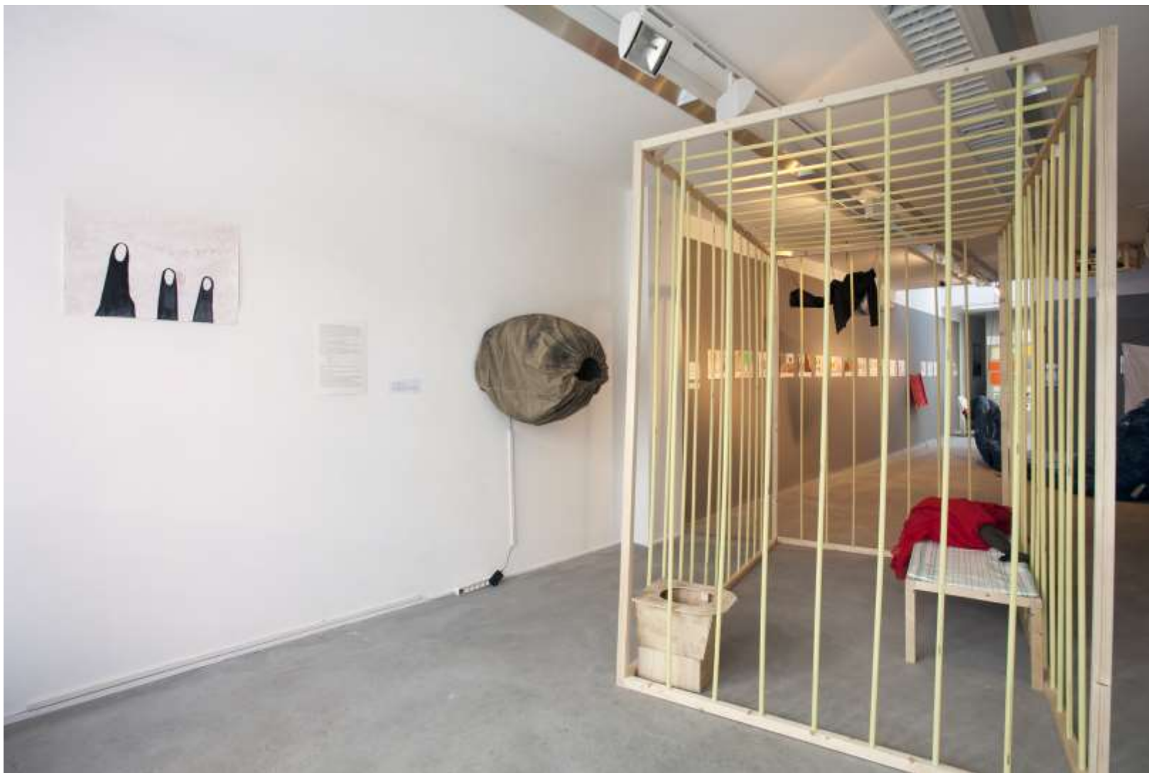
Prison Cell, 2017 PVC, wood and textile, 270 x 170 x 238 cm, photo Wytske van Keulen. A representation of a prison cell in the Bijlmerbajes. The red clove (inside the cell) is a symbol of the Russian Great October Social Revolution 1917.