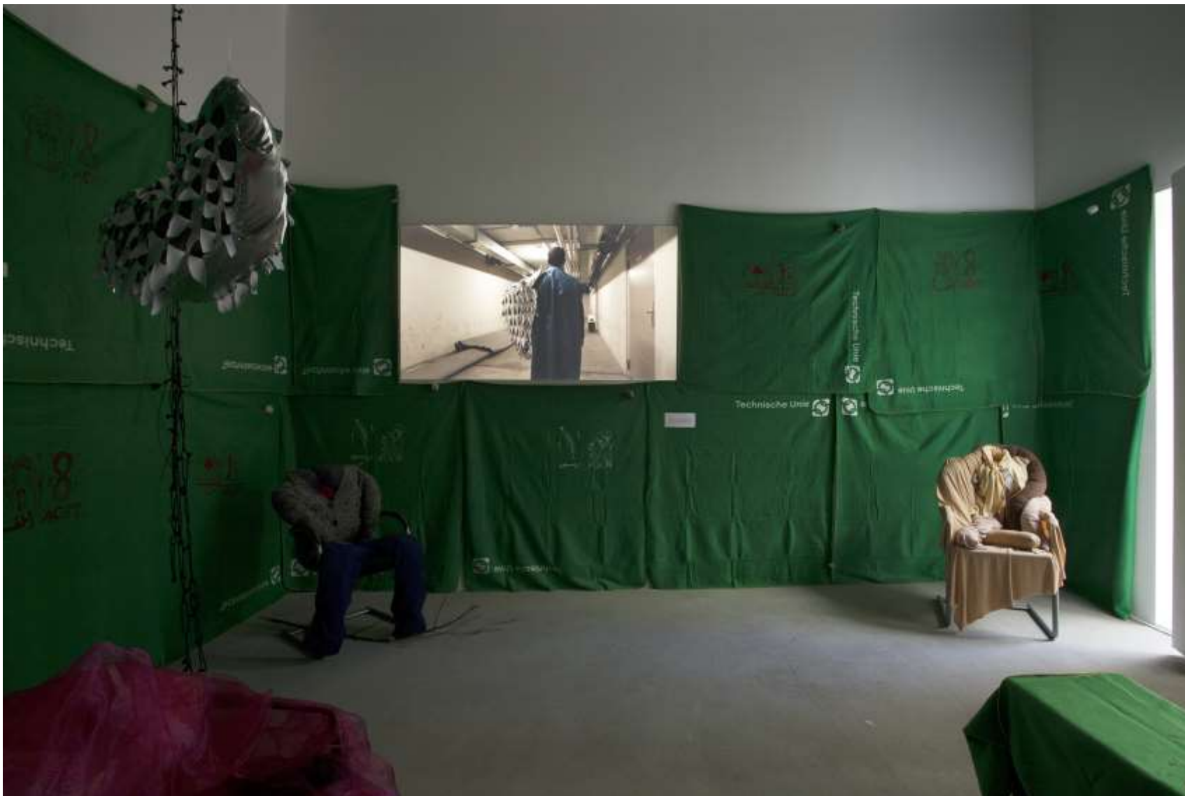
Embracing All the Strange (Installation), 2017, mixed techniques and materials, measurements variable, overview AKINCI, photo Wytske van Keulen An installation in which objects from the Carnival of the Oppressed Feelings , as well as the video Embracing All the Strange , is brought together in a confined space.