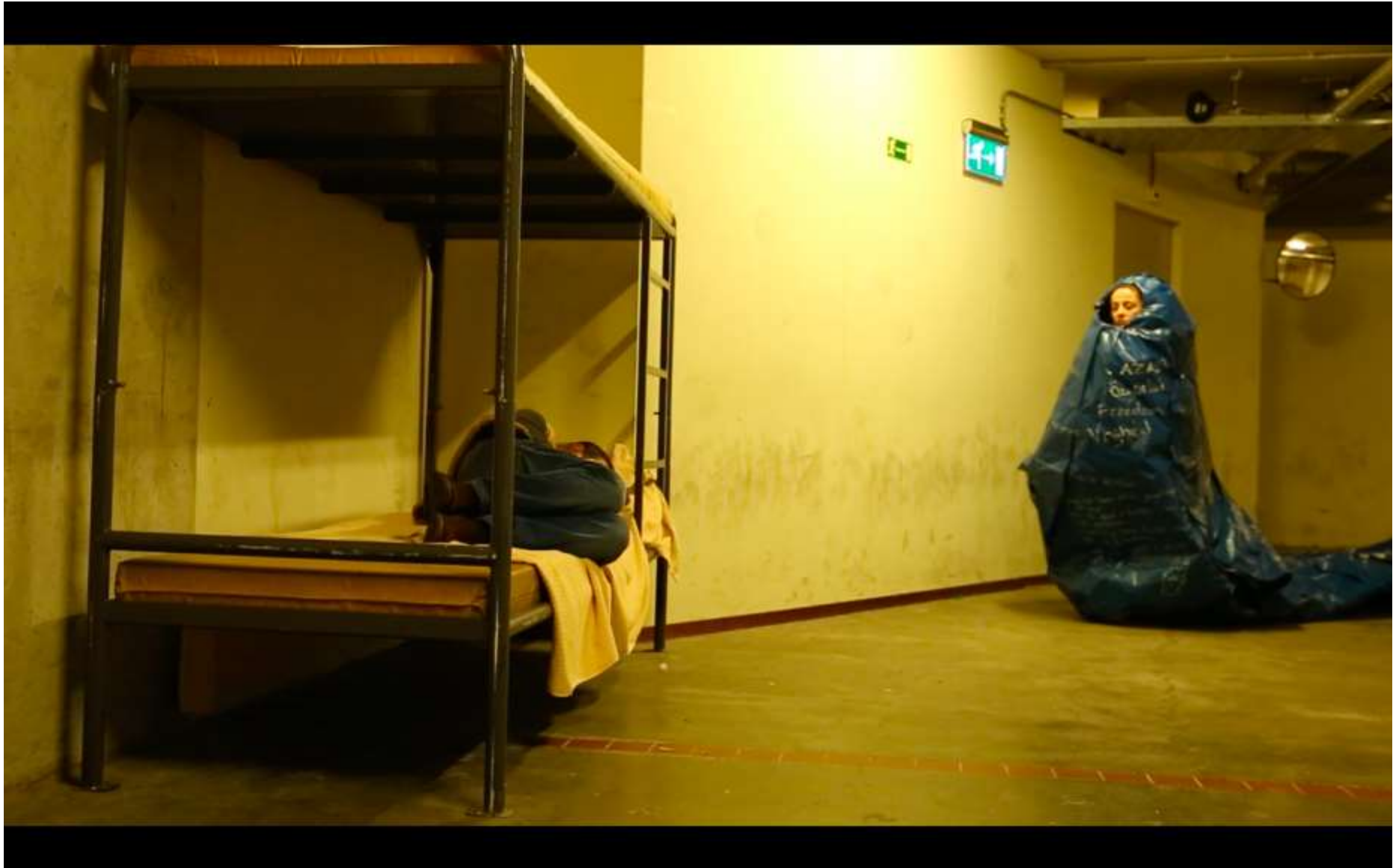
Embracing All the Strange, 2017, HD video 14 min