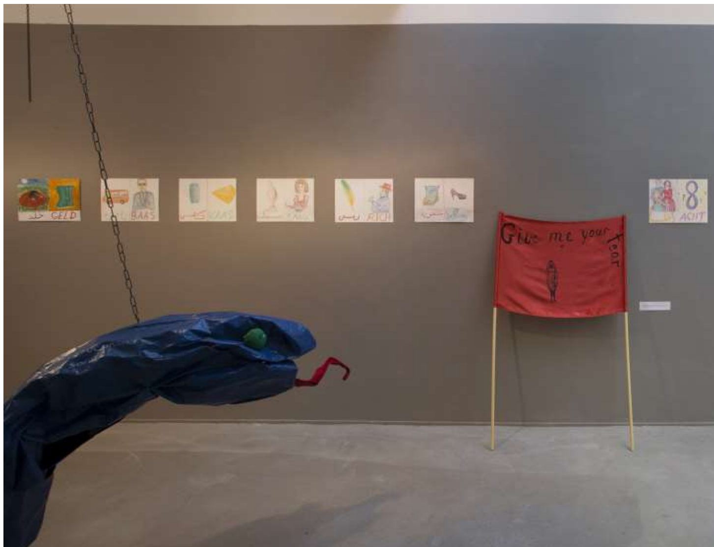
Shahmaran, 2017, Pvc, wire, 340 x 120 x 120 cm/drawings Language of Fragility with Marwa Aboud, photo Wytske van Keulen