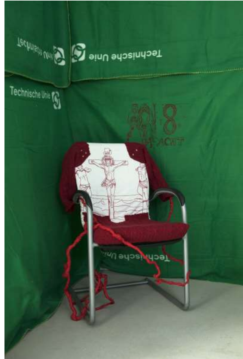
Christian Chair, 2017, textile, iron, plastic, steel, 76x48x94 cm