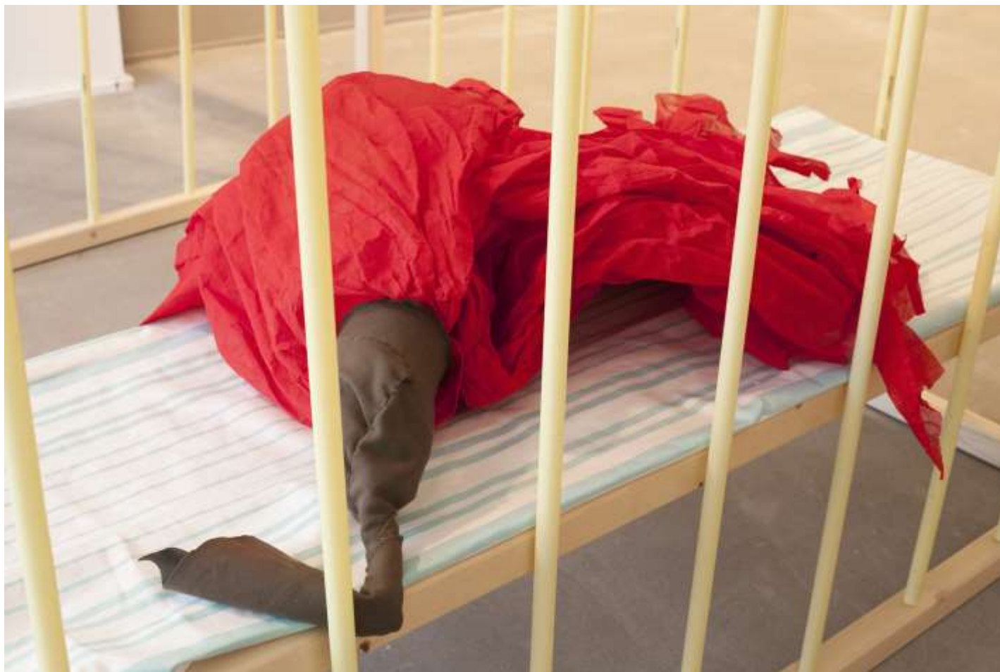
Prison Cell, 2017 , PVC, wood and textile, 270 x 170 x 238 cm, detail