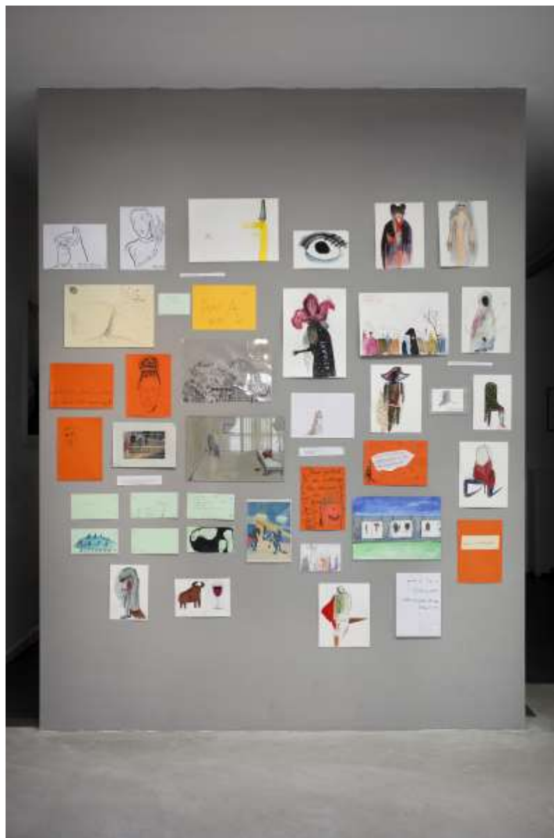
'Drawings for research 'Carnival of the Oppressed Feelings', 2017, overview at AKINCI, photo Wytke van Keulen A wall with drawings, memo's and invitations, all connected to the workshops Gluklya did with the refugees in the Bijlmerbajes.