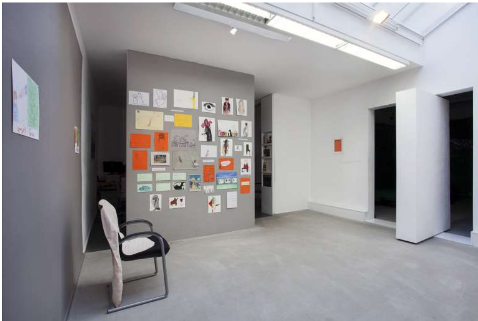
Drawings for research 'Carnival of the Oppressed Feelings', 2017, installation view AKINCI