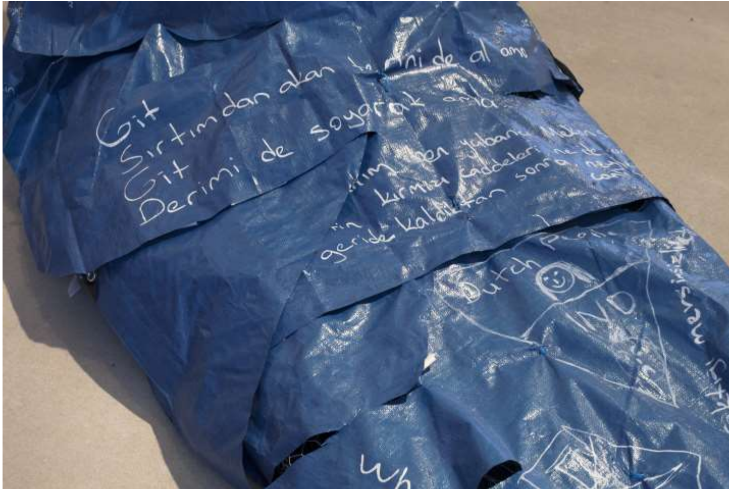
Shahmaran, 2017, Pvc, wire, 340 x 120 x 120 cm (detail), photo Wytse van Keulen