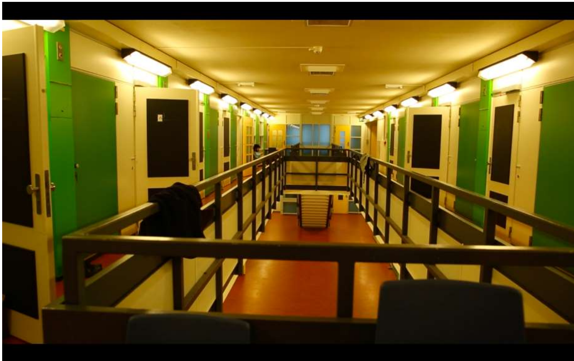
Embracing All the Strange , 2017, HD video 14 min