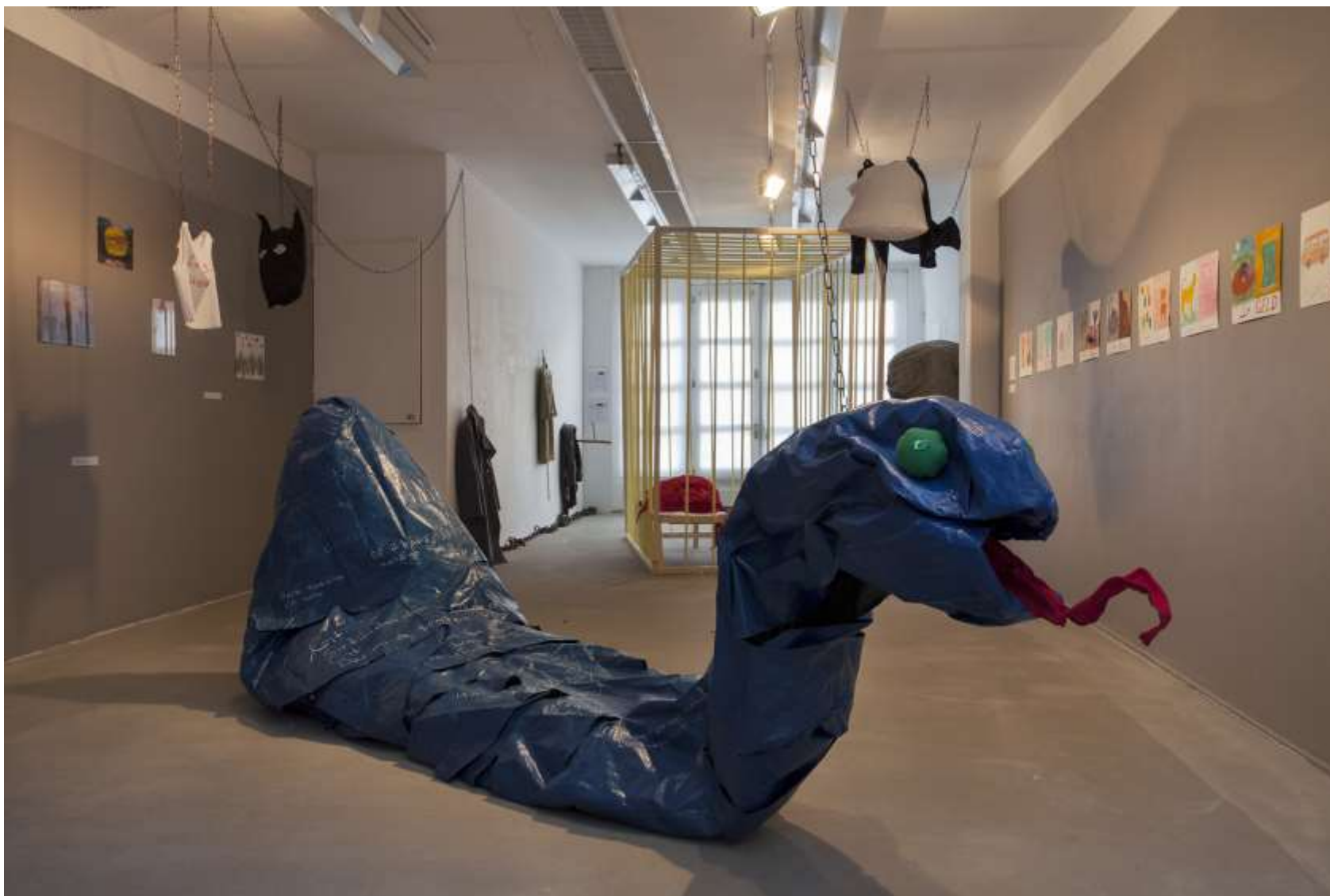
Shahmaran , 2017, Pvc, wire, 340 x 120 x 120 cm

Shahmaran is a mythological creature with origins in Turkey, Iran and Iraq. This creature has two faces: a beautiful woman and a snake. Introduced by Tuncay Korkmaz (Murad), a Kurdish writer and activist.