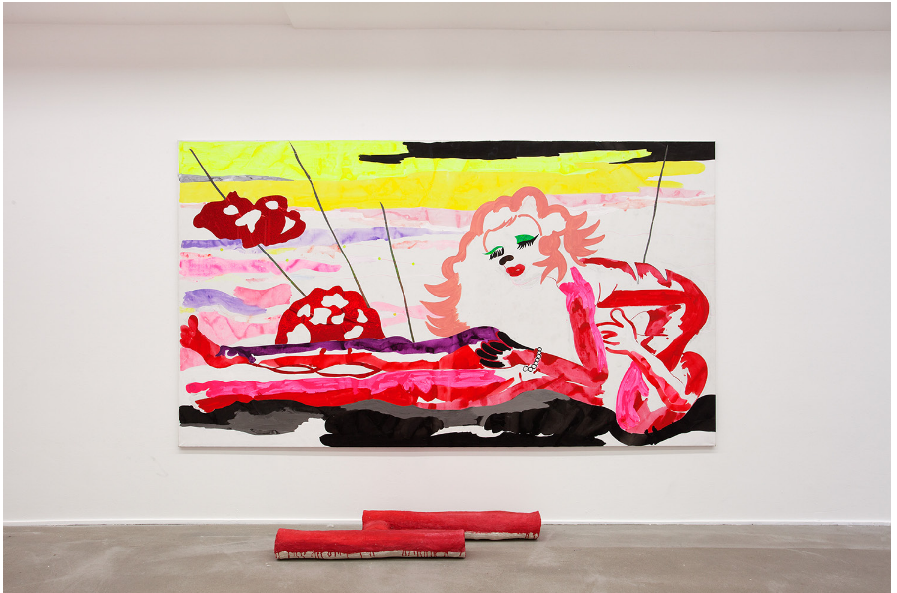
Rose, 2009, mixed materials on canvas and object of plaster 185 x 325 cm