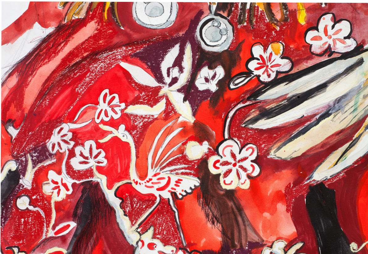
Lady Gaga (details), 2016, mixed materials on paper, 282 x 151cm