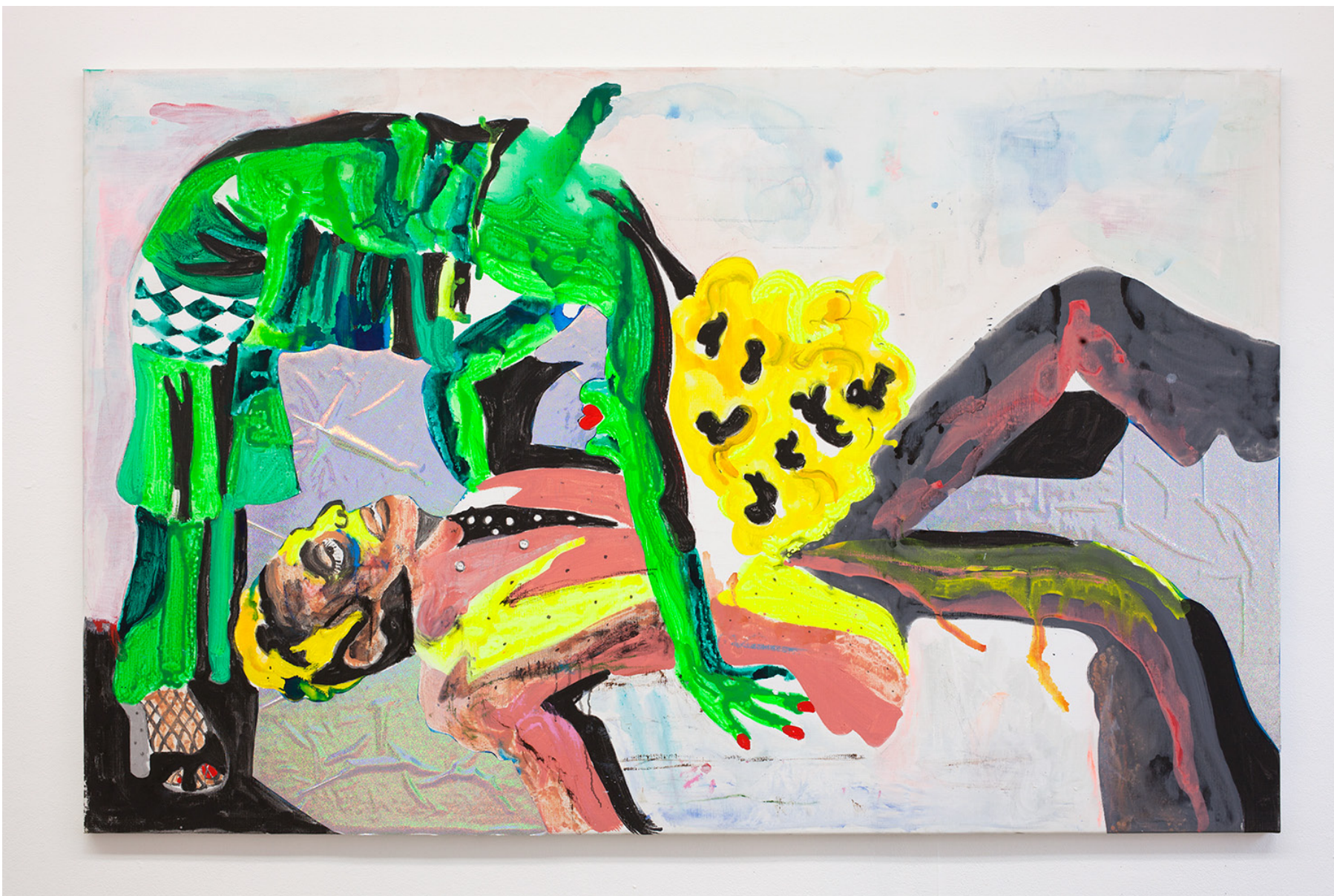
Green woman with man , 2018, mixed materials on canvas, 140 x 220 cm