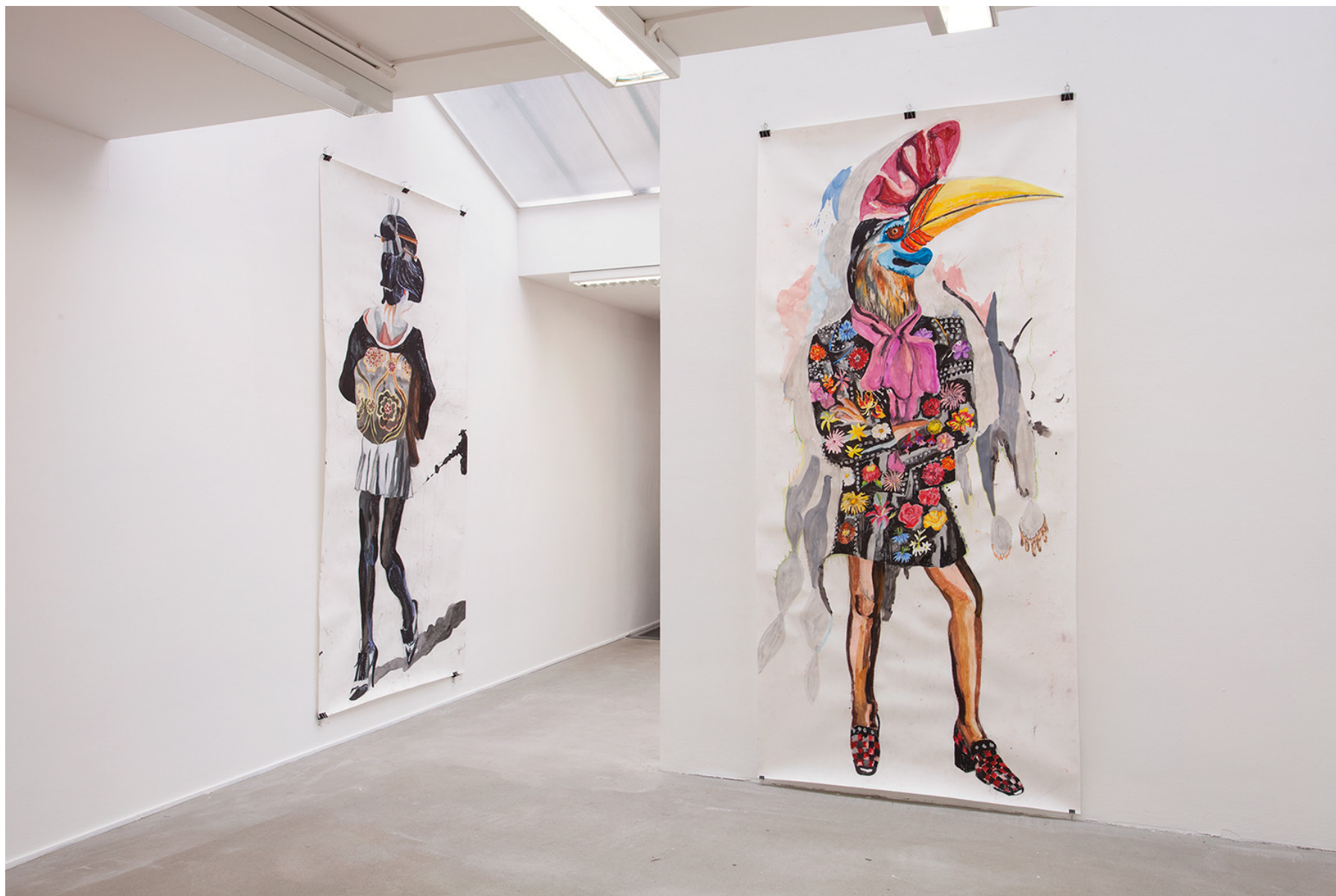
Travel Around the World in 6000 Days, 2018, Overview at AKINCI