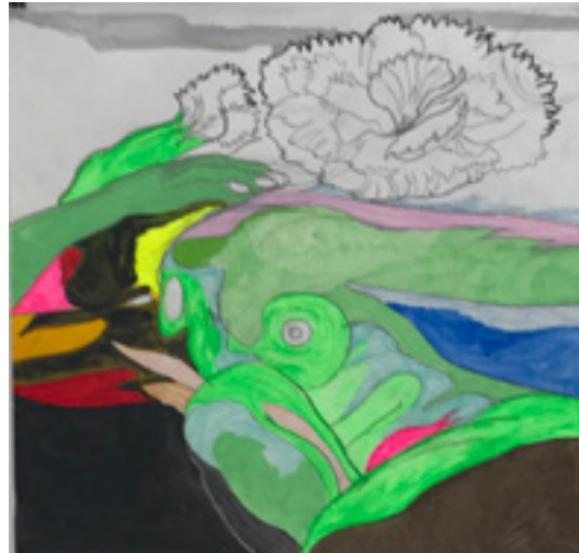
Untitled (flowers), 2012, mixed materials on paper, 43 x 45 cm