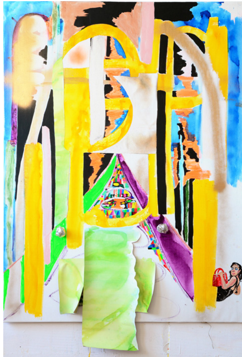
Pinball , 2017, mixed materials on canvas, 200 x 150cm