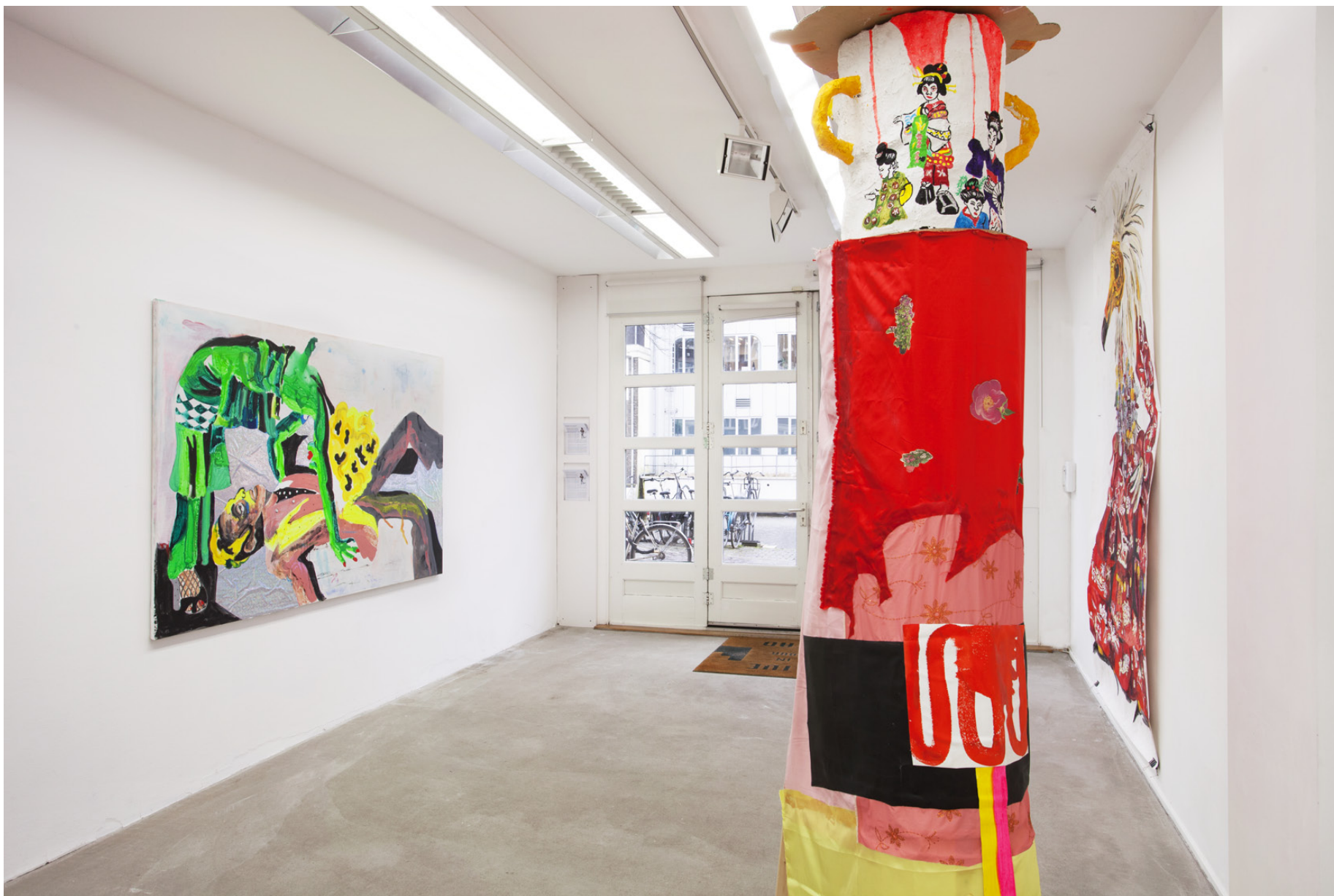
Travel Around the World in 6000 Days, 2018, Overview at AKINCI