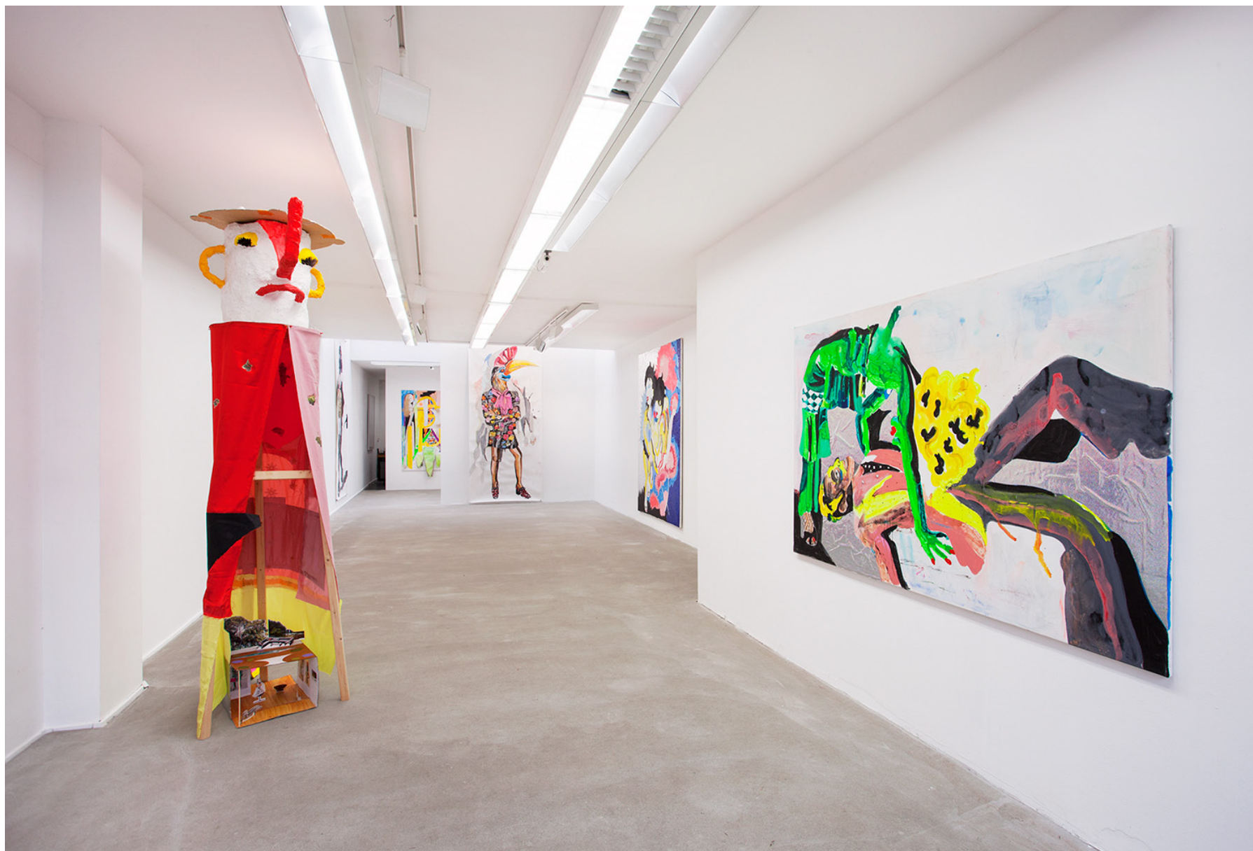
Travel Around the World in 6000 Days , 2018, Overview at AKINCI