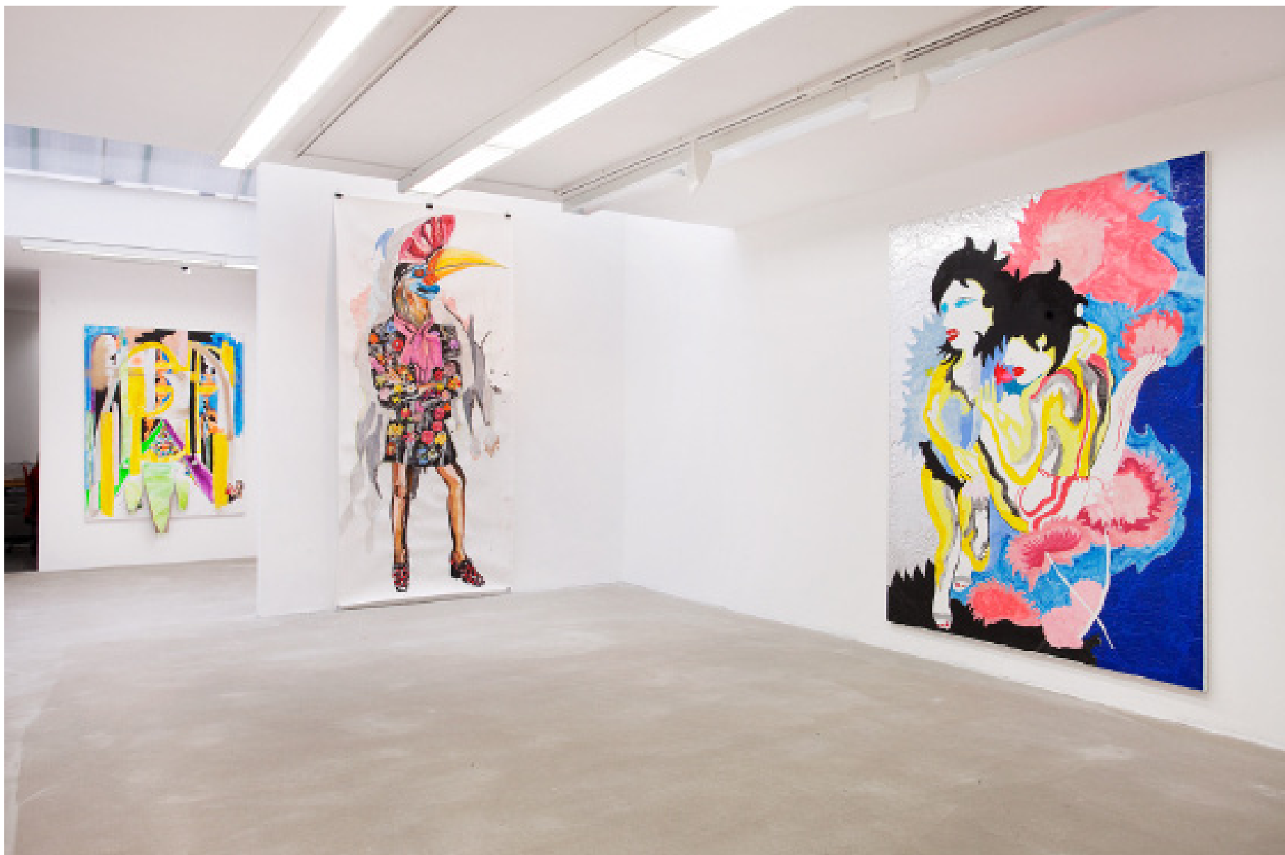
Travel Around the World in 6000 Days, 2018, Overview at AKINCI