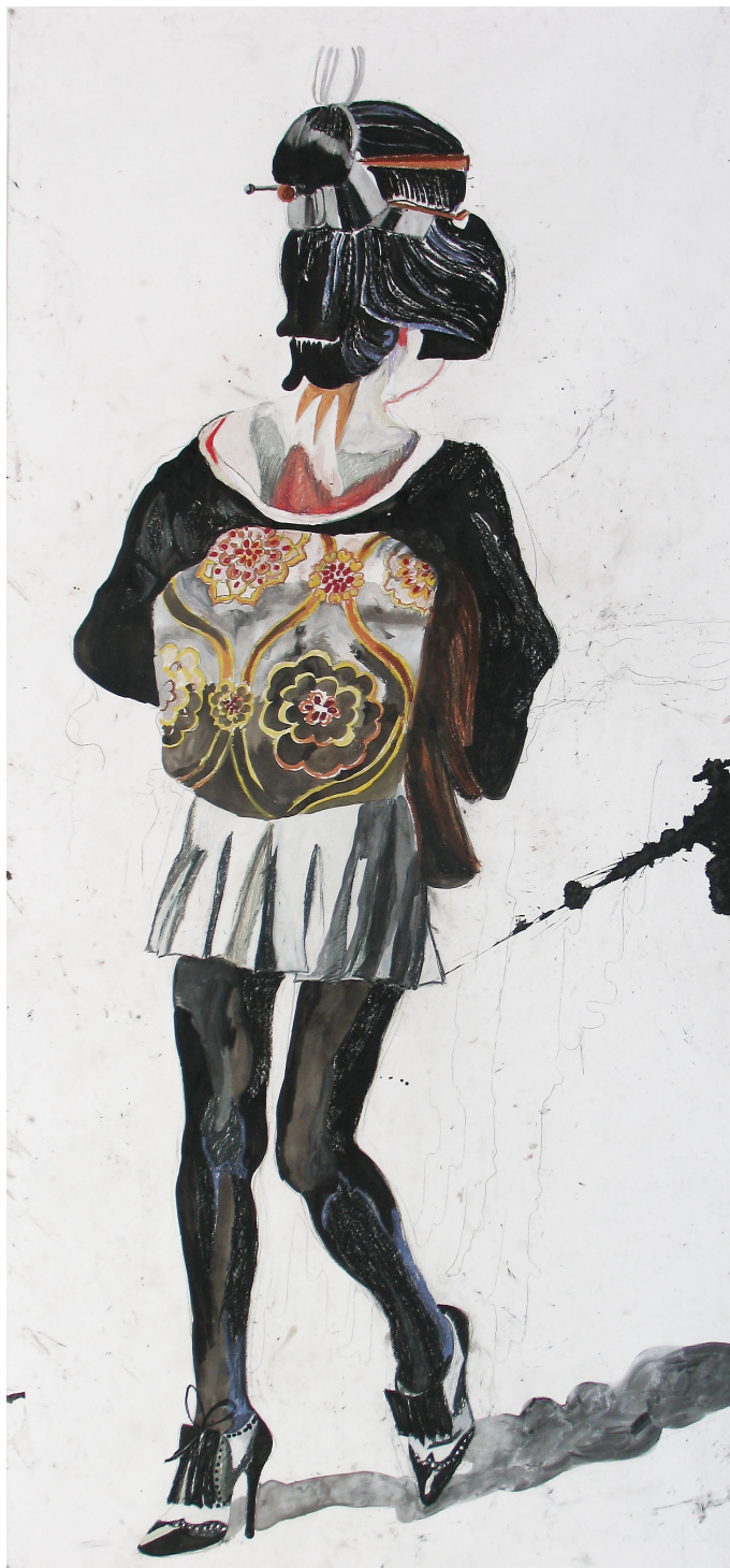
Going East or West , 2009, mixed materials on paper 300 x 150 cm