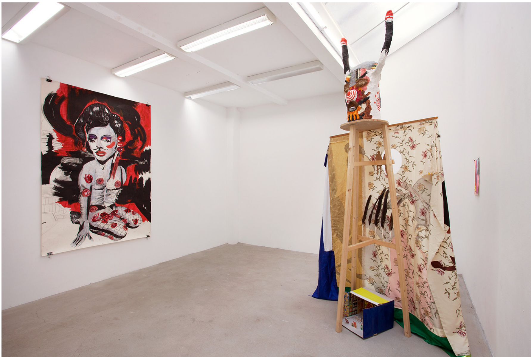
Travel Around the World in 6000 Days, 2018, Overview at AKINCI