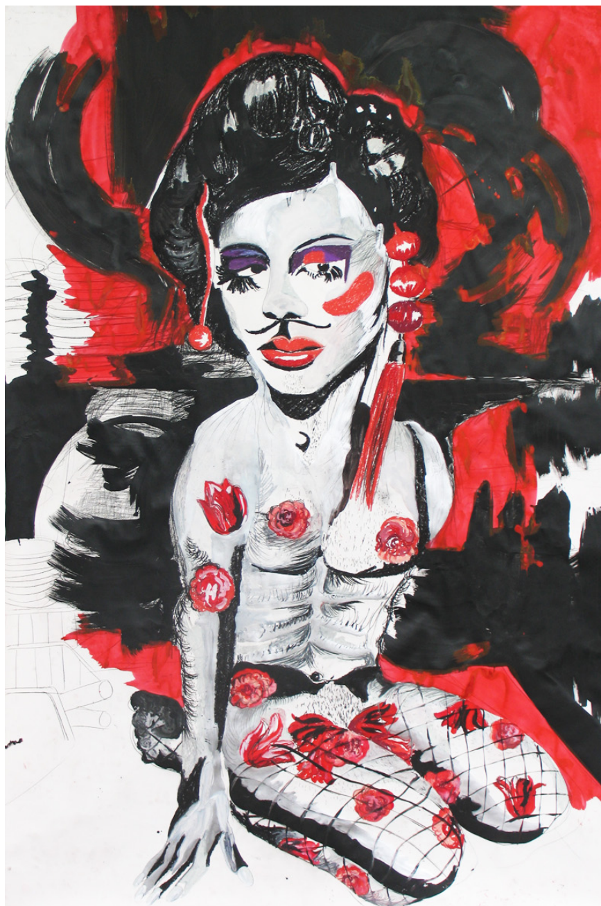
Geisha man/woman , 2006, mixed materials on paper, 225 x 150 cm