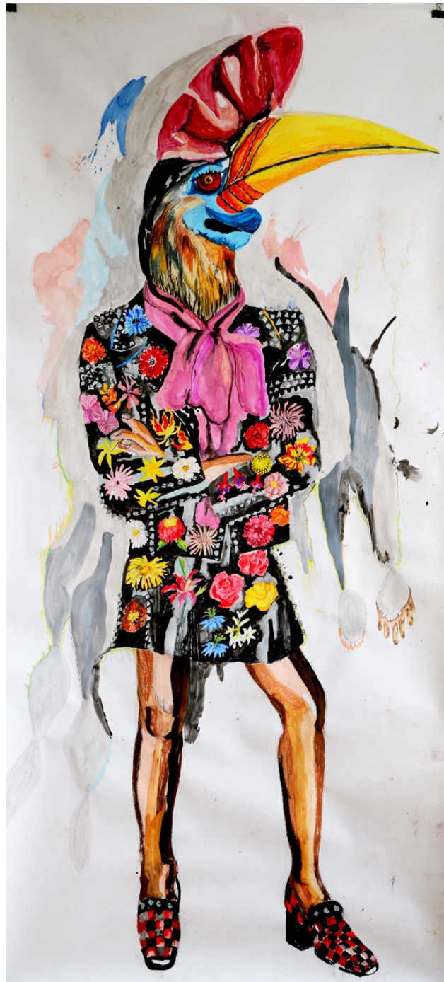
Mrs. Hornbill , 2017, mixed materials on paper, 323 x 150cm