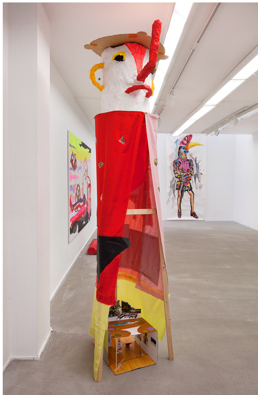
Japanese man , 2016, wood, textile, paper, 220 x 68 x 60cm