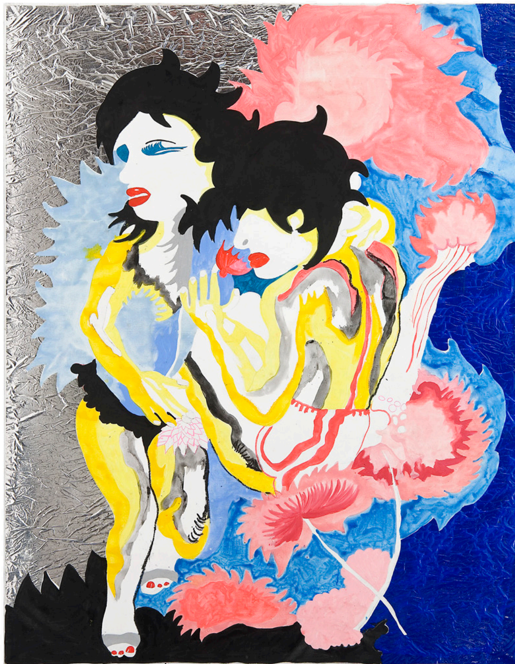
Spring , 2010, mixed materials on canvas, 255 x 200cm