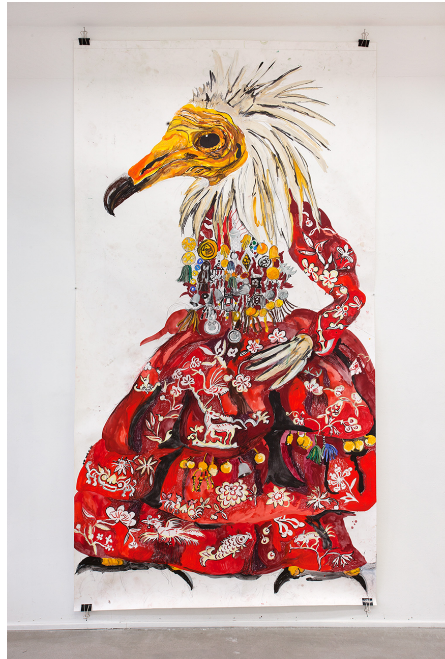
Lady Gaga , 2016, mixed materials on paper, 282 x 151cm