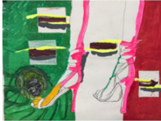
Untitled (shoes), 2016, mixed materials on paper, 50 x 65 cm