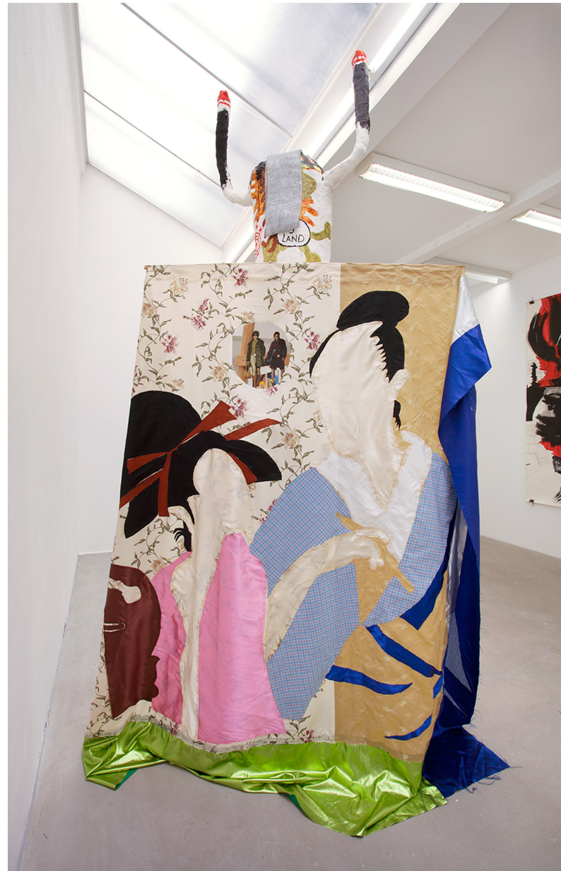
Japanese Warrior , 2016, wood, plaster, textile, 300 x 150 x 52cm