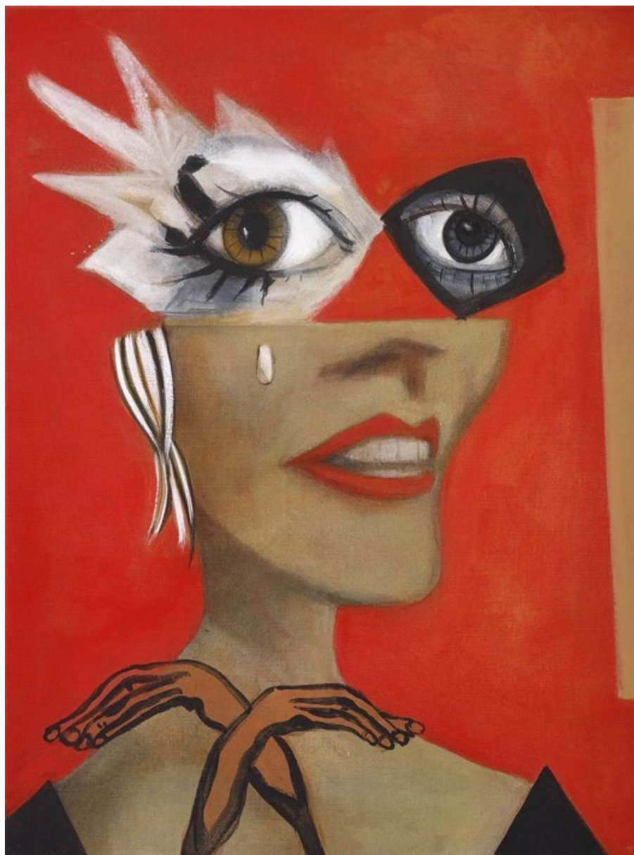
Untitled (Red Head), 2017, distemper on canvas, 60 x 45 cm