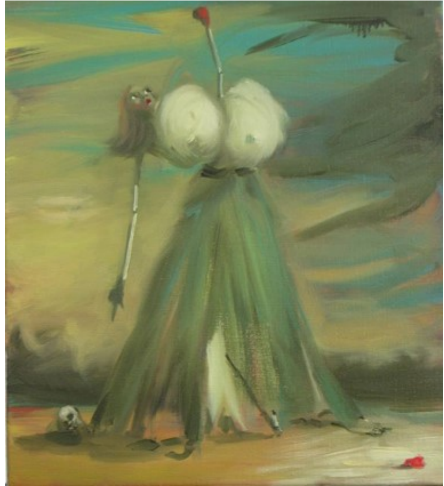
The birth of the Idea (study) 2010, oil on linen, 50 x 45 cm