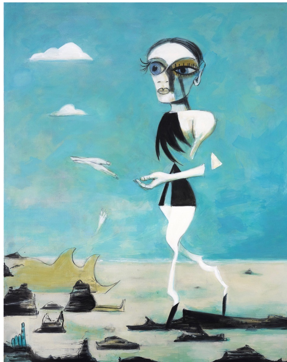
The Bather , 2017, distemper on canvas, 150 x 120 cm Collection Museum Arnhem, The Netherlands