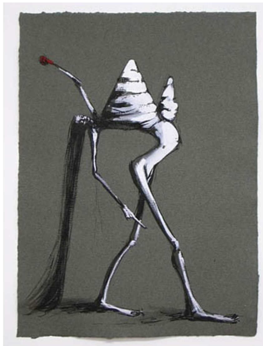
Supernova (Neutron) 2011, gouache on St. Armand, 50 x 37 cm