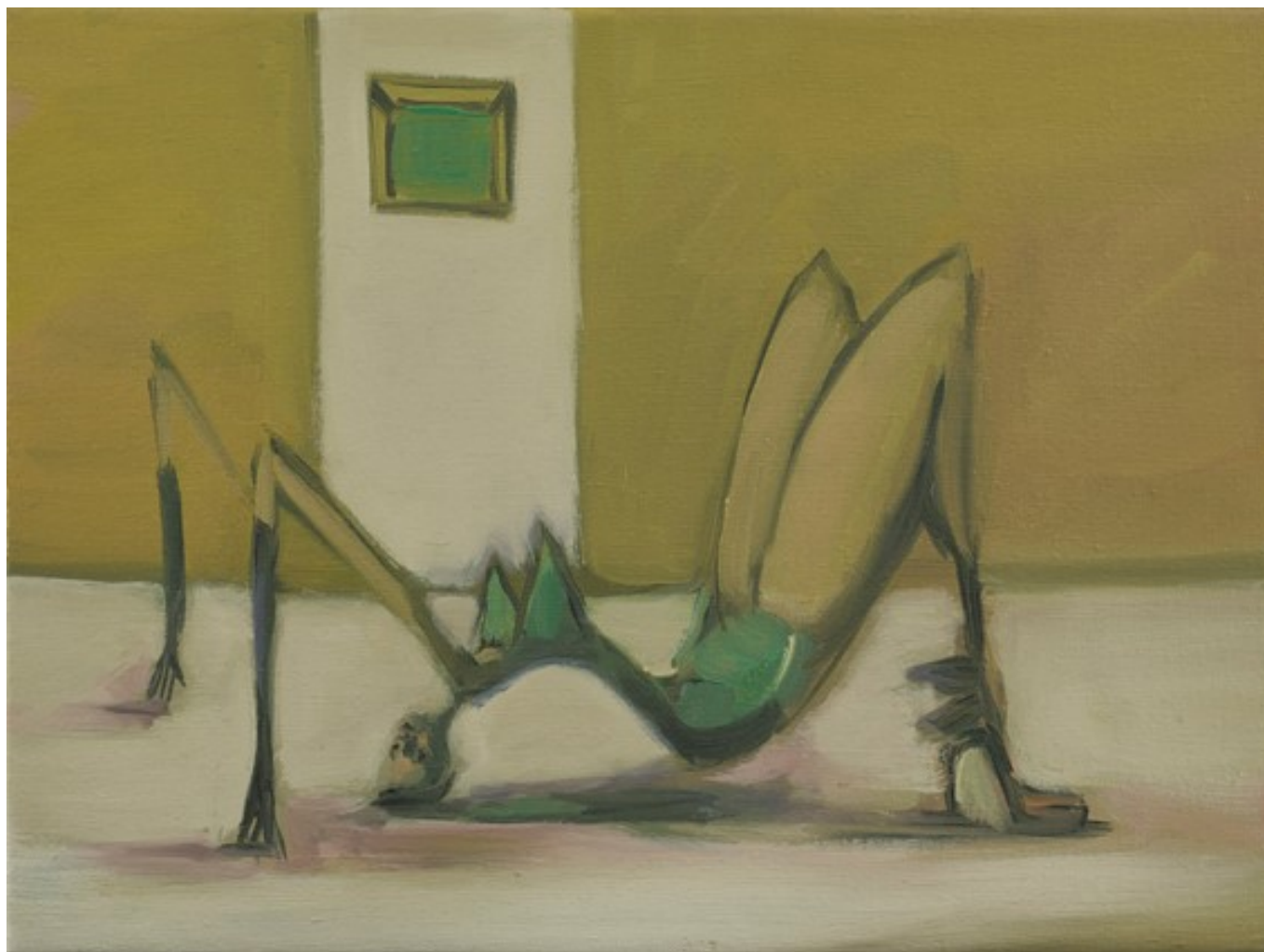
Little Body 2015, oil on linen, 30 x 40 cm