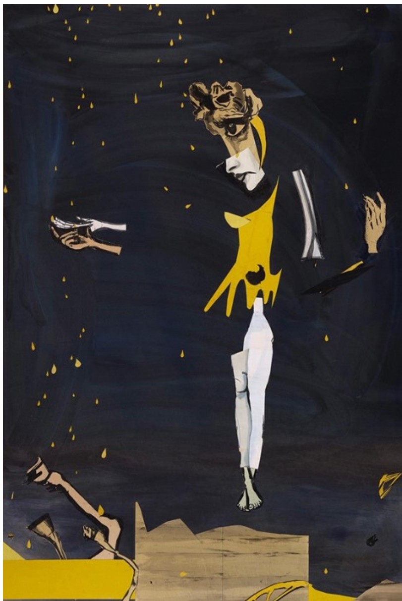
Tear 42, 2018, ink/gouache on paper, 145 x 98 cm