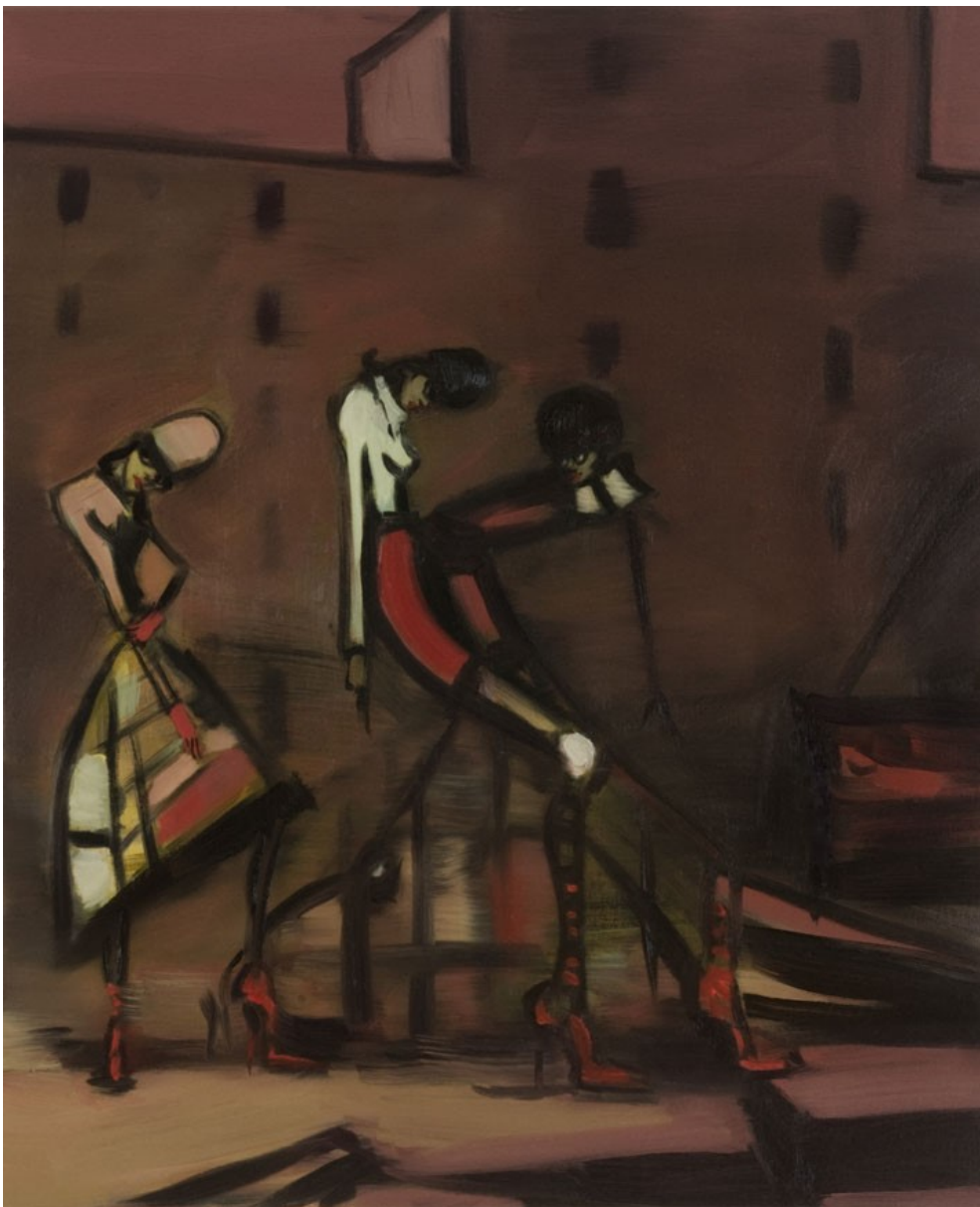
Heart of Glass 2013, oil on linen, 90 x 75 cm