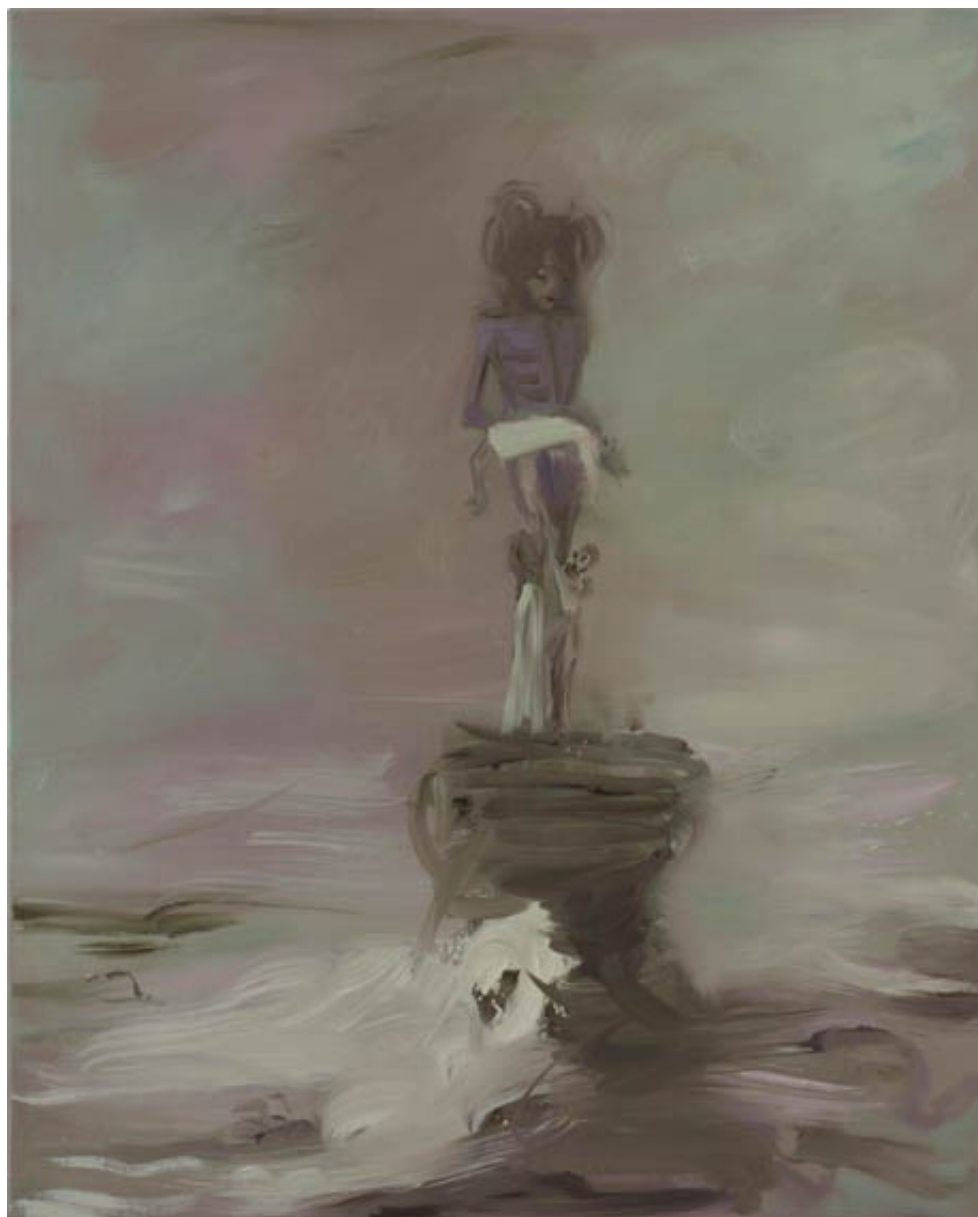
A memory of snow 2009, oil on linen, 80 x 65 cm