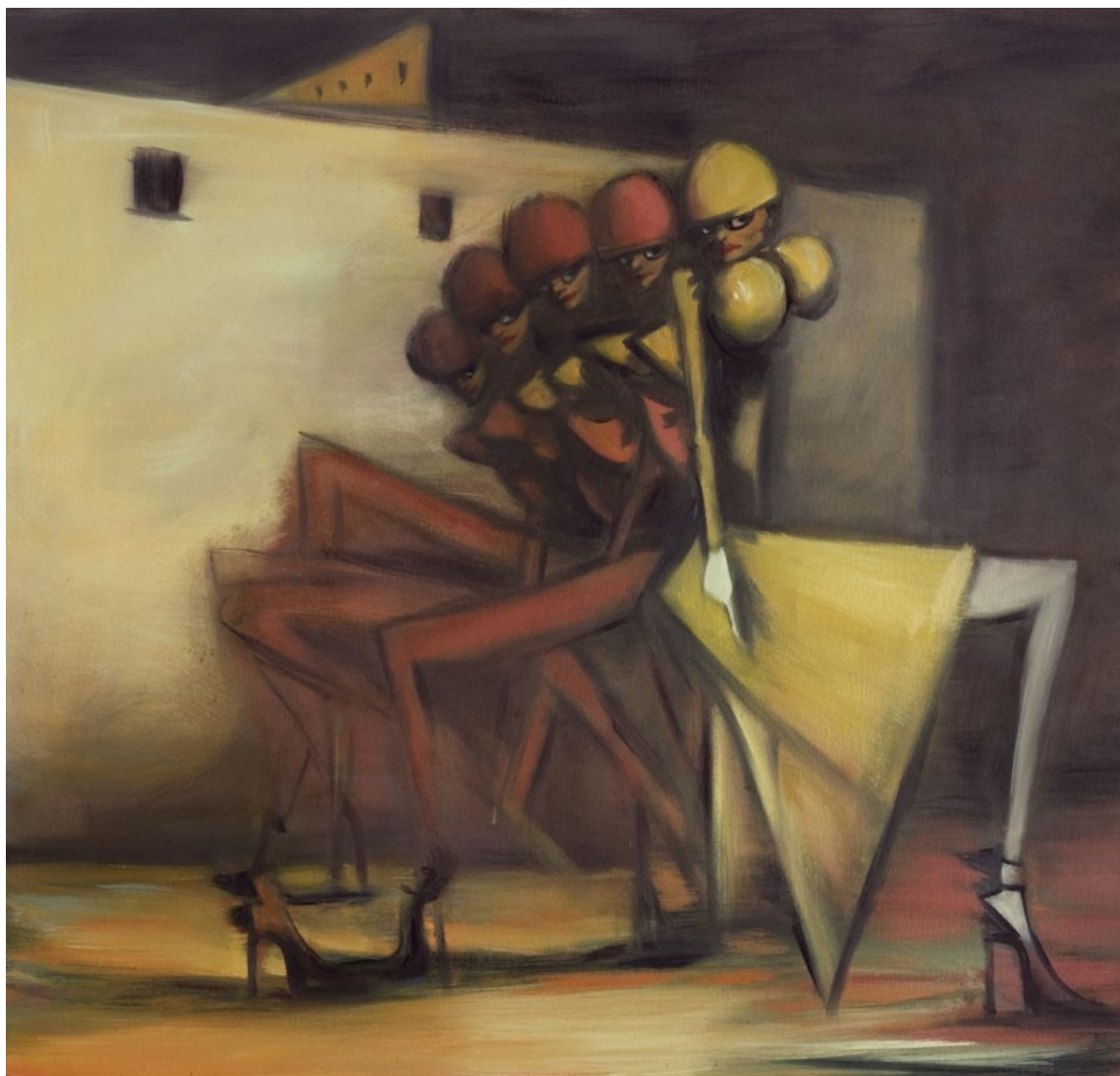
Cracking 2012, oil on linen, 120 x 130 cm