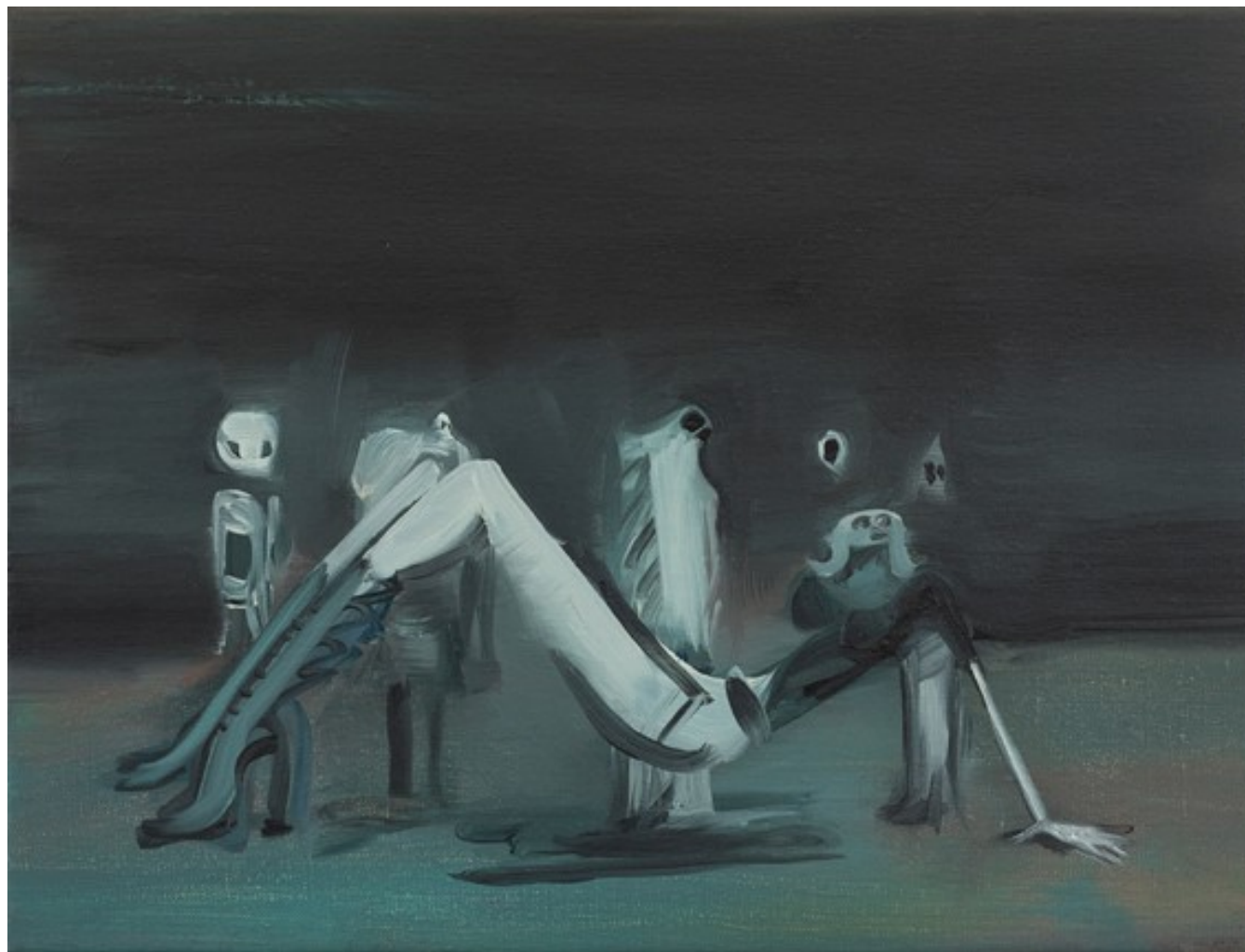
Imagined Blue 2015, oil on linen, 30 x 40 cm