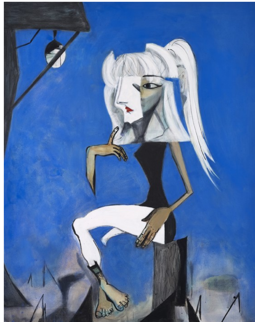
Seated Woman, 2017, distemper on canvas, 150 x 120 cm 2007, oil on linen, 35 x 40 cm

Moyna Flannigan (1963, Kirkcaldy, Scotland) studied at the Edinburgh College of Art and received her MFA at the Yale University School of Art. Her work has been exhibited in galleries and museums in the United Kingdom and abroad, including the Scottish National Gallery of Modern Art, Edinburgh (2018), UK Scotland Gallery of Modern Art, Glasgow (UK, 2014), the Pizzuti Collection, Ohio (USA, 2012), Scottish National Gallery of Modern Art, Edinburgh (UK, 2010), Mackintosh Museum, Glasgow (UK, 2012), City Art Centre, Edinburgh (UK, 2012), Van Abbe Museum, Eindhoven (NL, 2011), Andy Warhol Museum (USA, 2010), Stephen Friedman Gallery, London (UK, 2009).