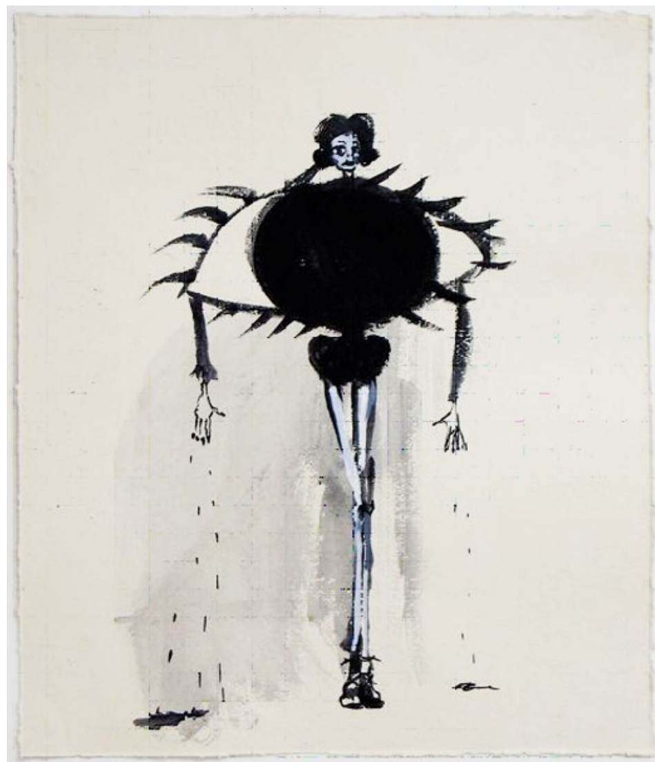
Supernova (Sight) 2011, ink and gouache on Khadi, 50 x 42 cm