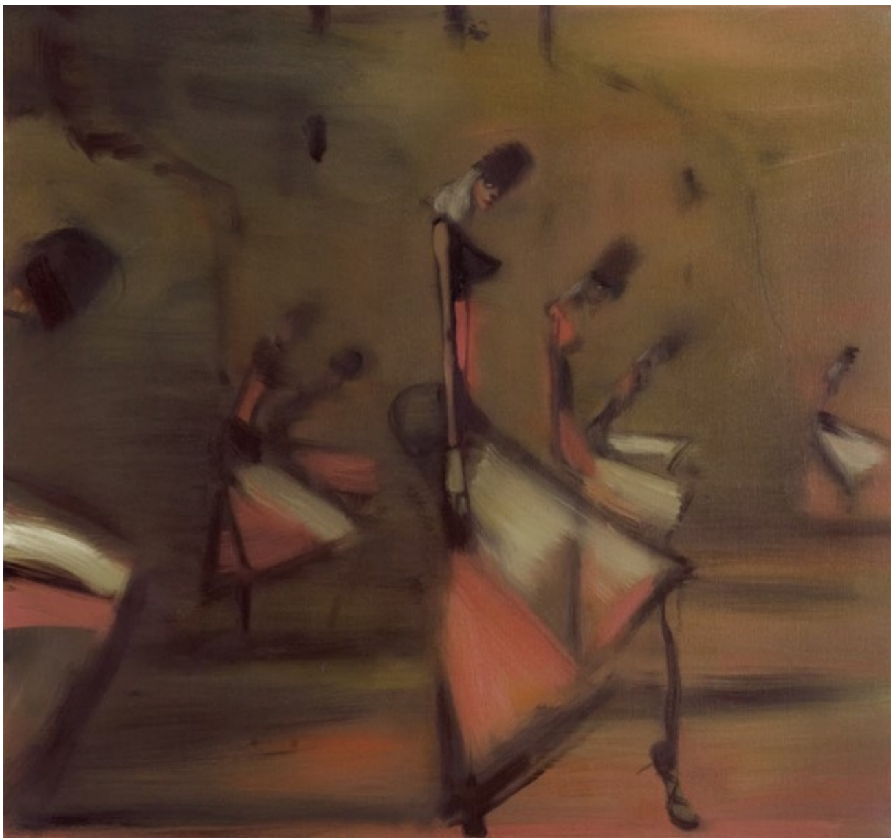
Goodbye If You Call That Gone 2013, oil on linen, 65 x 70 cm