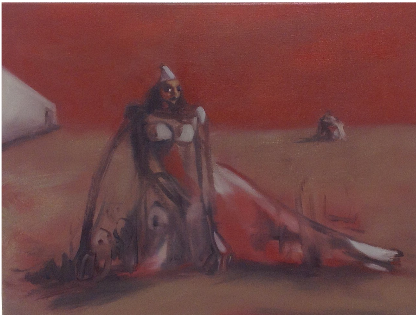
Memphis Pastoral 2015, oil on linen, 45 x 60 cm