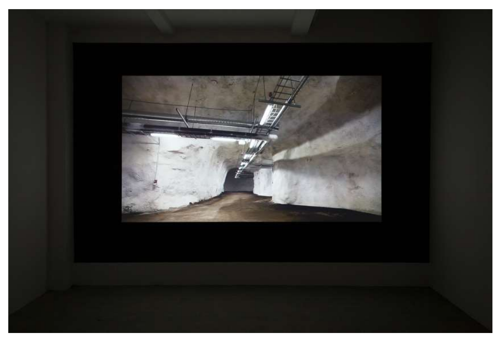
Safe, 2016, HD video, 3:18 min. Ali Kazma, Safe, overview AKINCI, Amsterdam, 2017