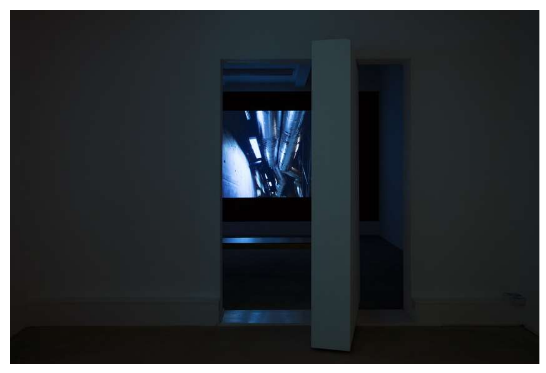
Safe, 2016, HD video, 3:18 min. Ali Kazma, Safe, overview AKINCI, Amsterdam, 2017