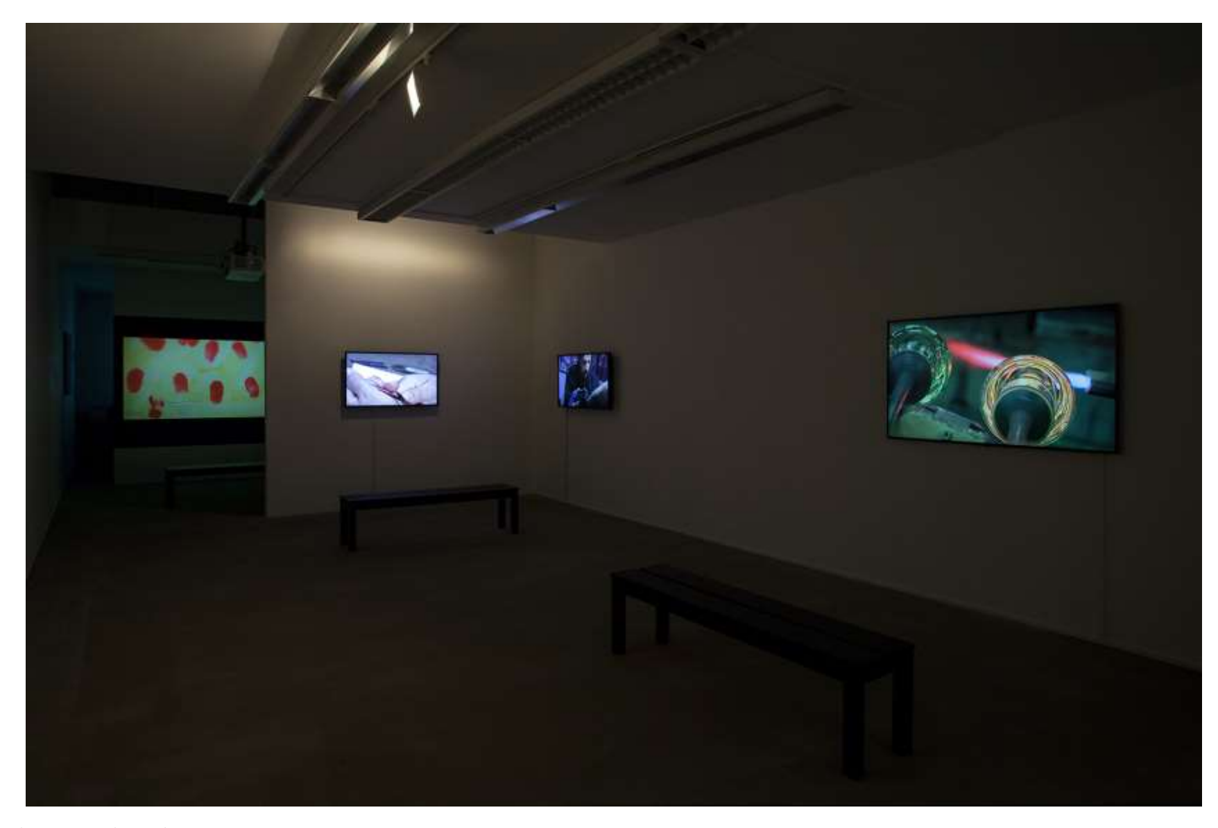
Home, Calligraphy, Tattoo and Crystal Ali Kazma, Safe, overview AKINCI, Amsterdam, 2017