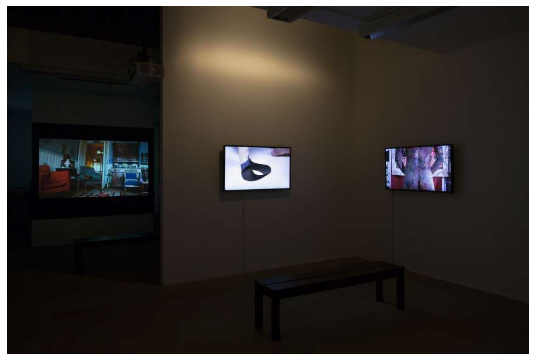
Home, Calligraphy, Tattoo Ali Kazma, Safe, overview AKINCI, Amsterdam, 2017