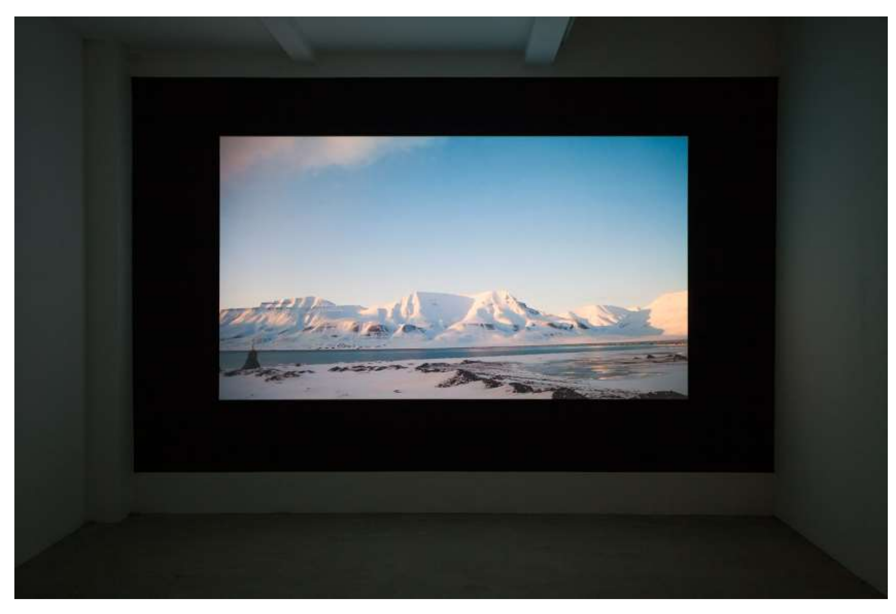
Safe, 2016, HD video, 3:18 min. Ali Kazma, Safe, overview AKINCI, Amsterdam, 2017