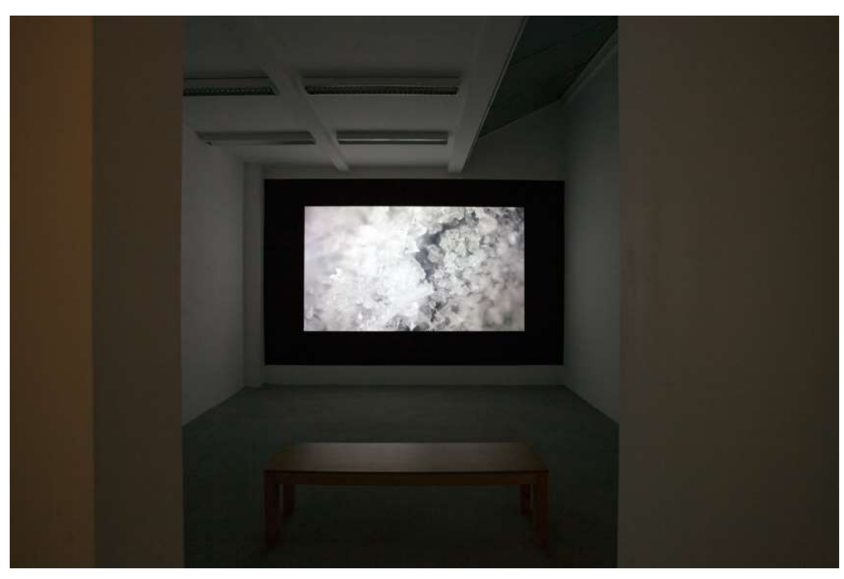
Safe, 2016, HD video, 3:18 min. Ali Kazma, Safe, overview AKINCI, Amsterdam, 2017