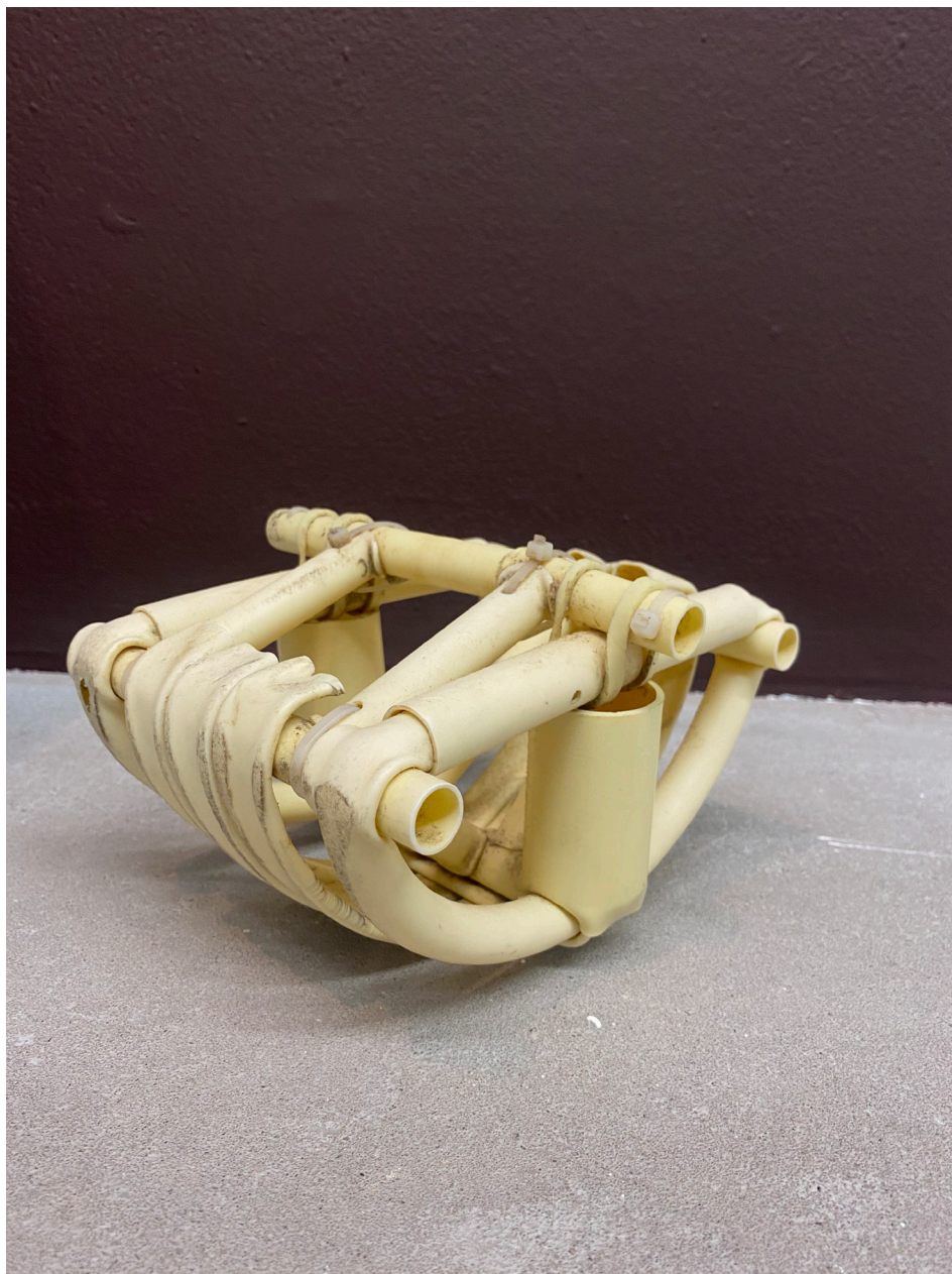
Animaris Ordis (voet/schoen), PVC tube, tiewrap, 20x19x13 cm (tegenwoordig lopen de Strandbeesten weer op blote voeten)