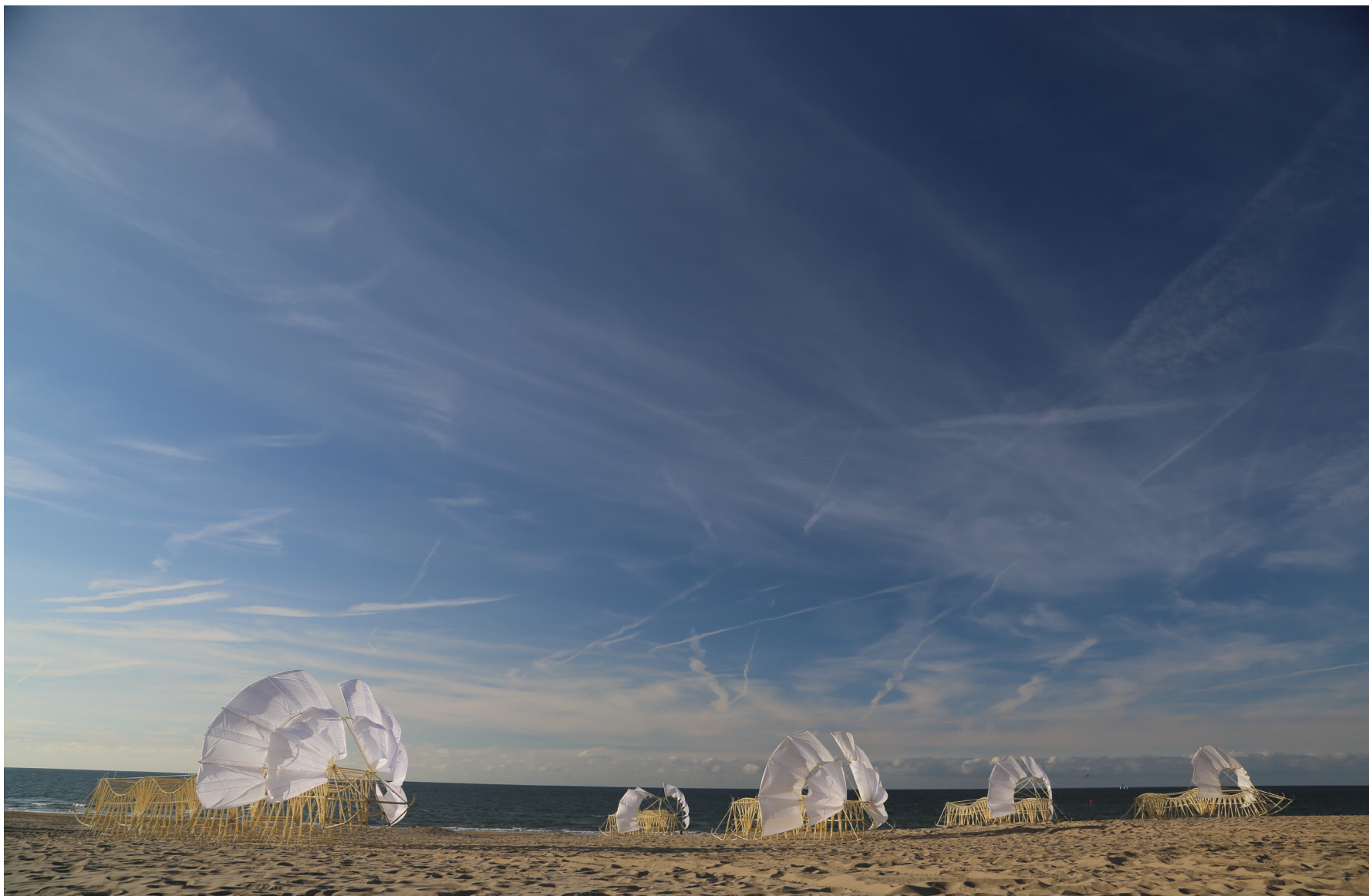
A flock of Animaris Uminami at the beach Animaris Uminami , PVC tube, tiwrap, 620 x 80 x 120 cm