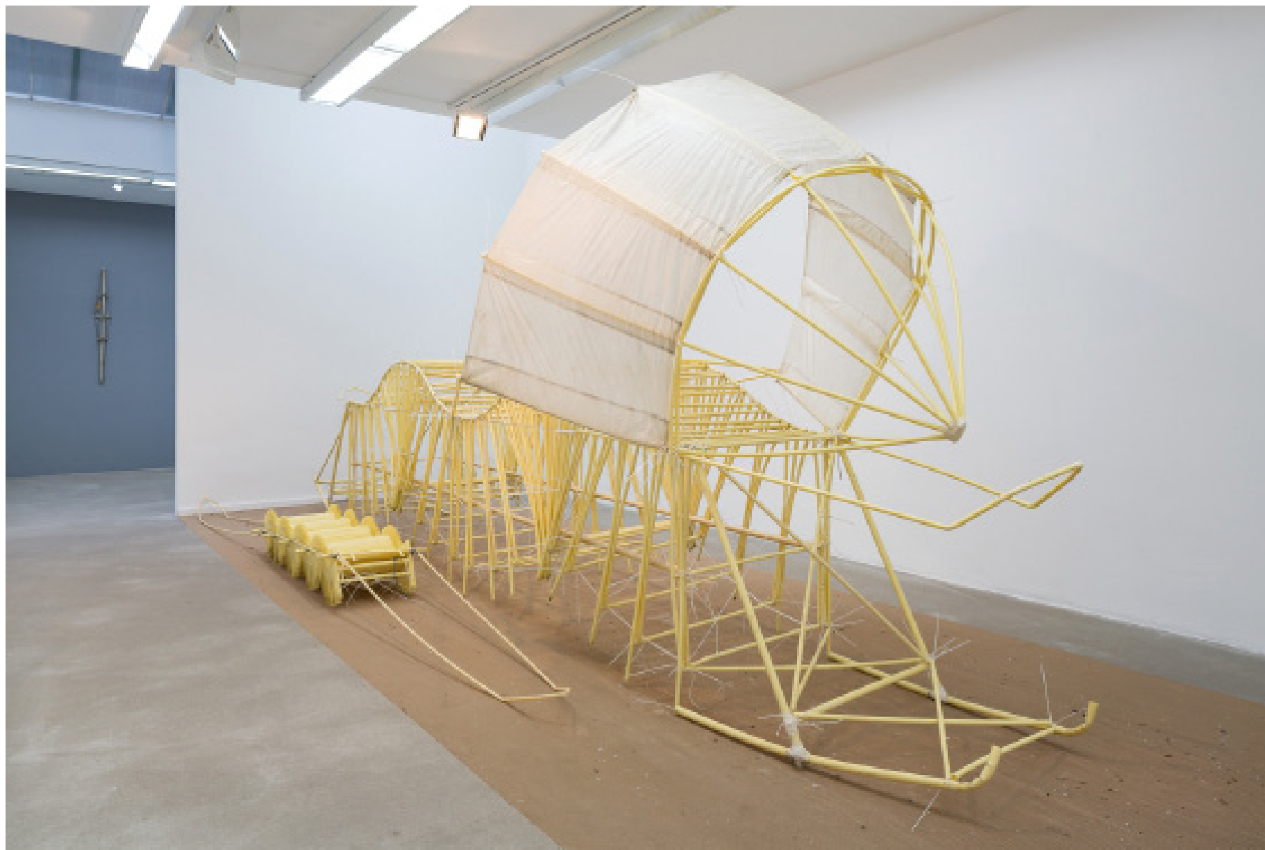
Animaris Uminami : 620 x 80 x 120 cm

Exhibition view ANIMARIS at AKINCI, 2020 (photo: Peter Tjihuis), Animaris Uminami was modified according to the space.