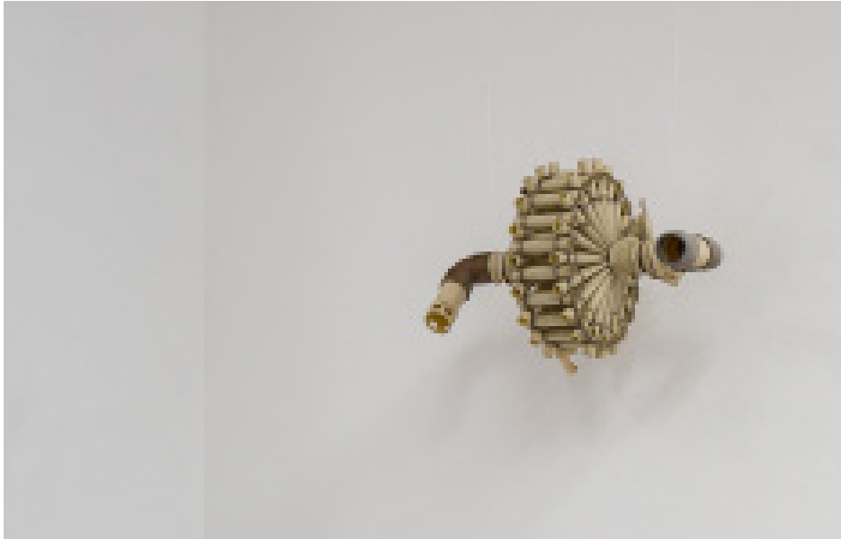
Gear Wheel (Animaris Rectus) , 2006, PVC tube, tiwrap, 26 x 45 x 30 cm