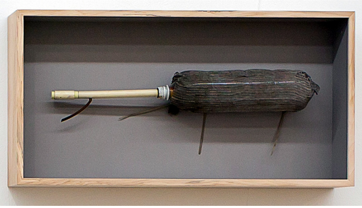
Fossilium Ventus Stomachum -IV, 2011, fossil from Animaris Vermiculus, 75 x 12x35 cm