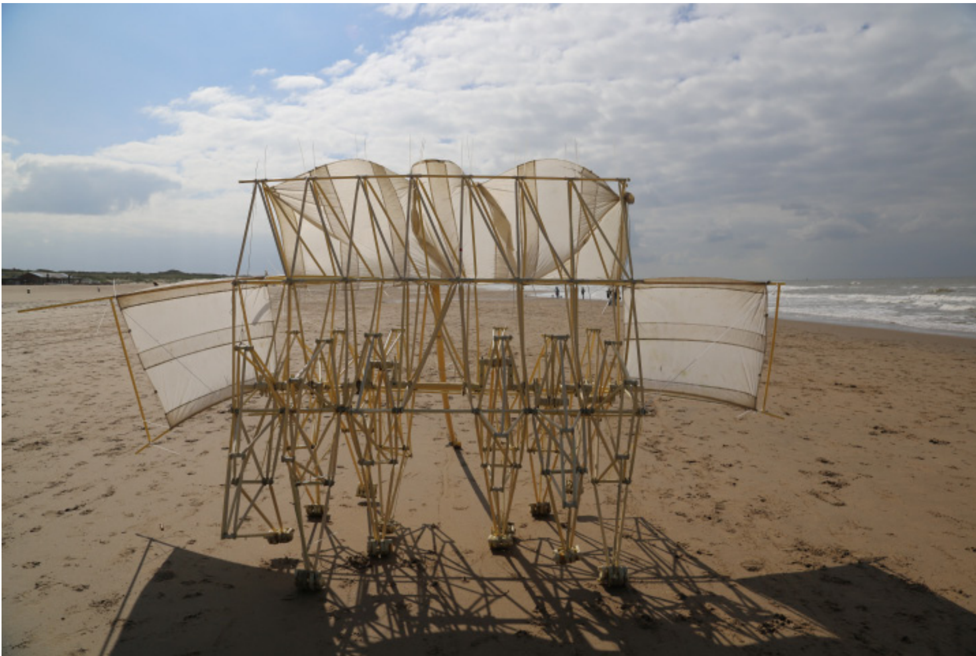
Animaris Ordis , 2006, Pvc, textile, tie wrap, 417 × 205 × 190 cm

Watch a video of Animaris Ordis at the beach here