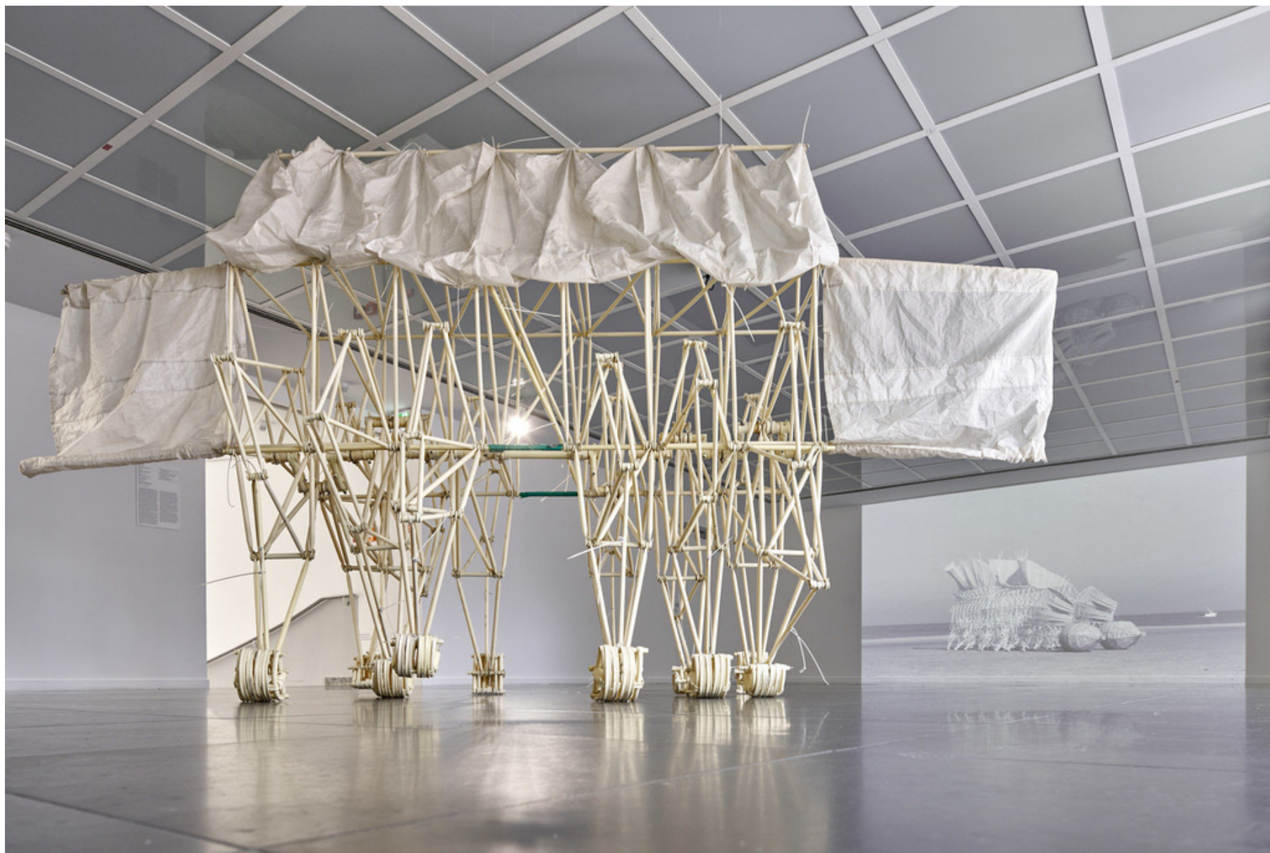
Animaris Ordis , 2006, Pvc, textile, tie wrap, 417 × 205 × 190 cm Exhibition view at Frankfurter Kunstverein, 2019, (photo by Norbert Miguletz)

Watch a video of Ordis being walked here