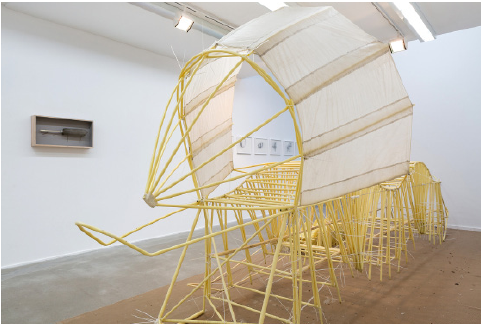
Animaris Uminami , PVC tube, twowrap, 620 x 80 x 120 cm, exhibition view ANIMARIS at AKINCI, 2020 Animaris Uminami was modified according to the space.