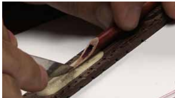
Calligraphy, (film still), 2013, full HD video, 5:50 min.