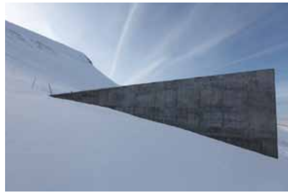
Safe, (film still), 2016, full HD video, 3:18 min.

AKINCI is proud to present six of Ali Kazma's films, amongst which the appraised video works 'Home' and 'Clerk', and a selection from his Resistance series, including 'Tattoo' – first exhibited at the Turkish Pavilion during the 55 th Venice Biennale. We are especially excited to première Kazma's new film 'Safe', depicting the Global Seed Vault situated in the Svalbard Islands, which is designed to serve as a back-up repository for seeds in case of local or global man-made and/or natural catastrophe. The suspense in 'Safe' is so dense it is close to physically stifling. Indeed, to look at Kazma's films is to become fixated in a gaze that feels, almost compulsory, like touching with your eyes . This physical sensation is consequential of Kazma's close apprehension of the human body and its activity. Through his framing and montage he captures both the physical and philosophical dimension of the condition humaine ; in labour, economy, production, social organisation, and time.