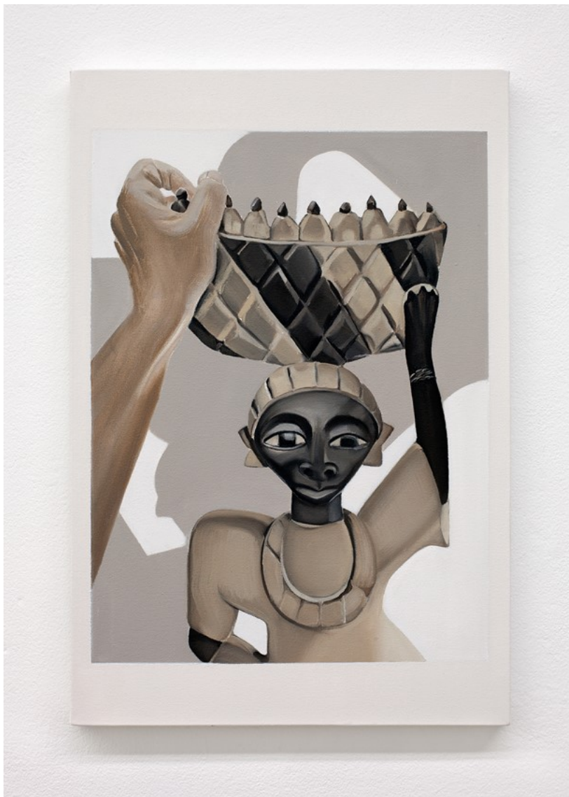
Encounter II , 2017, oil on canvas, 40 x 60 cm