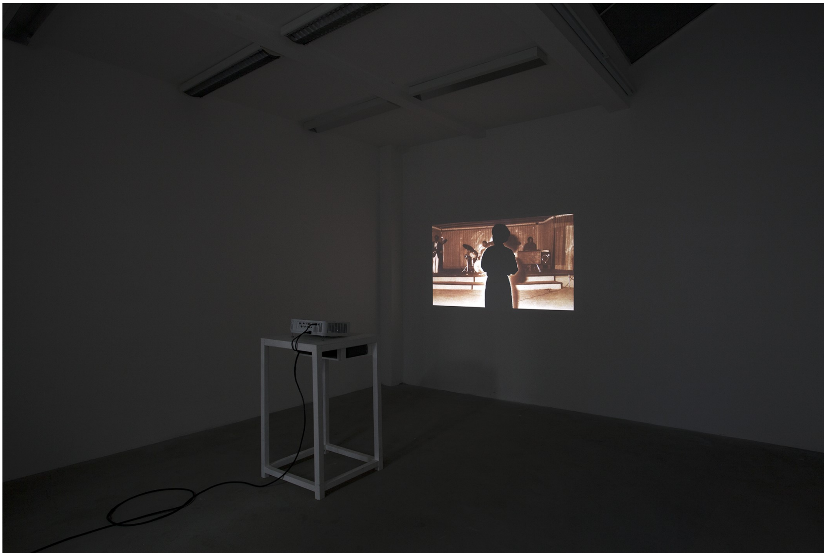
Parabéns, 2017, video, 4:07 minutes Installation view at AKINCI, 2017