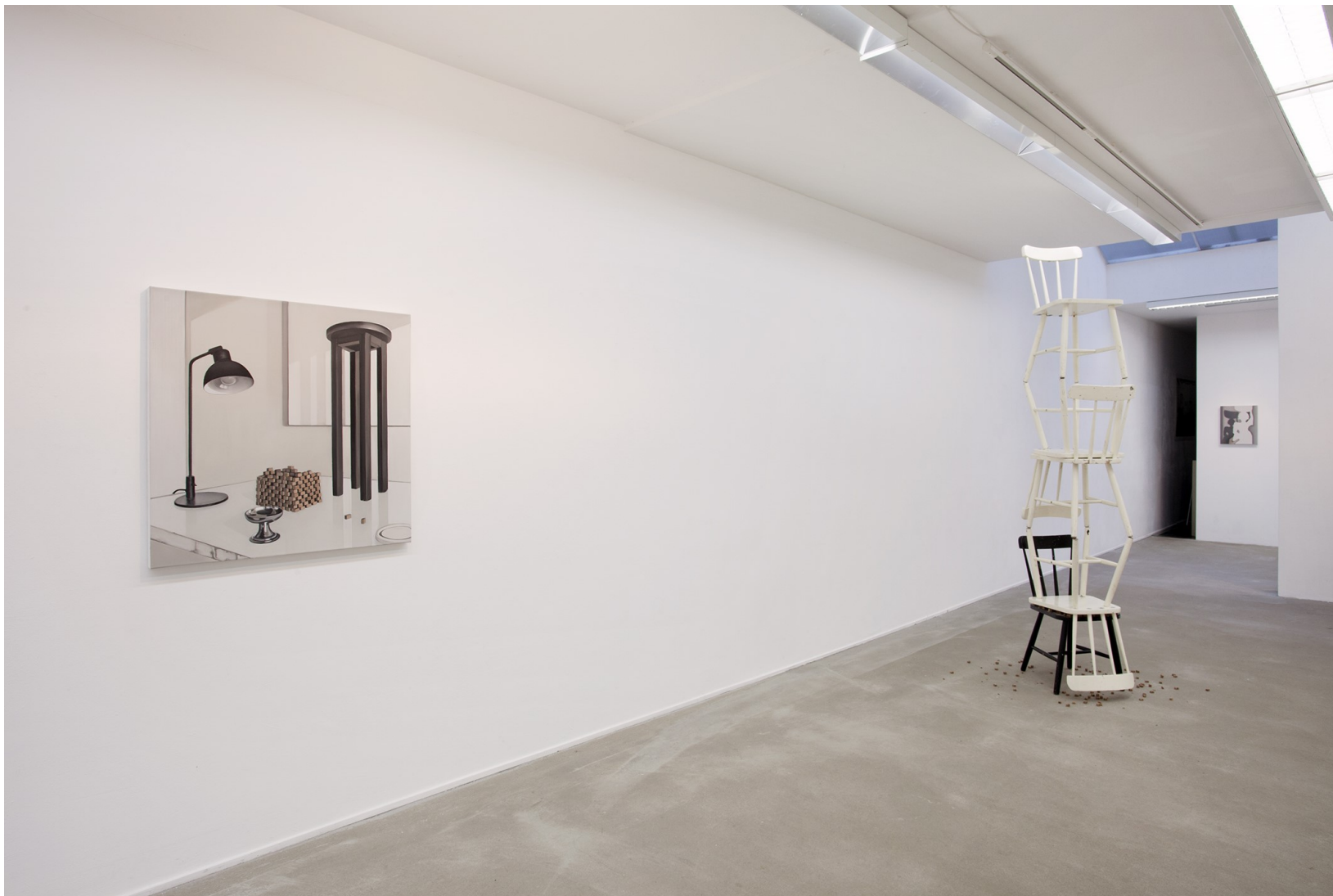
Overview Parabéns , AKINCI, 2017