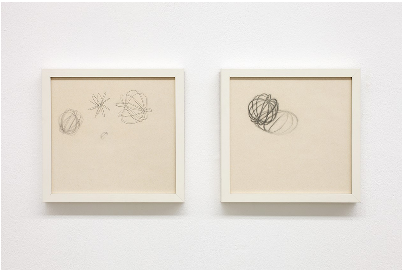
World I & II , 2017, pencil on paper, 2 x 32,5 x 31,5