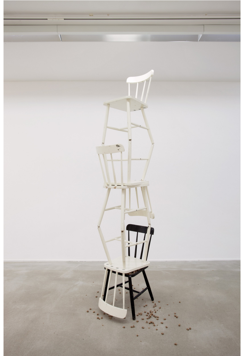
Assemblage I , 2017, 5 used Ikea chairs and brown sugar cubes, 40 x 70 x 260 cm Installation view Parabéns , AKINCI