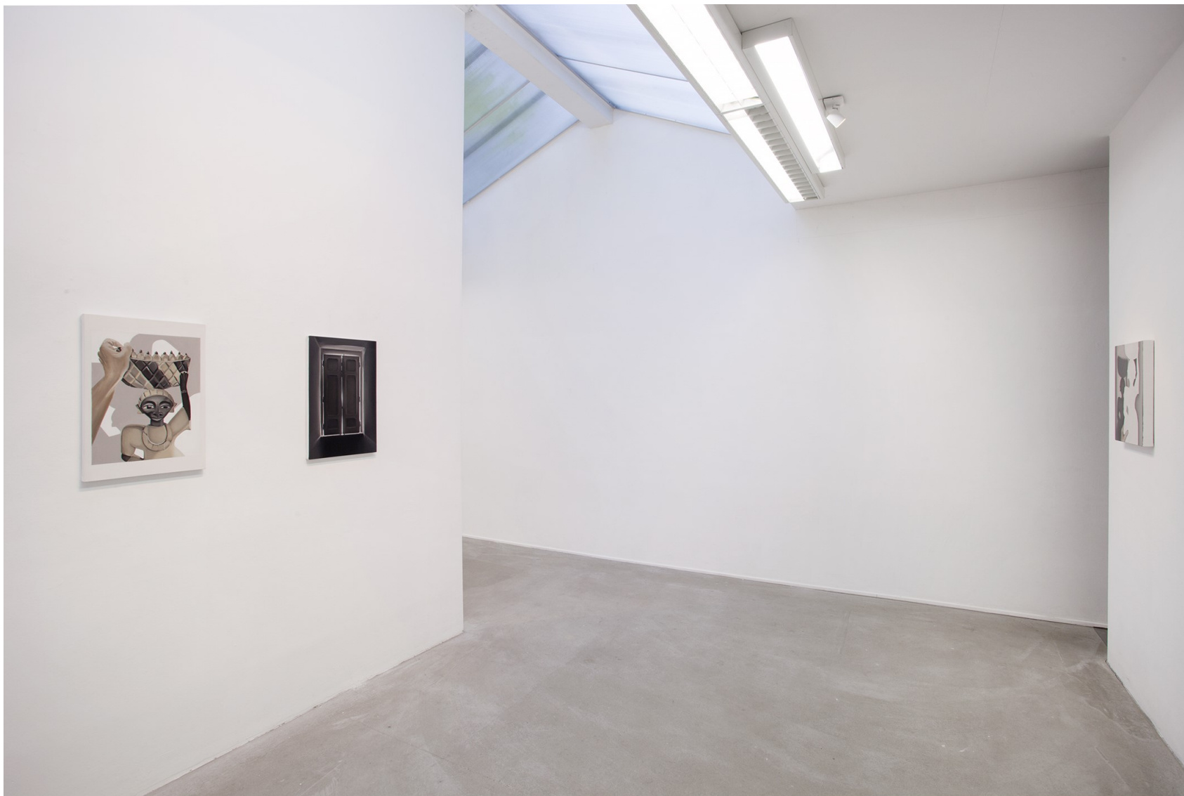
Overview Parabéns , AKINCI, 2017