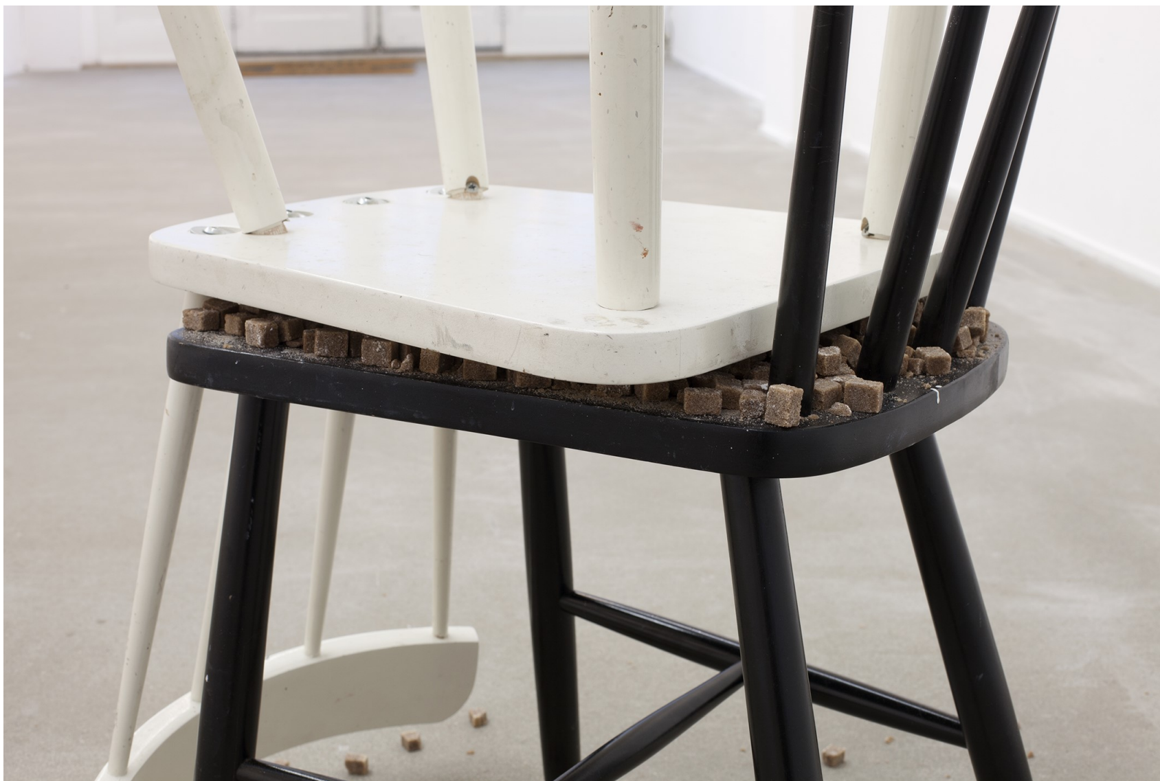
Assemblage I (detail) , 2017, 5 used Ikea chairs and brown sugar cubes, 40 x 70 x 260 cm, Installation view Parabéns , AKINCI