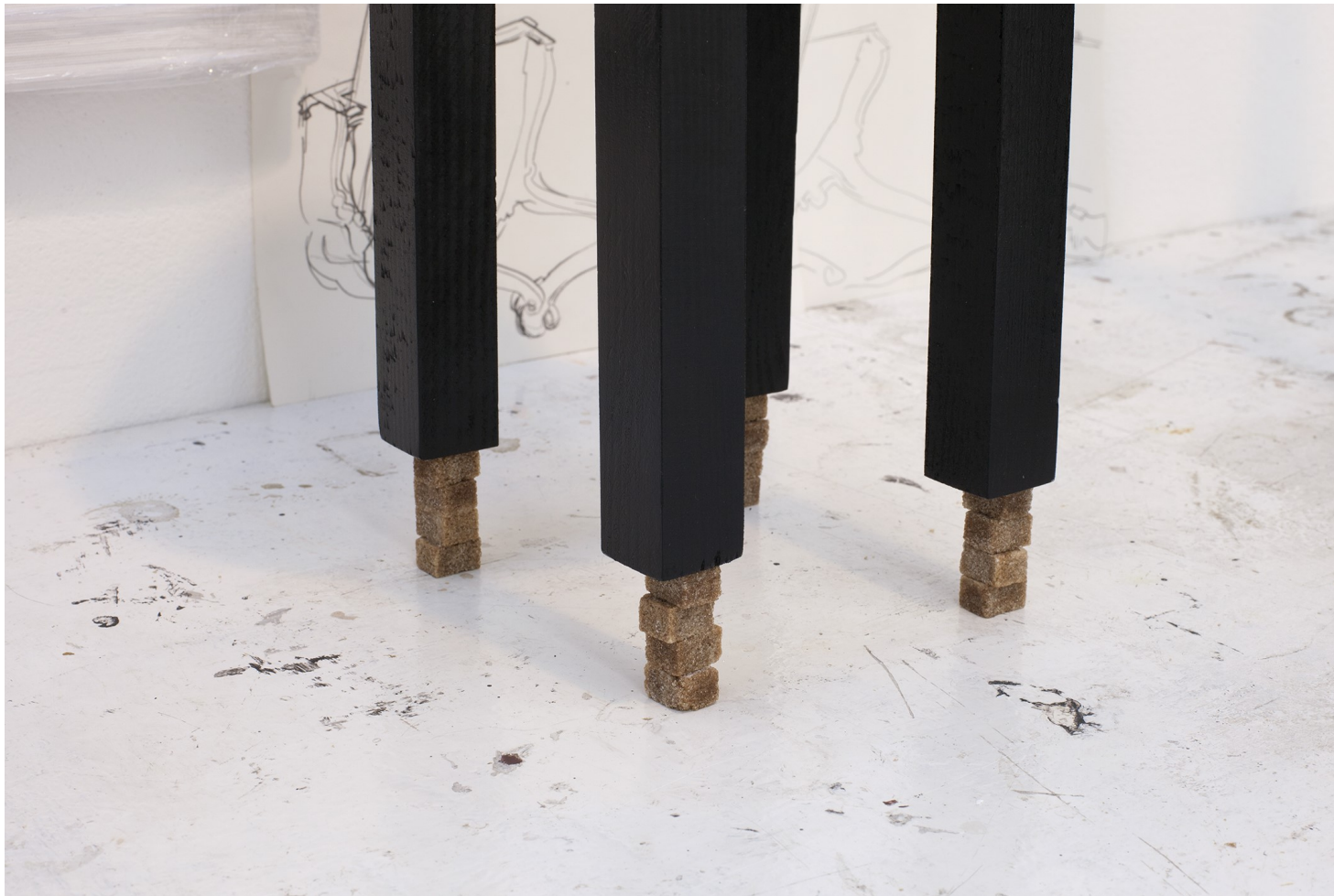
Assemblage II (detail) , 2017, Table, stools, canvas, drawings, sugar cubes, 120 x 80 x 2,5 cm, installation view Parabéns , AKINCI