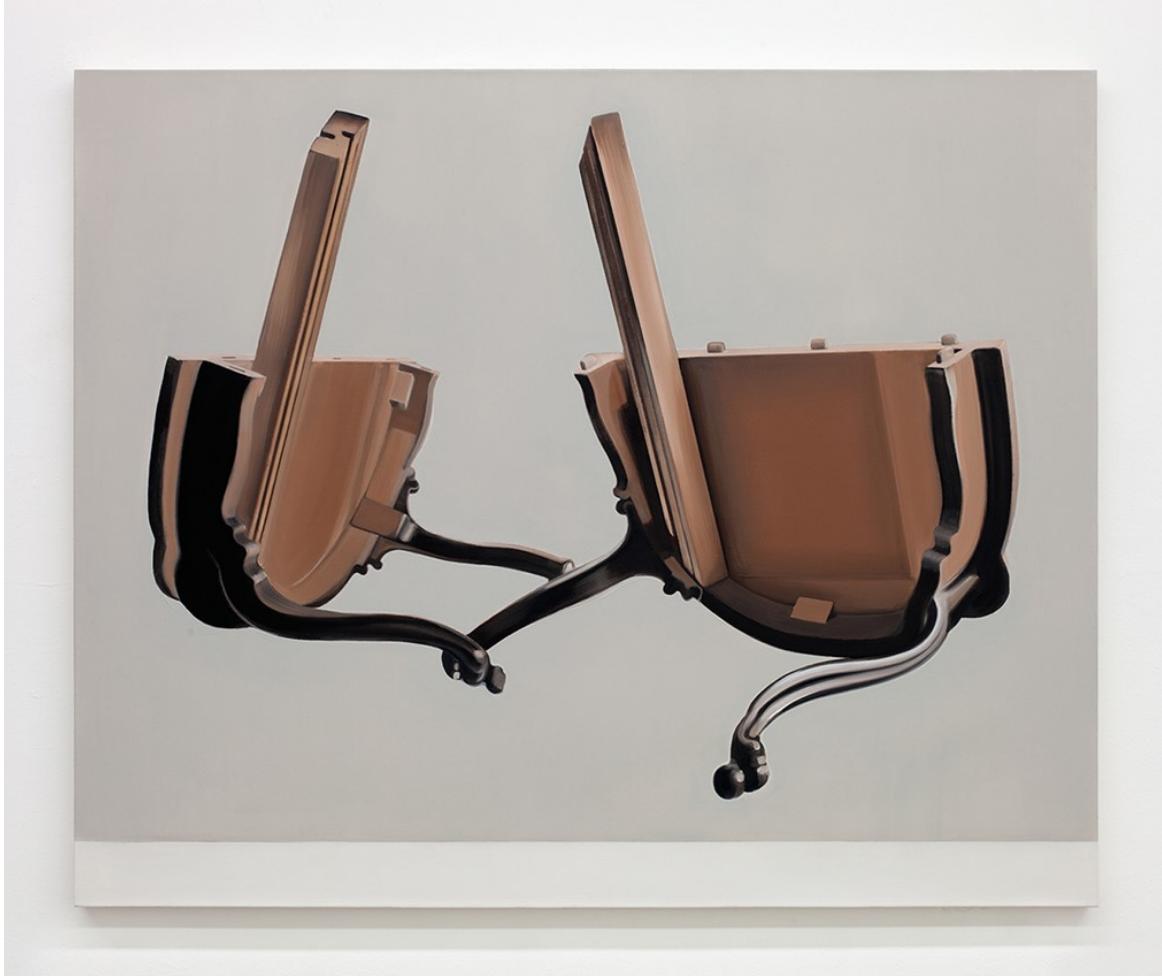
Collaboration , 2017, oil on canvas, 135 x 110 x 4 cm