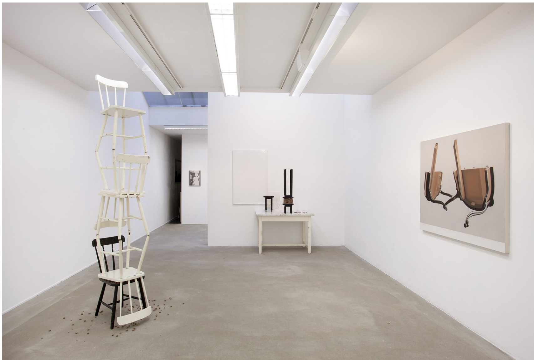
Overview Parabéns , AKINCI, 2017