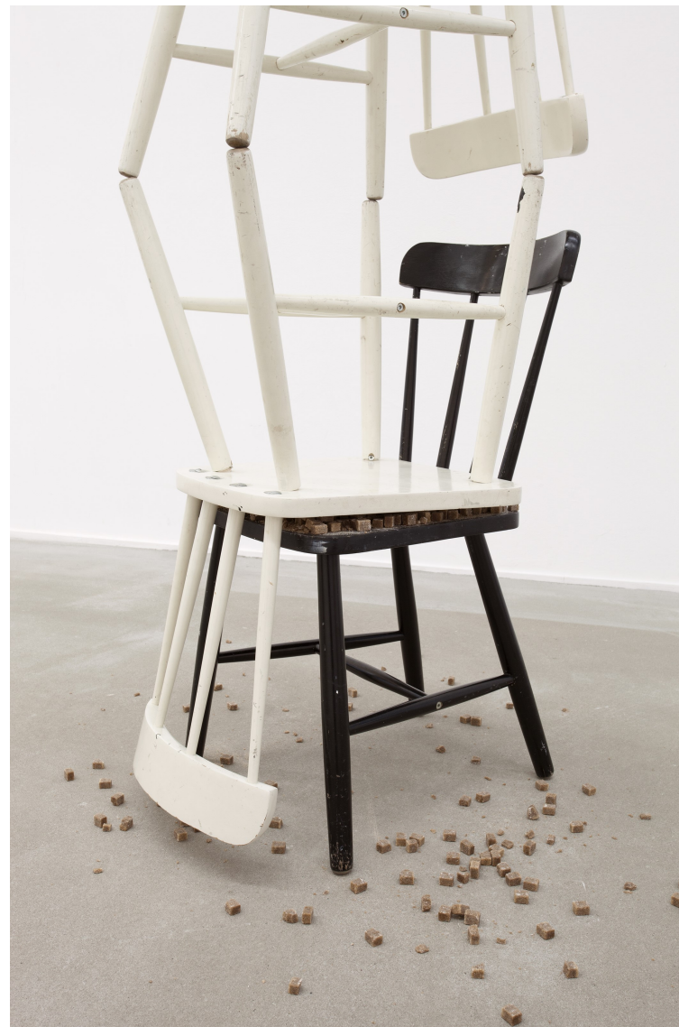
Assemblage I (detail) , 2017, 5 used Ikea chairs and brown sugar cubes, 40 x 70 x 260 cm, Installation view Parabéns , AKINCI