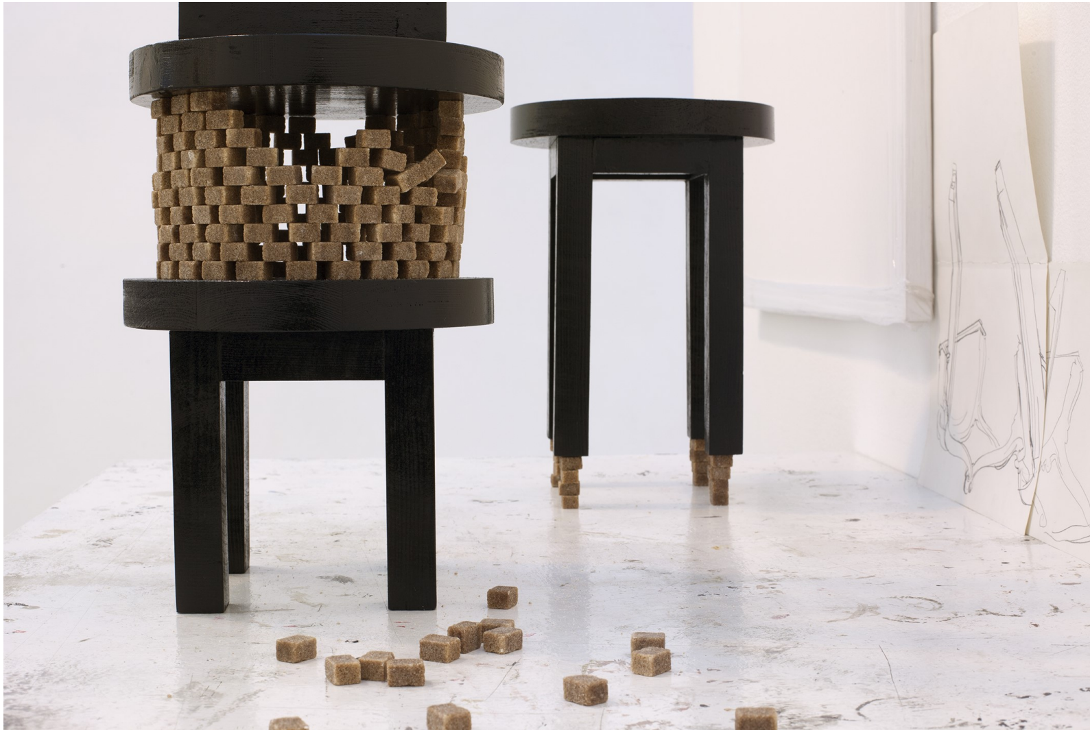
Assemblage II (detail) , 2017, Table, stools, canvas, drawings, sugar cubes, 120 x 80 x 2,5 cm, installation view Parabéns , AKINCI