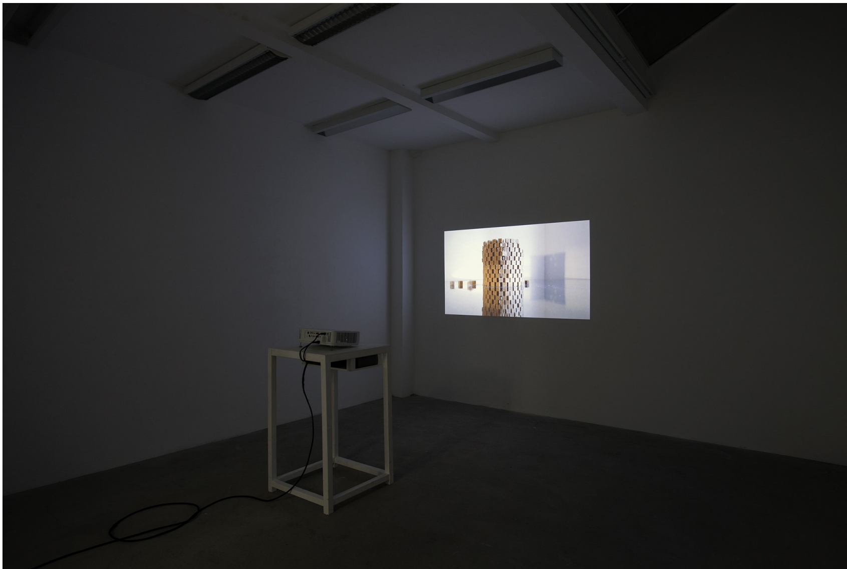
Parabéns, 2017, video, 4:07 minutes Installation view at AKINCI, 2017