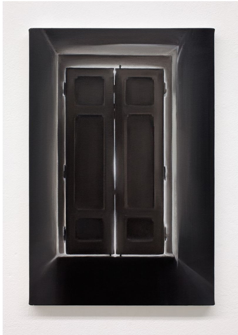
Untitled , oil on canvas, 2017, oil on canvas, 40 x 60 cm, (photo: Wytske van Keulen)