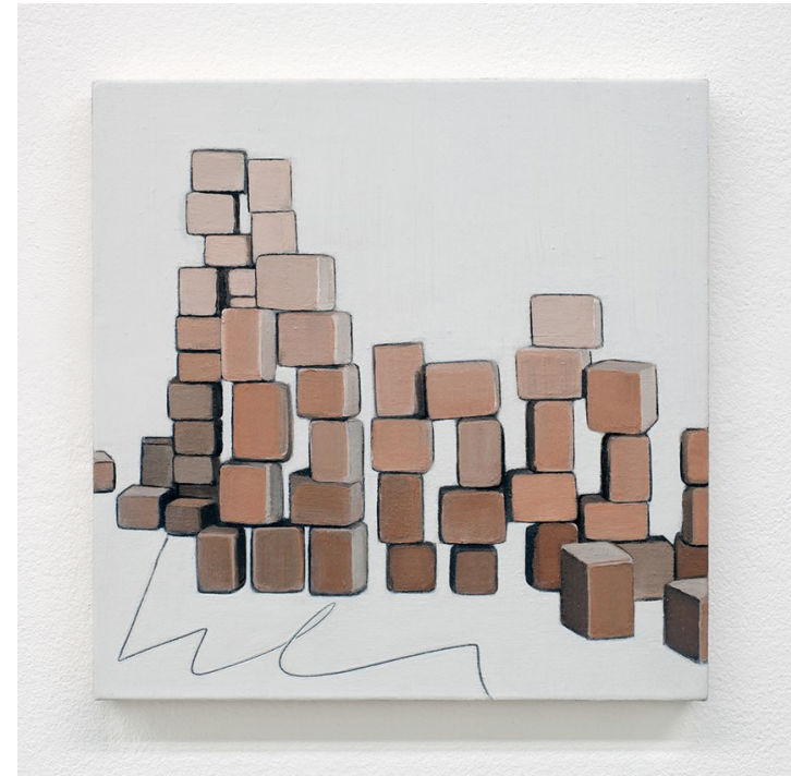
Steady Diet , 2017, oil on canvas, 30 x 30 cm