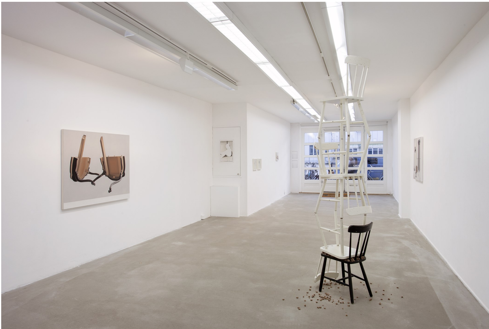
Overview Parabéns , AKINCI, 2017