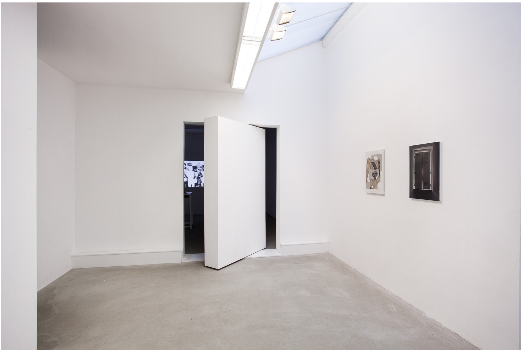
Overview Parabéns , AKINCI, 2017