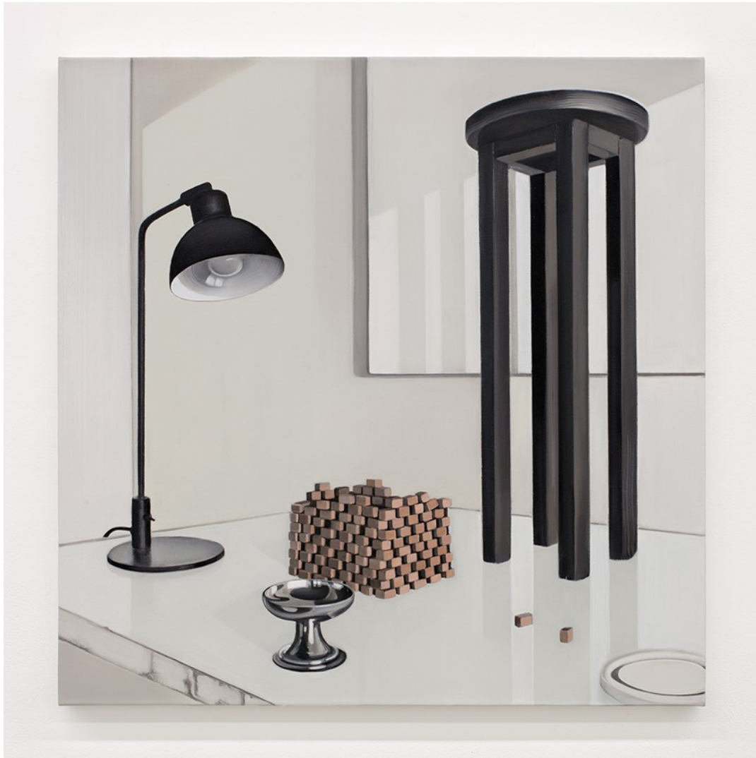
Divided we stand (Souvenir d'Istanbul) , 2017, oil on canvas, 90 x 90 cm