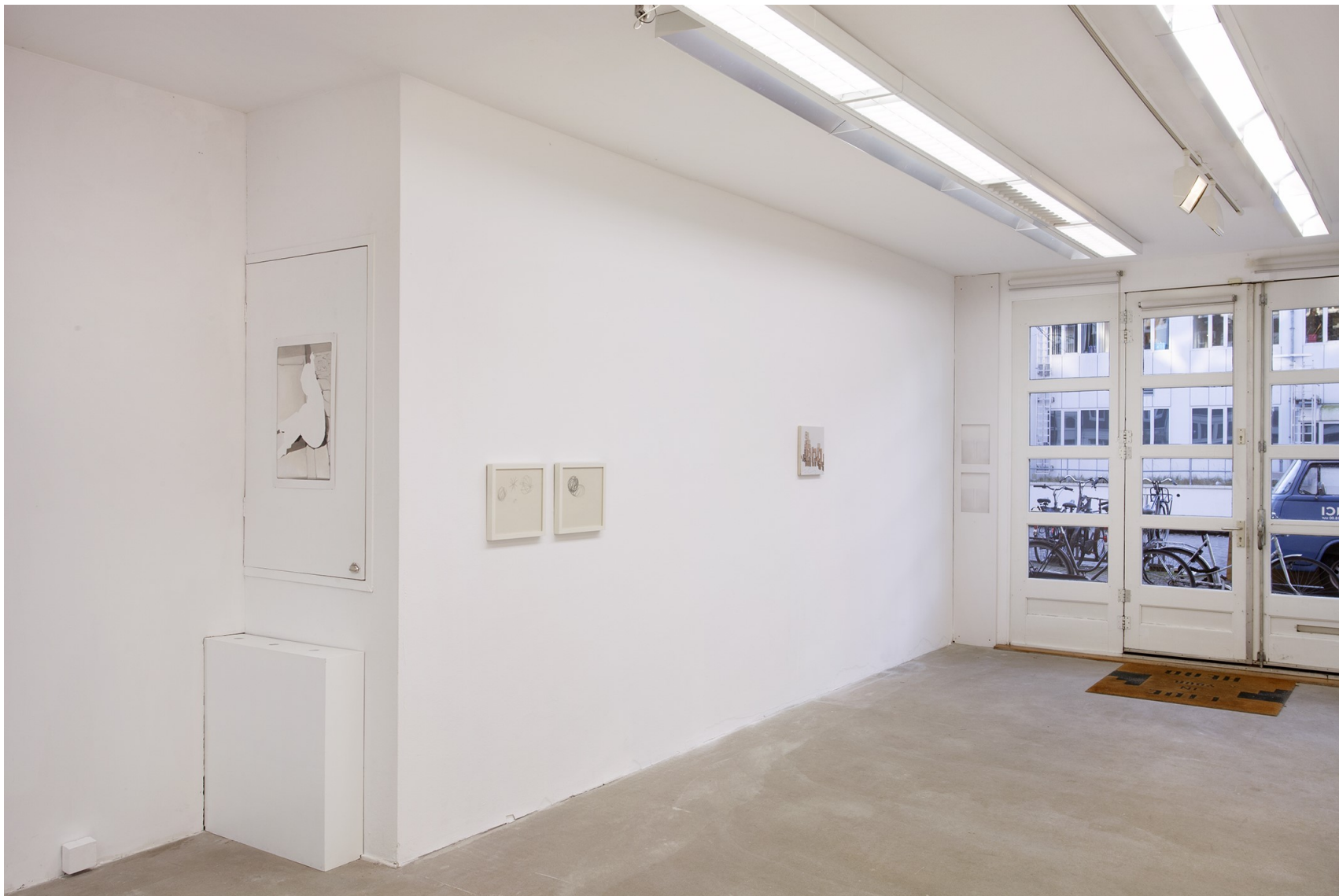
Overview Parabéns , AKINCI, 2017