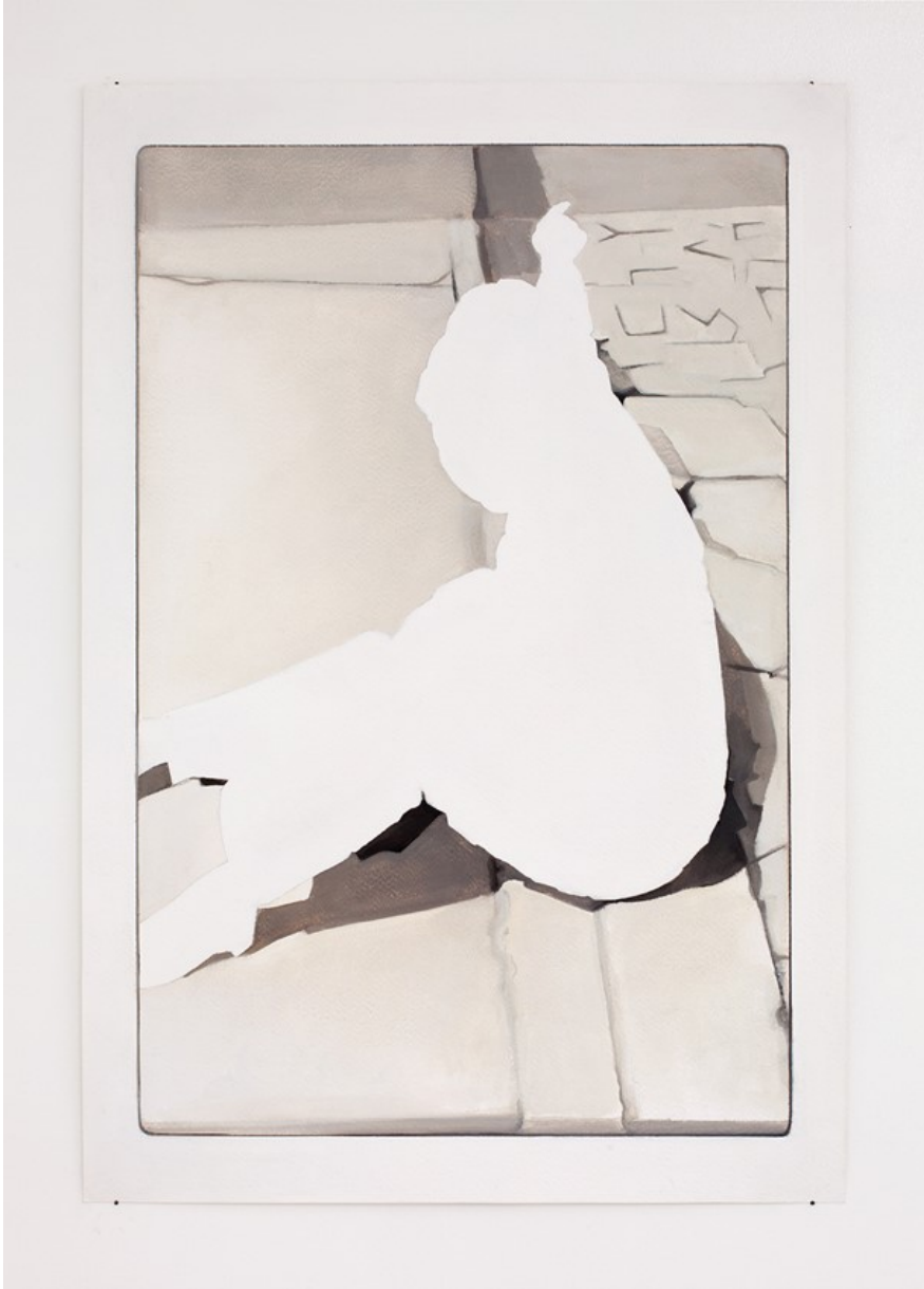
Cursor , oil on paper, 2017, 63 x 42 cm