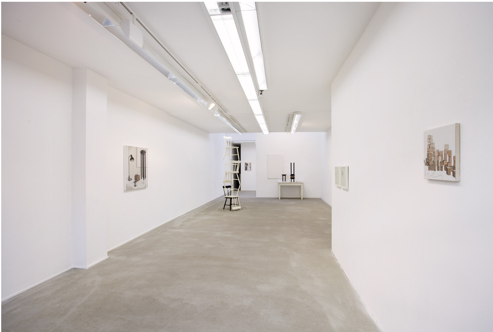
Overview Parabéns , AKINCI, 2017