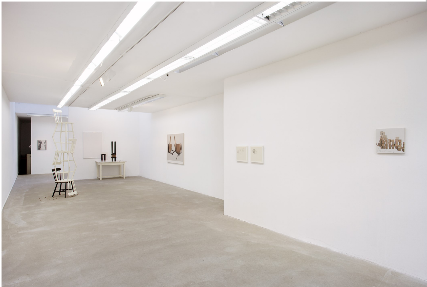
Overview Parabéns , AKINCI, 2017