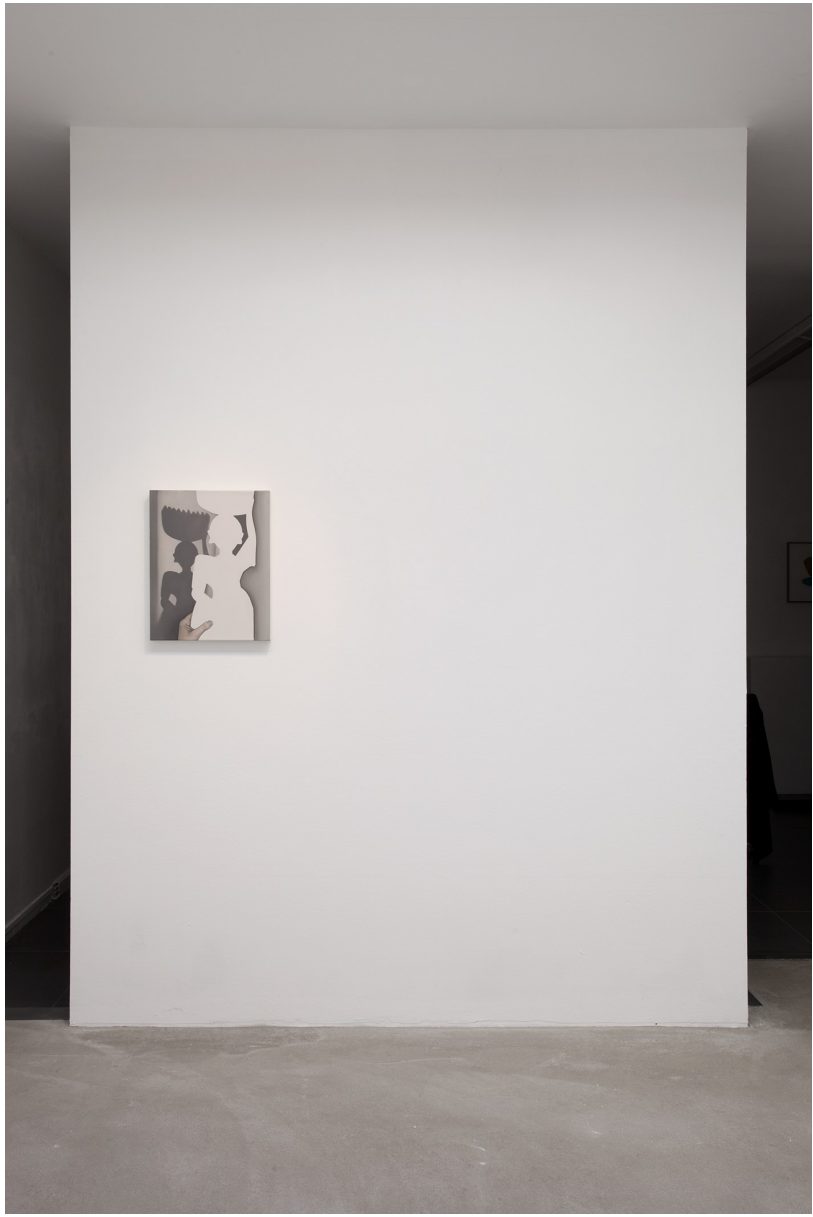
Obscura , 2017, 30 x 30 cm, installation view Parabéns , AKINCI