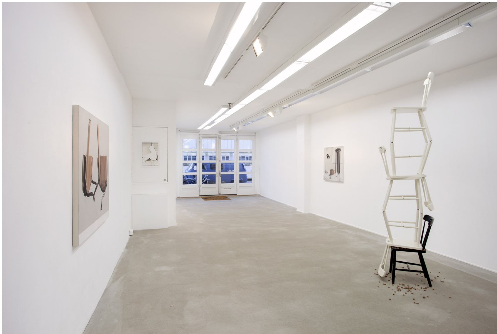
Overview Parabéns , AKINCI, 2017