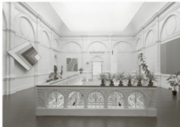
1809 JT Payment