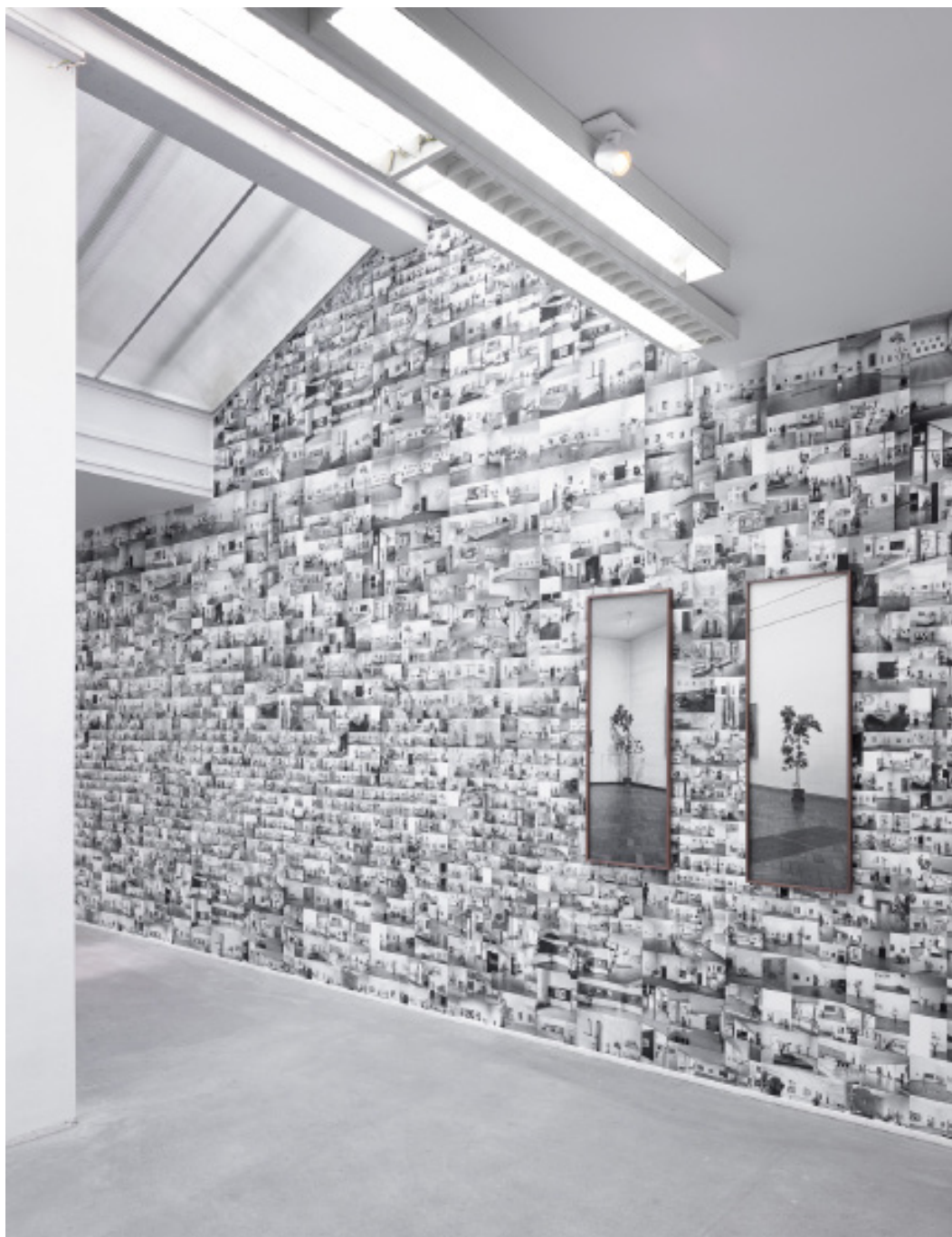
Installation view of Wallpaper (detail of the work) in the exhibition 'Nothing is Something to be Seen', at AKINCI, Amsterdam.