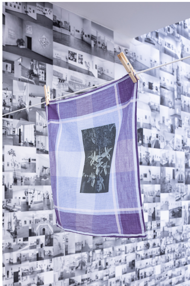
Handkerchiefs , 2021