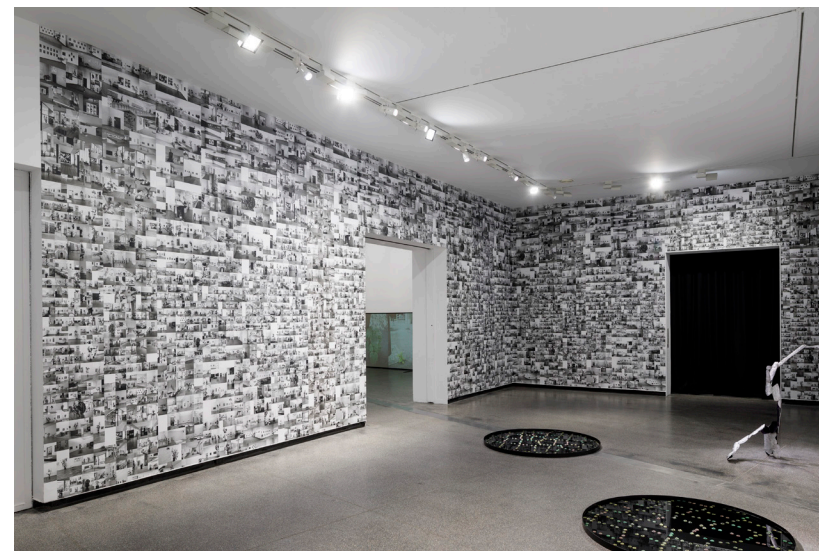
Installation view of Wallpaper in the exhibition 'A Biography of Daphne', curated by Mihnea Mircan, at Australian Centre for Contemporary Art, Melbourne.

Text written by curator Mihnea Mircan for the exhibition 'A Biography of Daphne', Australian Centre for Contemporary Art, Melbourne.