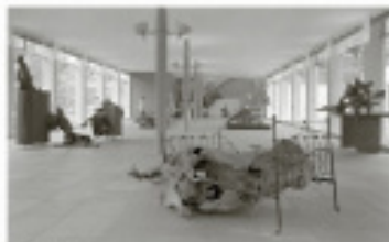
1808 Present Counts