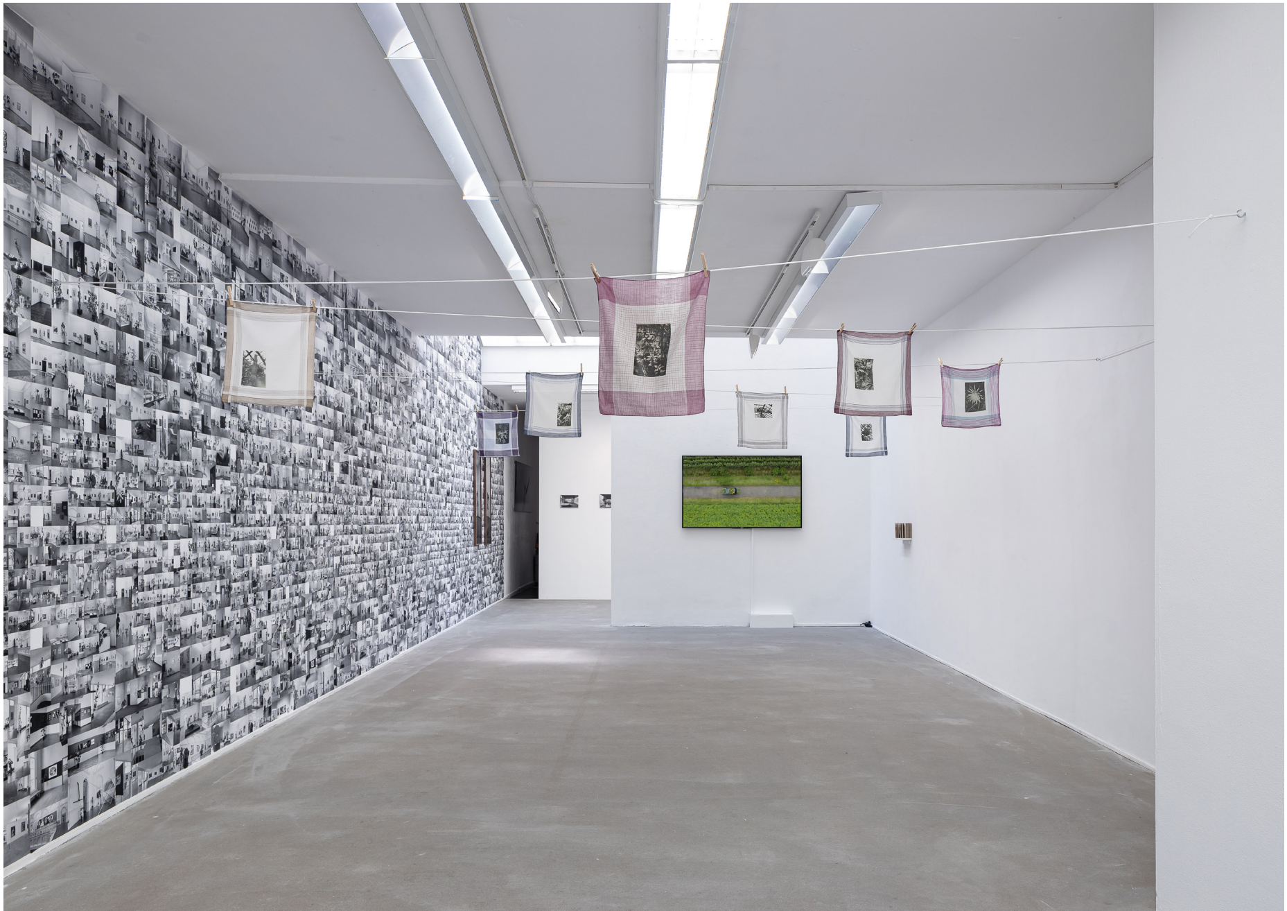
Installation view of Wallpaper (detail of the work) in the exhibition 'Nothing is Something to be Seen', at AKINCI, Amsterdam.