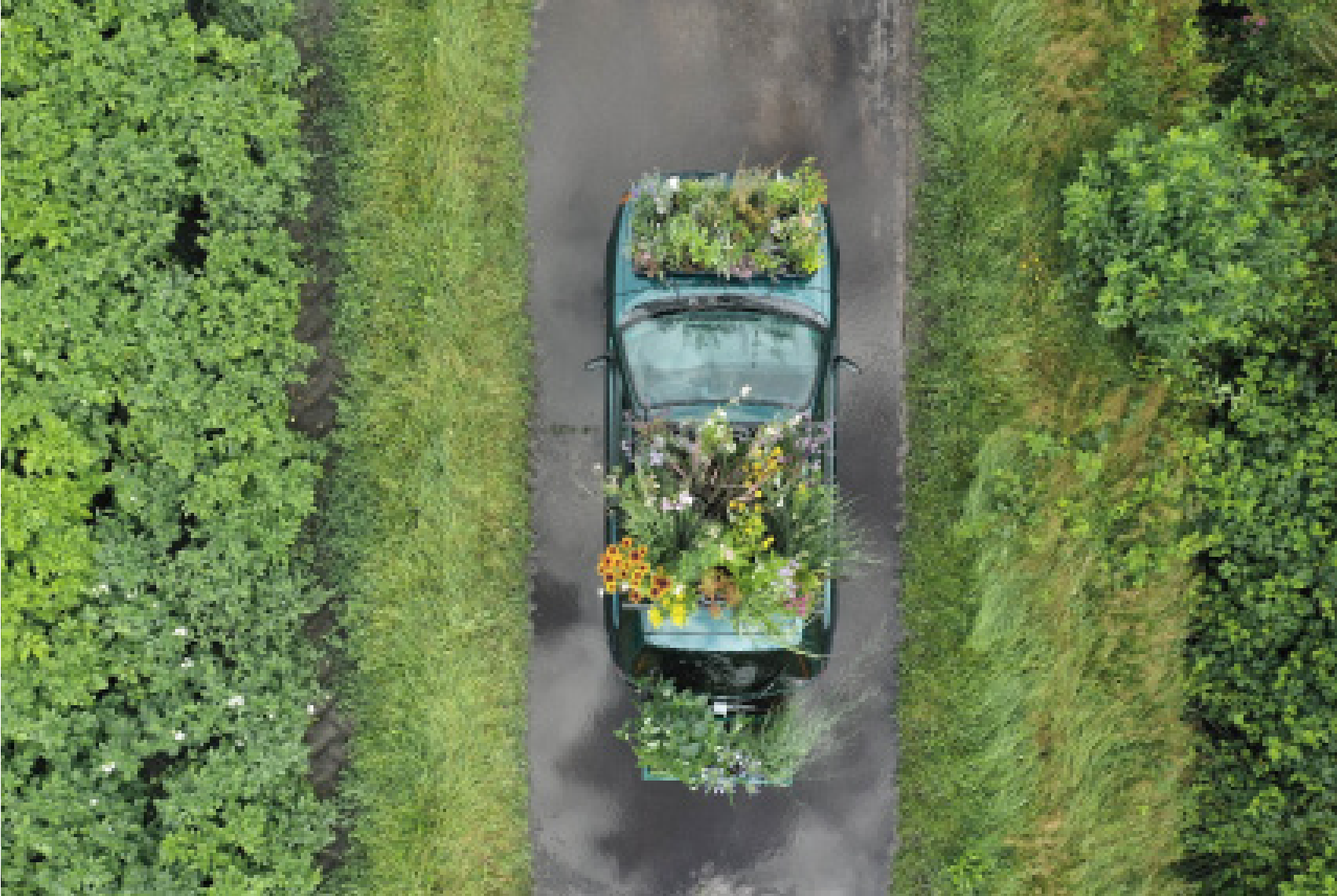
Car Garden , 2021 Ilford Gold Fibre Silk framed with museum glass, framed