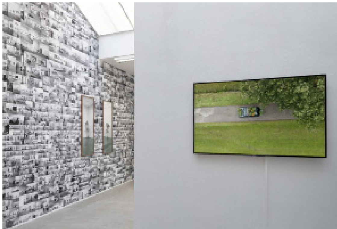
Installation view of Car Garden in the exhibition 'Nothing is Something to be Seen', at AKINCI.