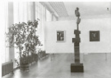
1981 Fulberts, het apollinische en dionysische ik in beeld in abstract