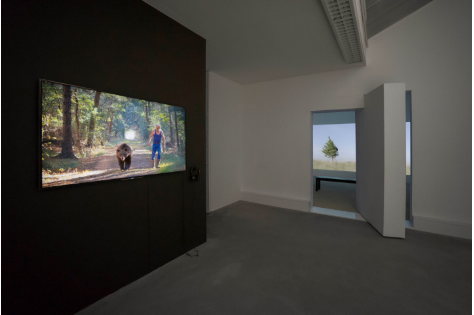
Solo exhibition Companion , overview at AKINCI, 2018