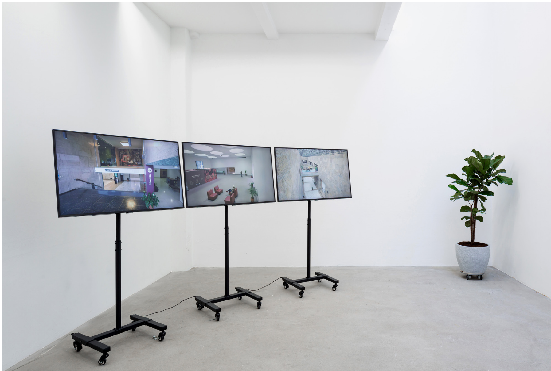
Nothing is Something to be Seen , 2018, installation at AKINCI