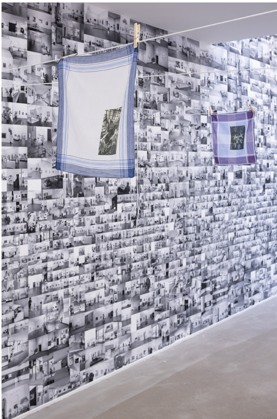
Handkerchiefs, 2021 Linnen, flexfoil, dimensions variable, unicate