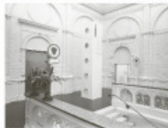
1809 JT Payment