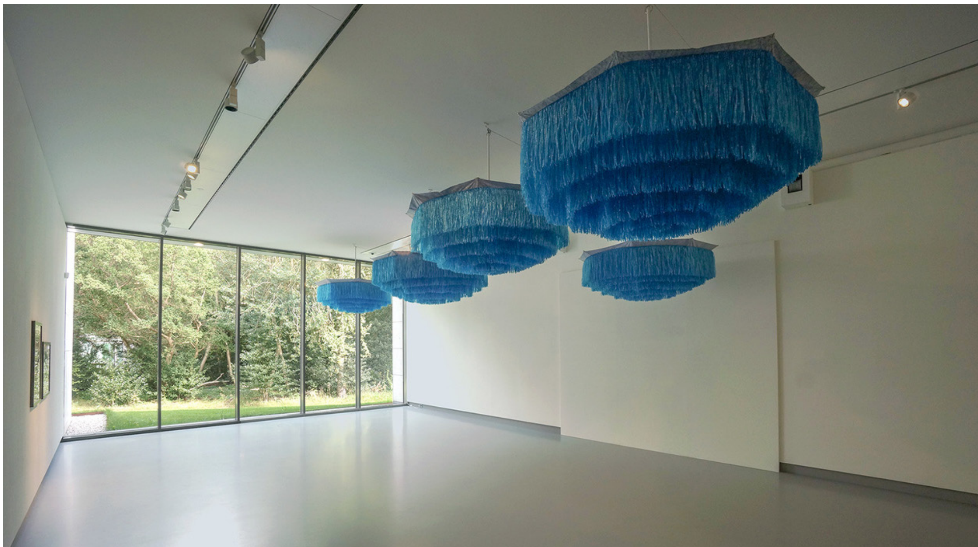
Oceanic Feeling , 2017, textile, PVC, steel, motor, control board, 180 x 180 cm / variable, Installation view The Sweetness of Doing Nothing , Museum Kranenburgh