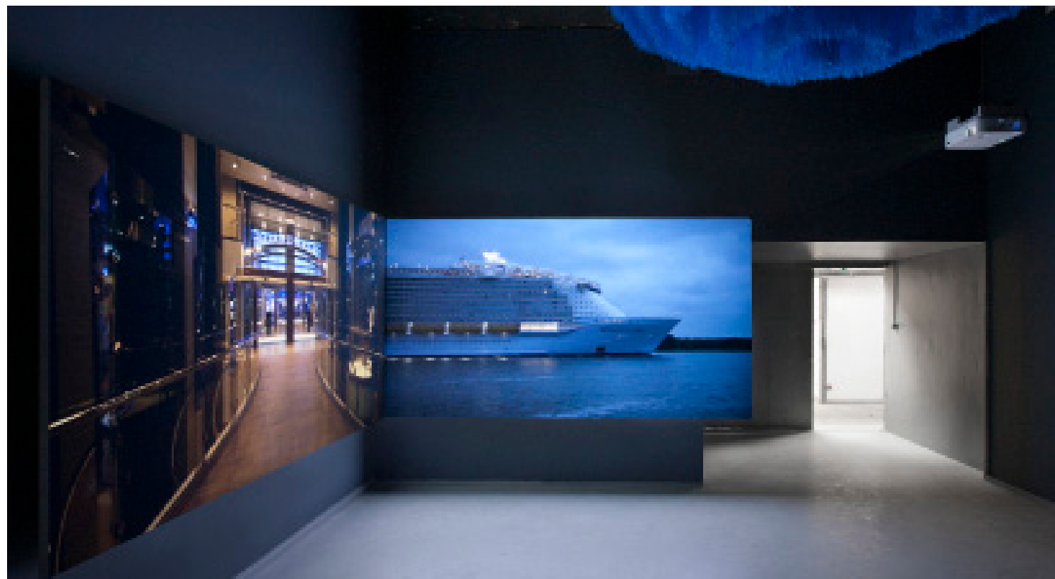
Beautiful Isle of Somewhere , 2016, Full HD video double projection, 11 min. Companion , Rijksakademie Open, 2016

The images of the installation Beautiful Isle of Somewhere are filmed in three locations: the world's largest cruiseship, the largest indoor tropical rainforest built on a former airfield of the Luftwaffe and a Dutch village rebuilt in Turkey with mountains in the background. Although the different scenes and thoughts that occupied me during the making process of the film interact on several levels, the rhythm of the architecture is what determined the rhythm and coherence of the editing. Because the architectural and/or ecological context of the tourist locations is separate from their immediate surroundings and I allow them to merge into one another, the images form a new frame of imagination. They are (or become) counterfeit environments that evoke recognition and at the same time are totally alien, thus accentuating the virtuality of these tourist locations..