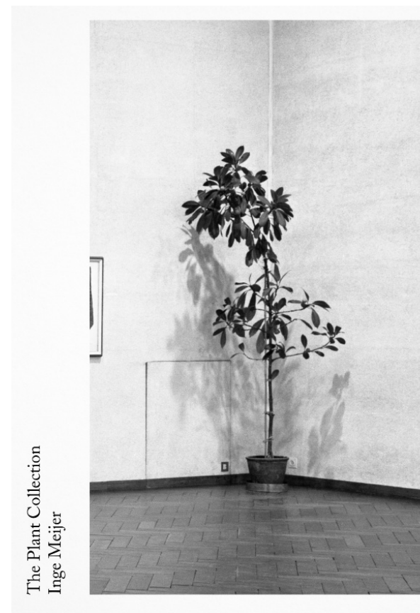
The Plant Collection Inge Meijer

Ooit stonden er planten in het Stedelijk Museum in Amsterdam de Volkskrant, 27 mei 2019