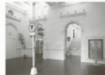
1809 JT Payment