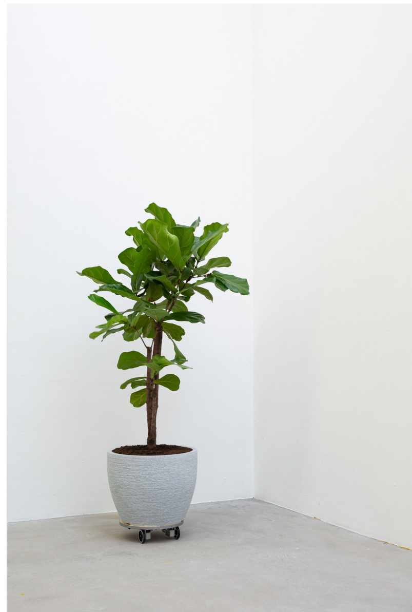
Nothing is Something to be Seen (detail), 2018, installation at AKINCI

The location is not only interesting for its architectural splendour but also for the public and democratic function the library holds in the otherwise quite segregated city of Bogota, Colombia. The domesticated plants of this institute are protagonists, registered by the security cameras they slowly traverse the spaces. The work relates to the current attention for the annulation of the distinction between the human and non-human and for the exaltation of plants, such as propagated by the widely know works of Emanuele Coccia.