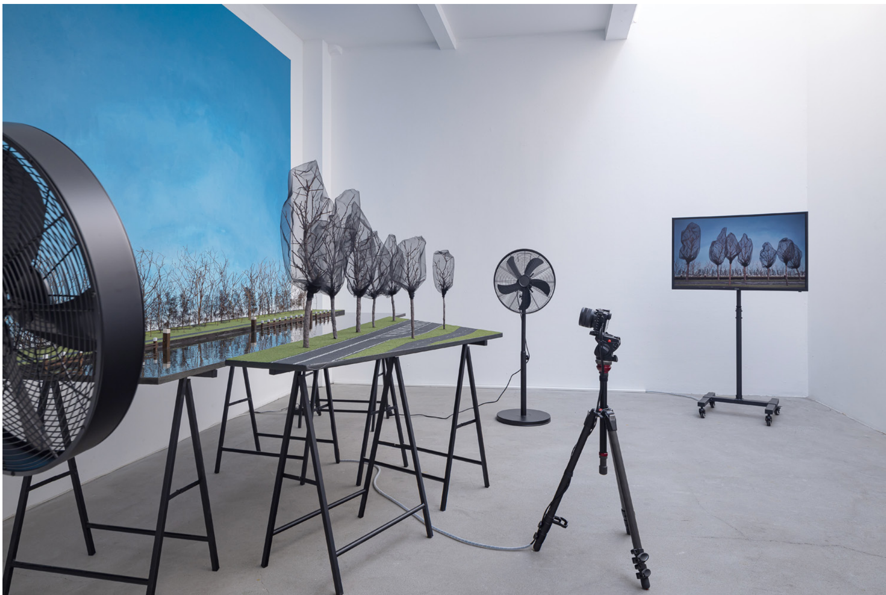
Installation view of Kanaalweg (detail of the work) in the exhibition 'Nothing is Something to be Seen', at AKINCI.