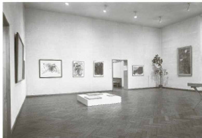
1981 René Guénon