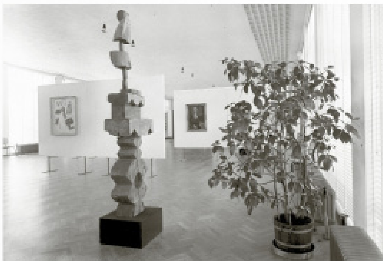
1981 Fulberts, het apollinische en dionysische ik in beeld in abstract