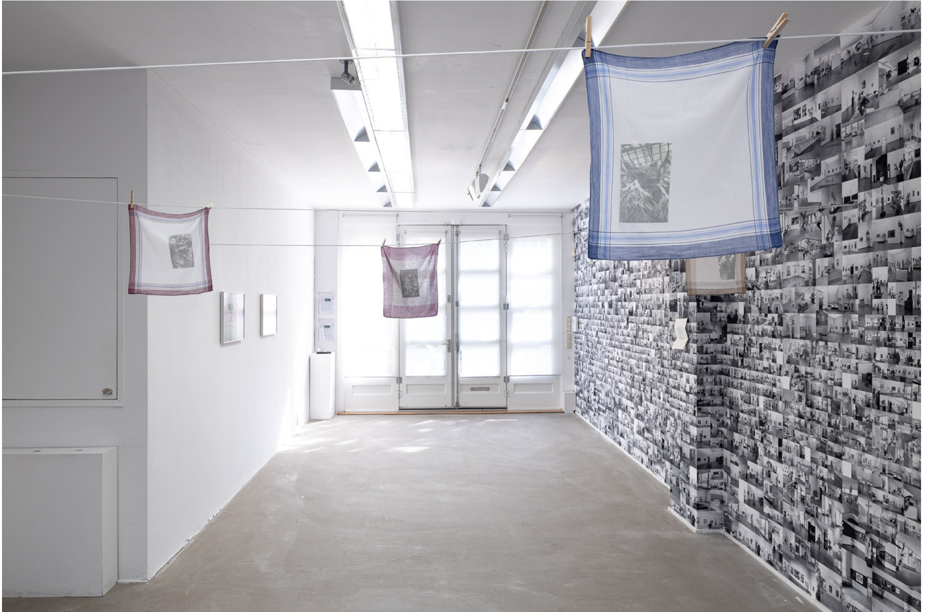
Installation view of Wallpaper (detail of the work) in the exhibition 'Nothing is Something to be Seen', at AKINCI, Amsterdam