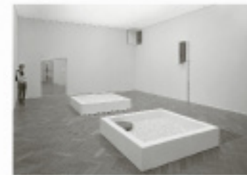
1809 JT Payment