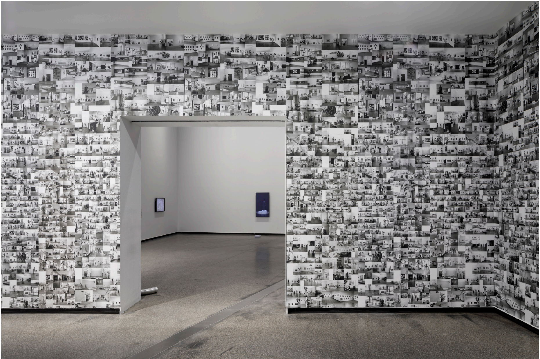
Installation view of Wallpaper (detail of the work) in the exhibition 'A Biography of Daphne', curated by Mihnea Mircan, at Australian Centre for Contemporary Art, Melbourne.