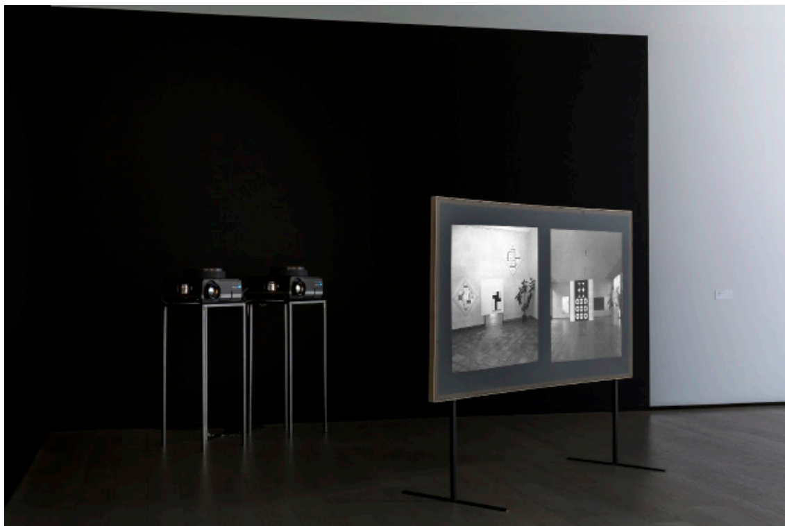
Still Life , 2018, Installation in Garage Rotterdam

The work consists of two color and 57 black and white images selected from 38 years of exhibition documentation plus a plant index made by the supposed who was responsible for the well being of the plants. The installation is the first outcome of a long term research into the vanished – and forgotten – plant life of the Stedelijk Museum Amsterdam.