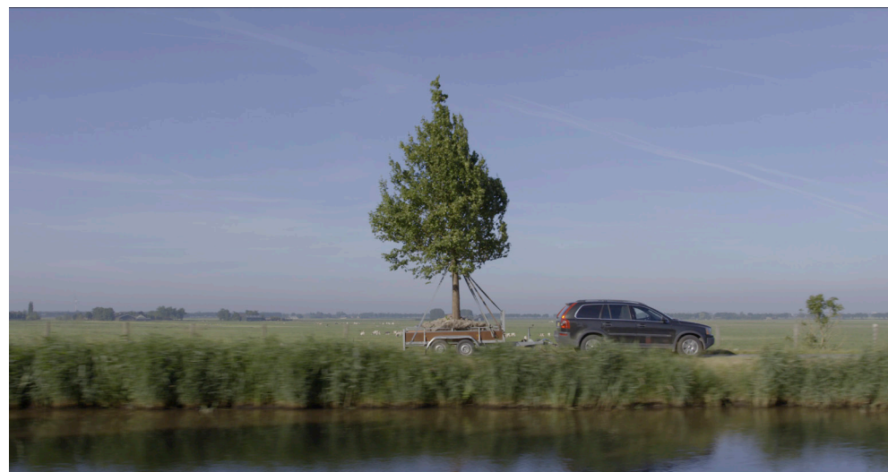
Maple Tree (still), 2017, Full HD video, 7:04 min. Companion , overview at AKINCI, 2018

The unprecedented scale of influence upon the environment by humans forces all non-human entities into a co-dependency for survival. This work is part of a sequence that searches for ways to express the tension between compassion and supremacy. This thin dividing line between the influence of the human Nurture on Nature, is a starting point for a cinematographic series in which this contradictory position is central.