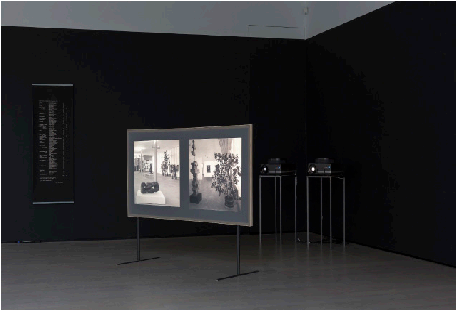
Still Life, 2018, Installation in Garage, Rotterdam