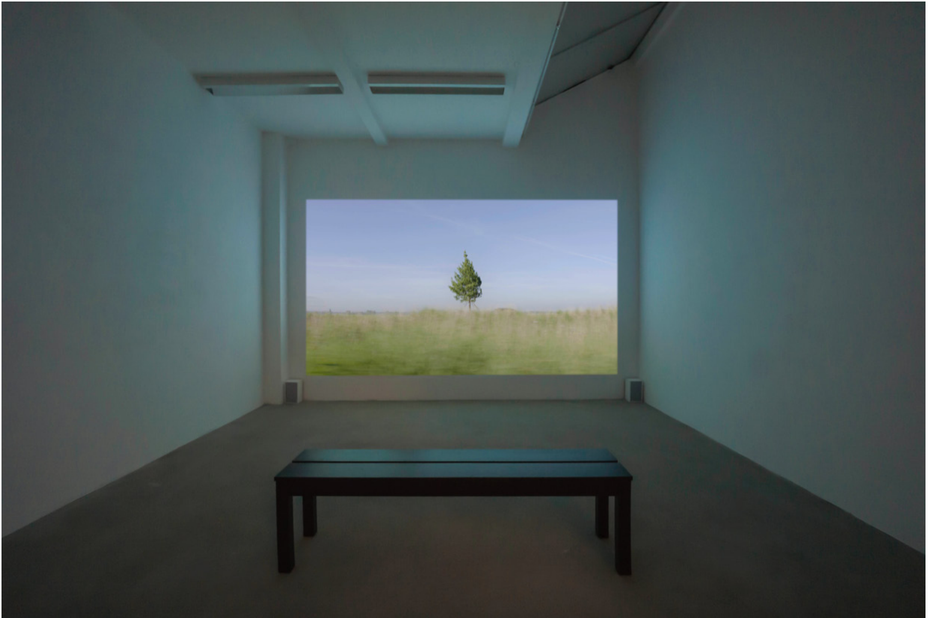
Maple Tree , 2017, Full HD video, 7:04 min. Companion , overview at AKINCI, 2018