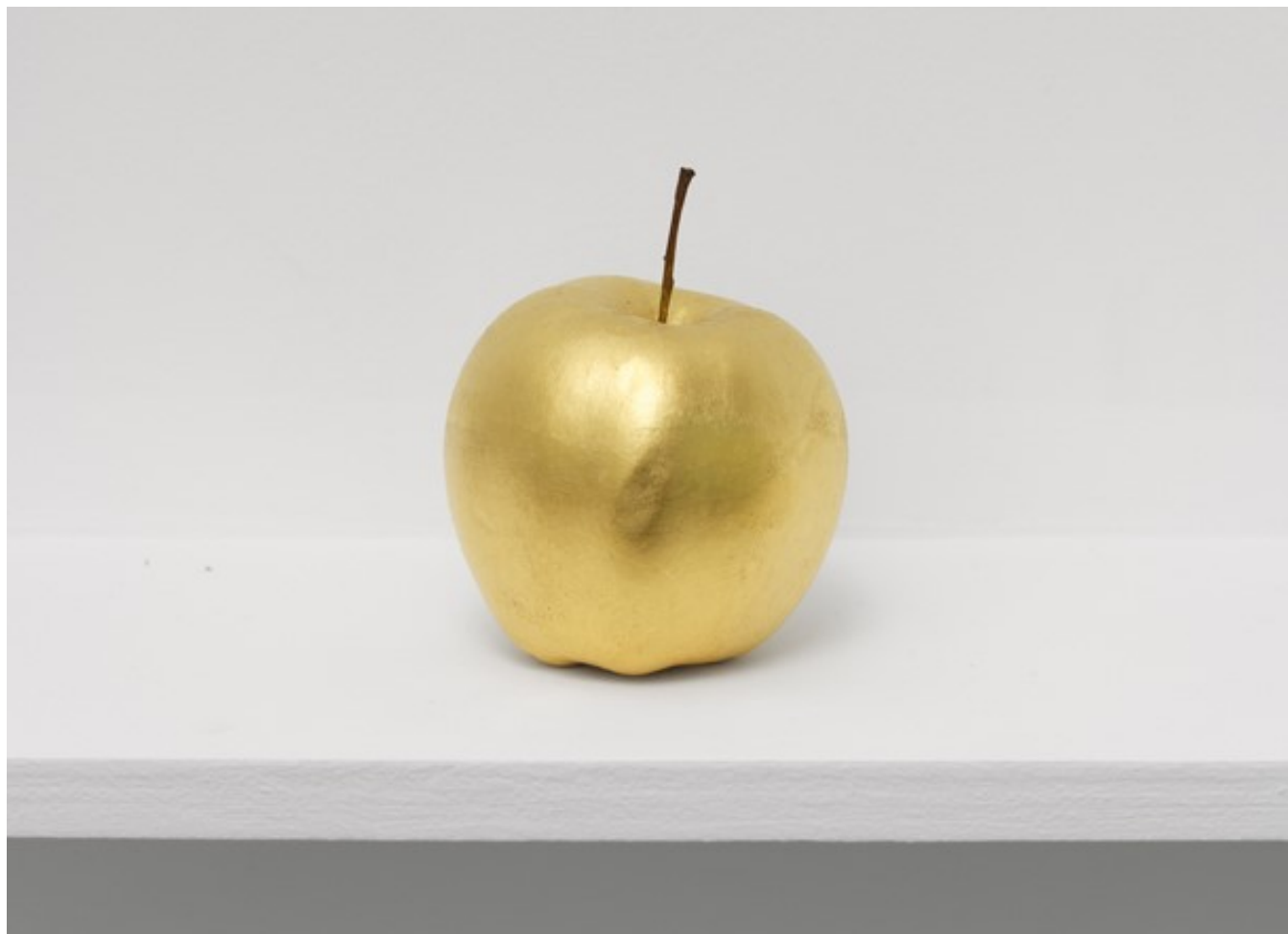
Golden Apple, 2014 -2018, 24 carat gold leaf on apple. A golden apple degrades, for the duration of the exhibition.