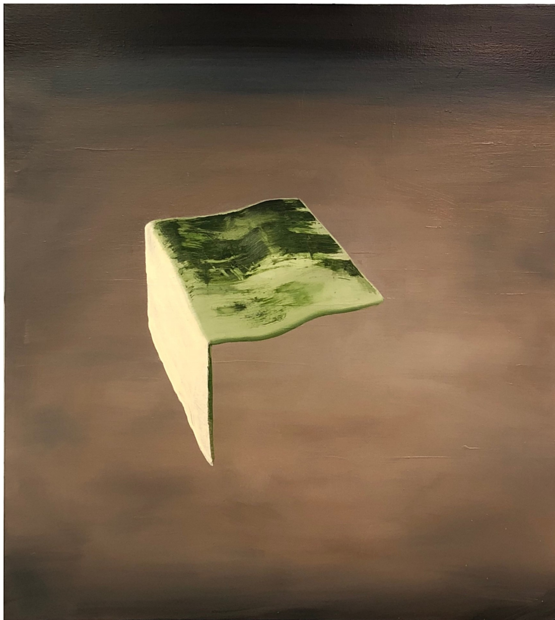
Greenscape , 2018. oil on canvas, 110 x 100 cm