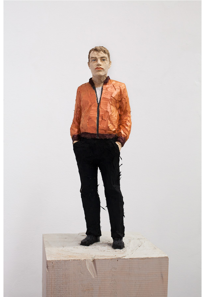
Man with bomber jacket , 2018, wawa wood, 169x34x34 cm