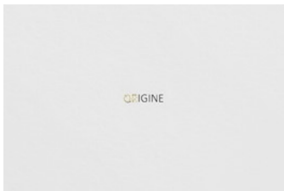
ORIGINE , 2015, print on paper, gold leaf, 21x29,7 cm . In ORIGINE , the letters OR, meaning gold in French, are gilded