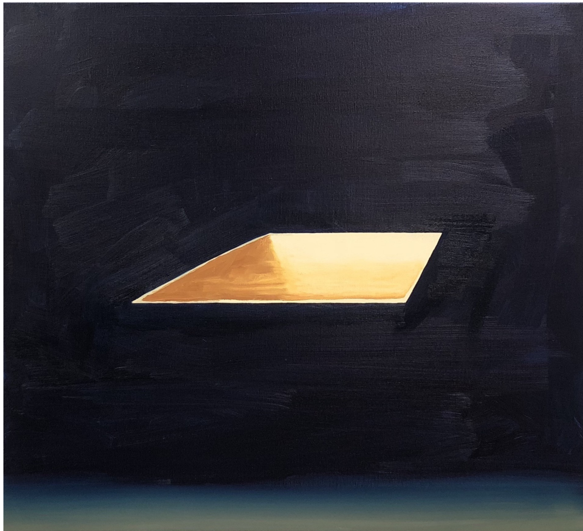
Light Square , 2018, oil on canvas, 90x100cm