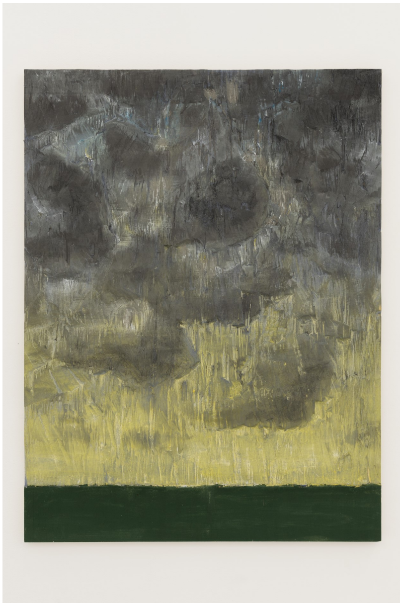
Relief Landscape (small) , 2018, wawa wood, paint, 80x60x2 cm