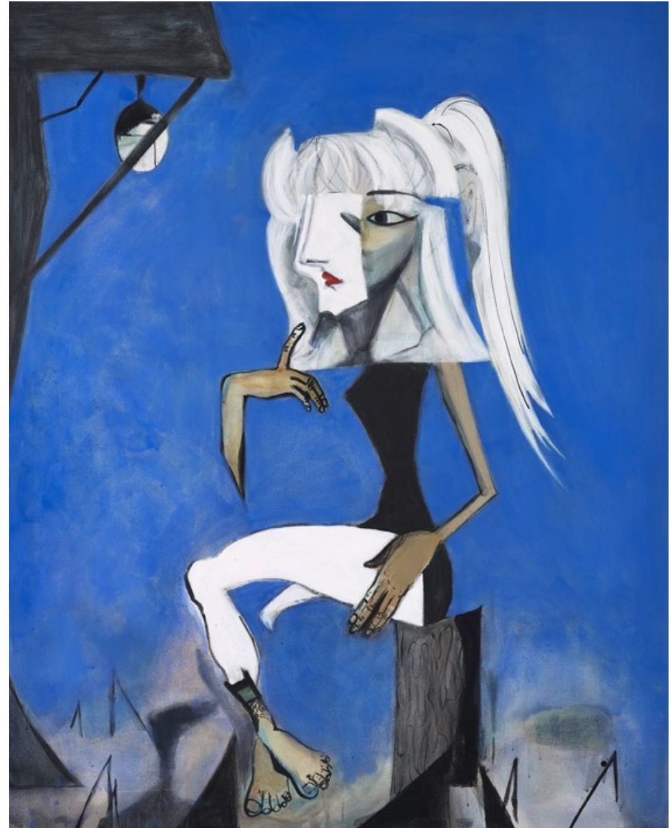
Seated Woman , 2017, distemper on canvas, 150 x 120 cm