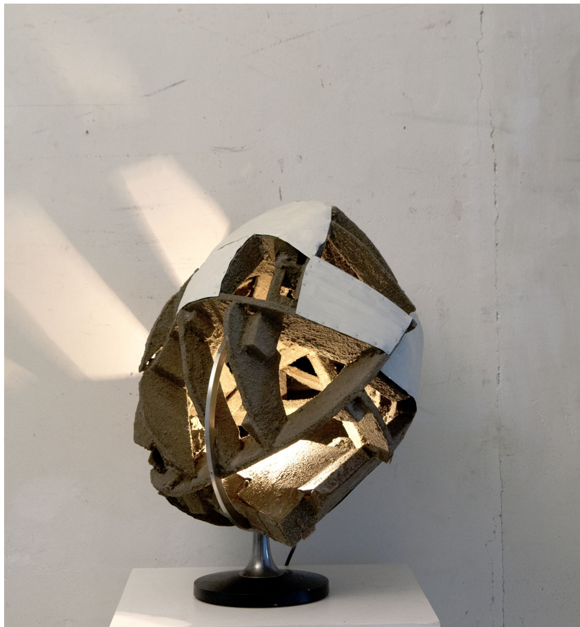
In Progress , 2014, wood, metal, cement, PVC, 55x42x42cm