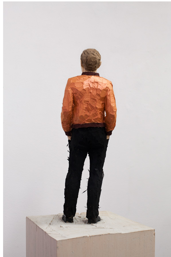
Man with bomber jacket , 2018, wawa wood, 169x34x34 cm