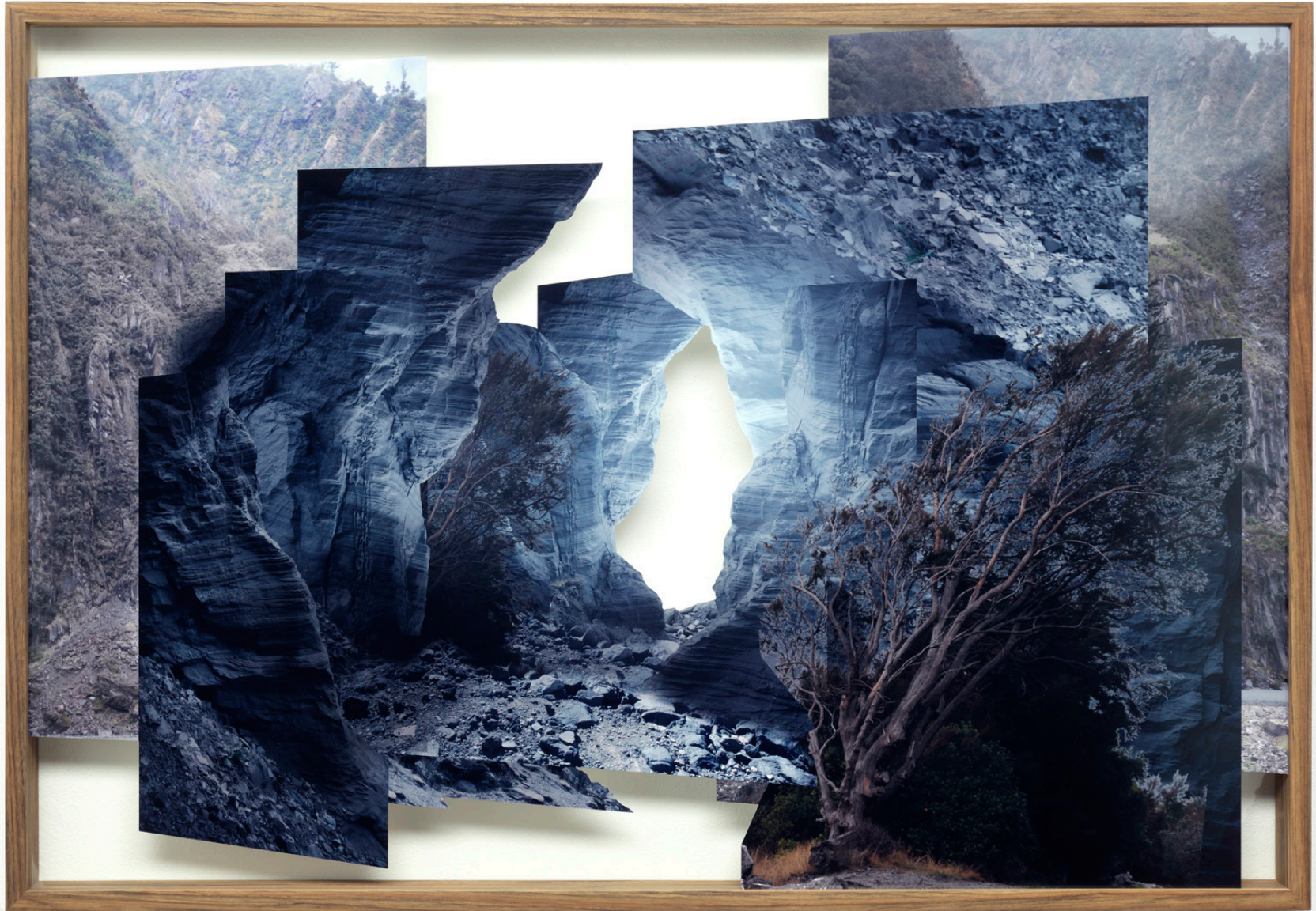
Broersen en Lukács, The Cave, 2016 cut out lambda print, framed 134 x 94 cm