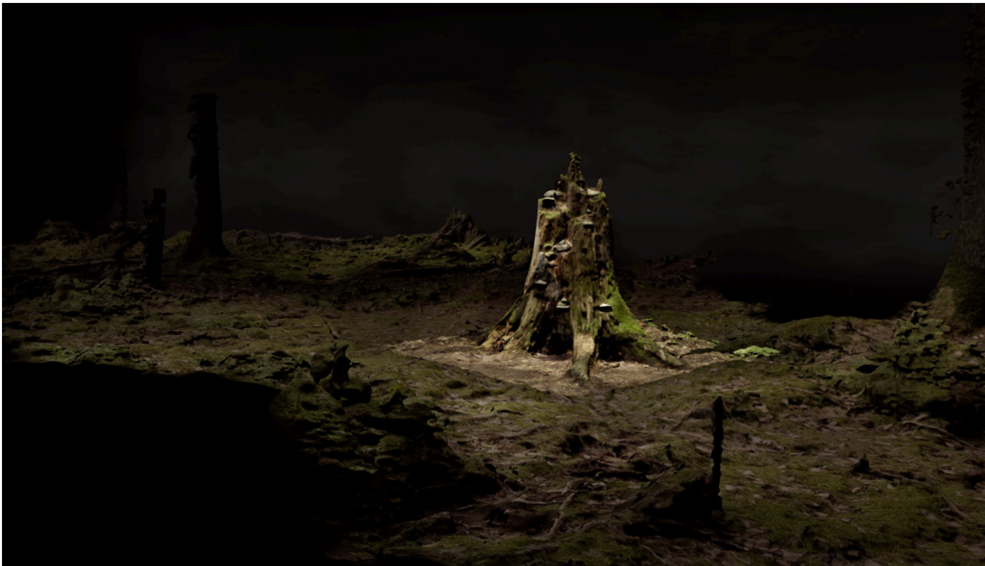
Persijn Broersen & Margit Lukács, Point Cloud, Old Growth , 2018, lightbox, 63 x 109 x 9 cm