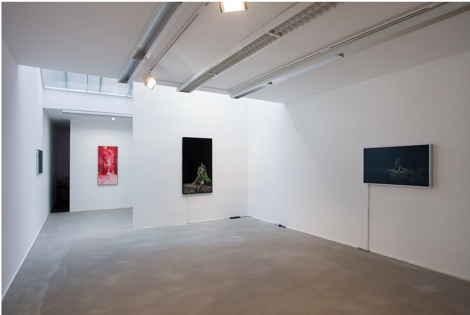
Let's Talk About Nature , overview at AKINCI, 2018, (photo: Wytske van Keulen)