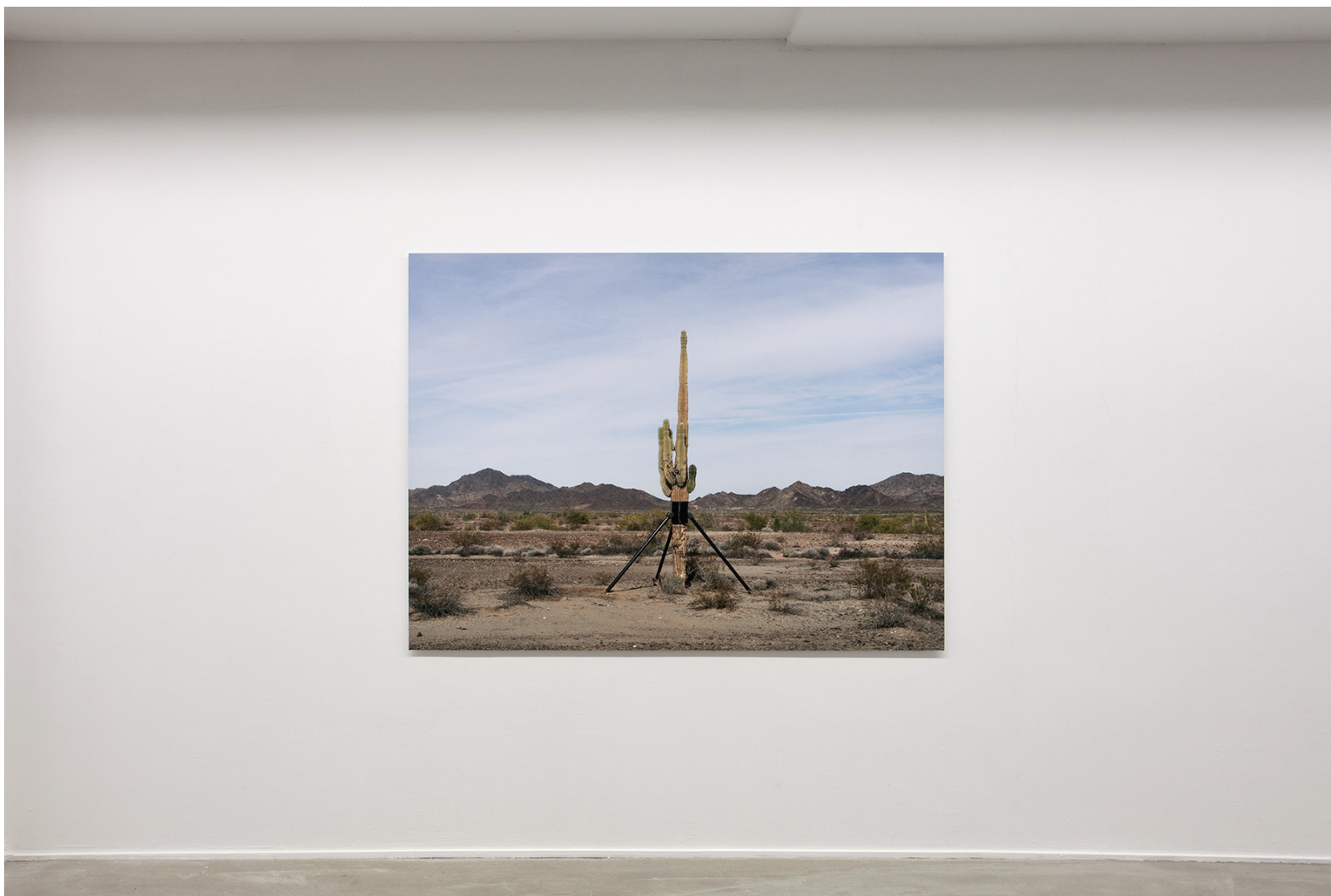
Crutch, 2017, inkjet, dubond, 147 x 197 cm

Let's Talk About Nature, overview at AKINCI, 2018