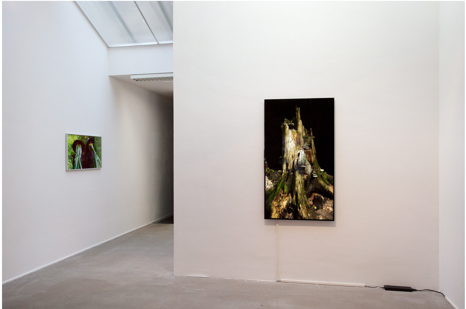
Let's Talk About Nature , overview at AKINCI, 2018, (photo: Wytske van Keulen)