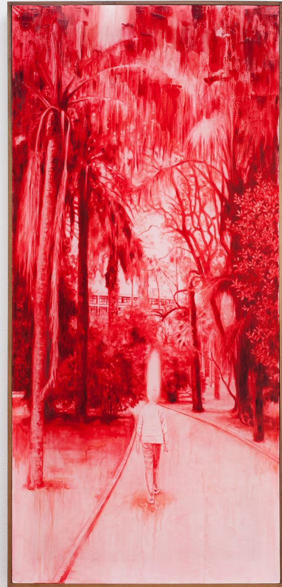
In the Lap of Luxury , 2018, oil paint on silk, framed, 130 x 61cm