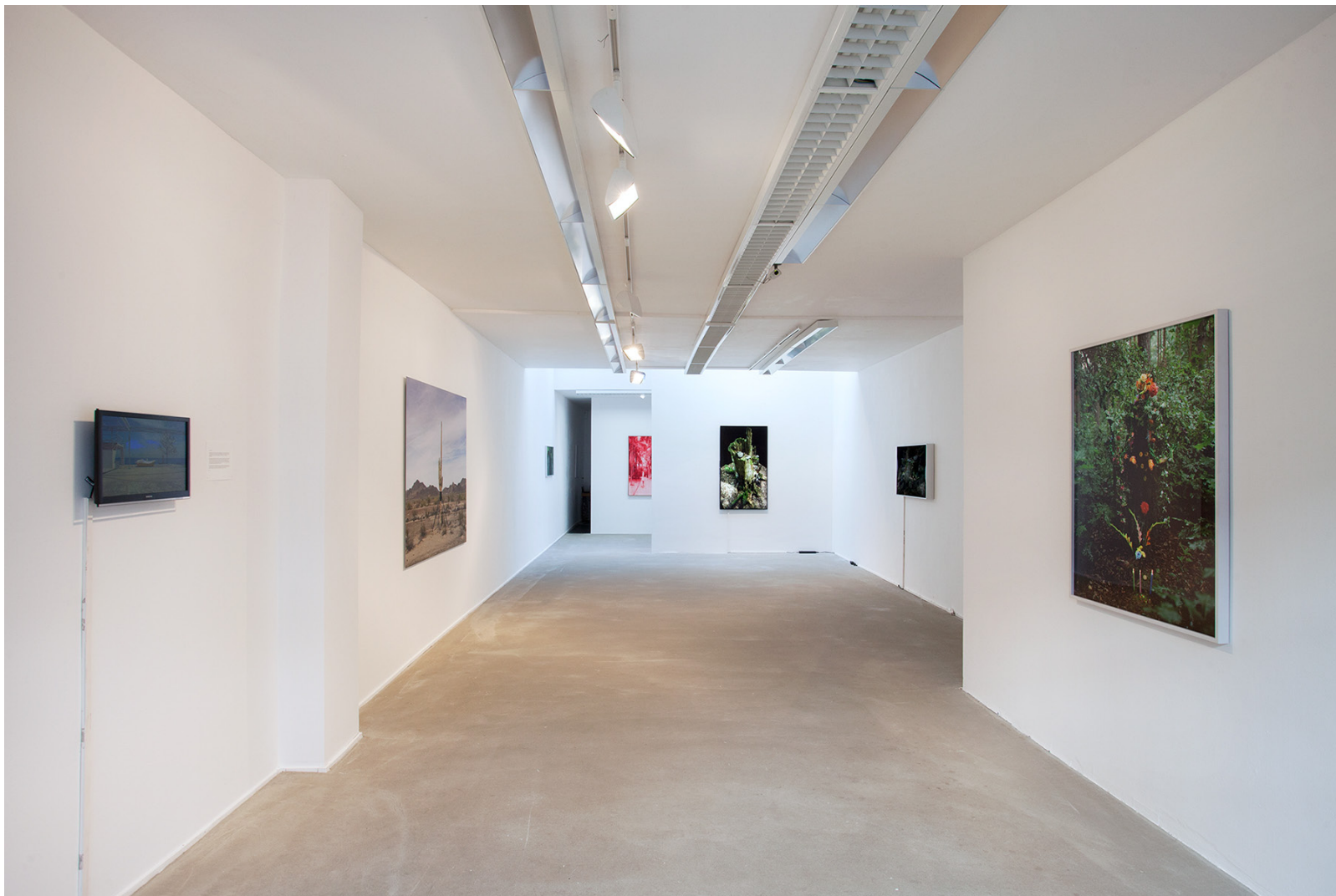
Let's Talk About Nature , overview at AKINCI, 2018