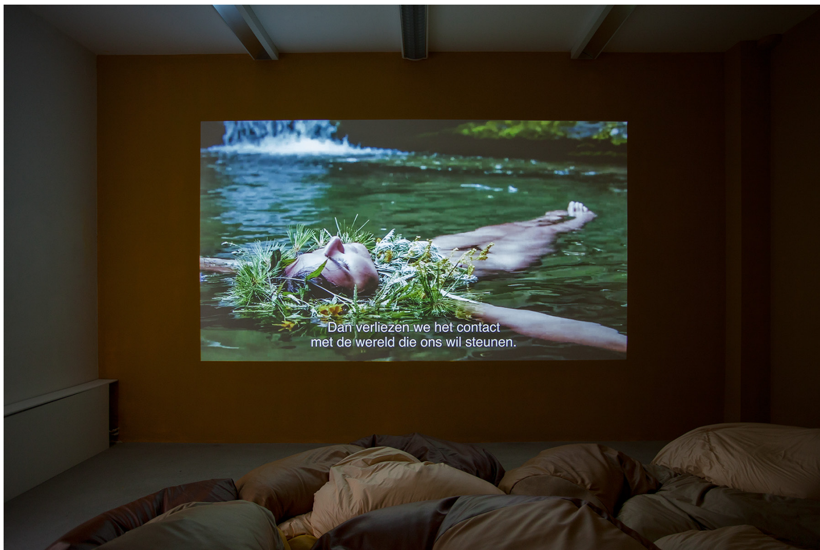
Night Soil – Nocturnal Gardening , 2016, full HD one-channels colour video with sound, 49:47 minutes