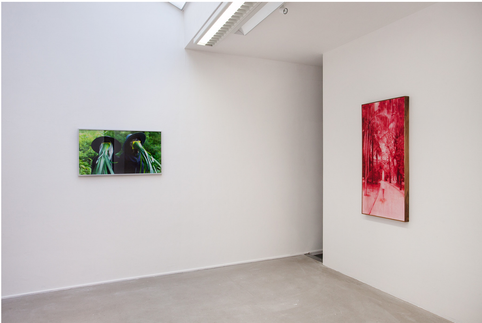
Let's Talk About Nature , overview at AKINCI, 2018, (photo: Wytske van Keulen)