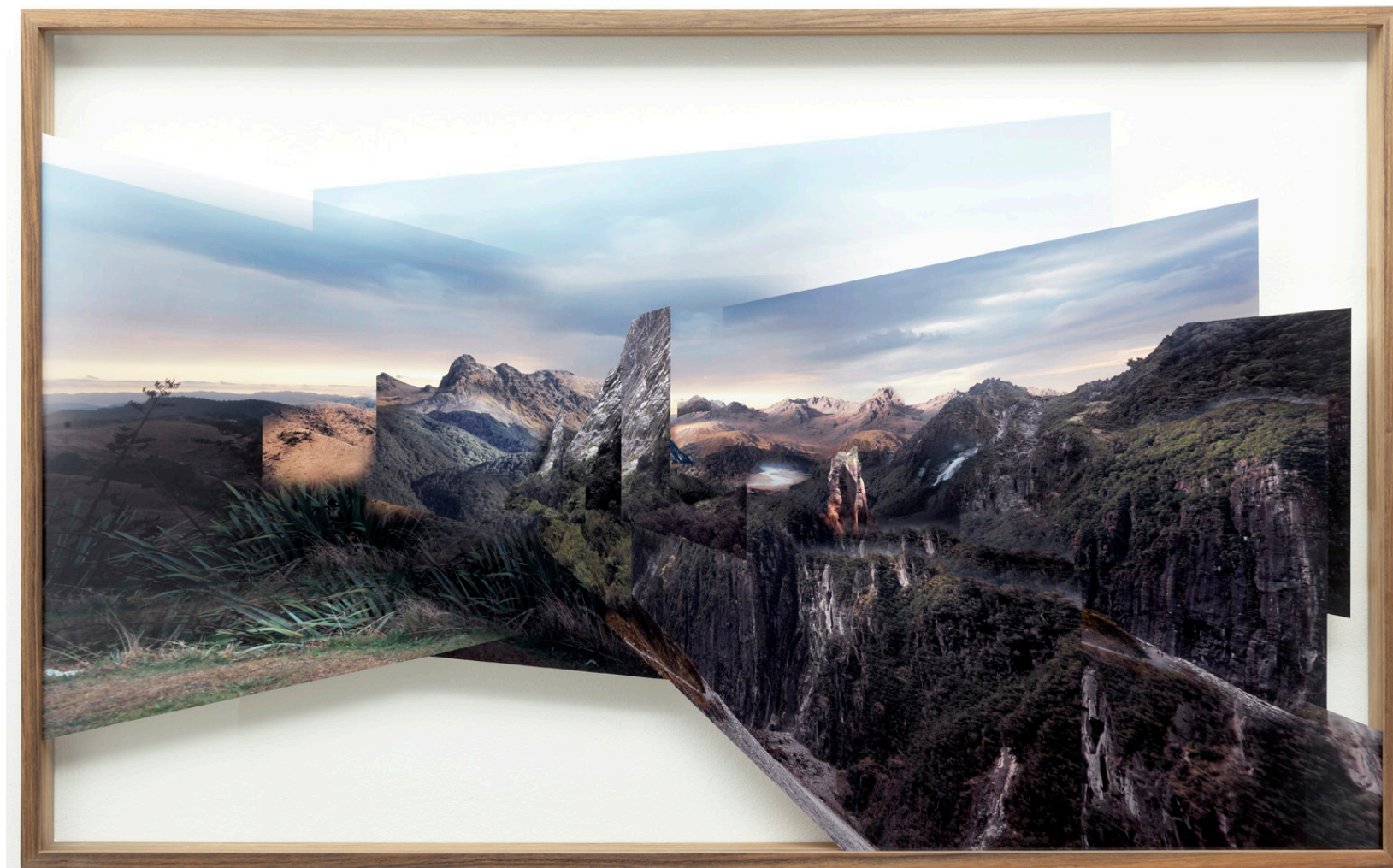
Broersen & Lukács, The Valley , 2016, cut out lambda print, framed, 100 x 161 cm