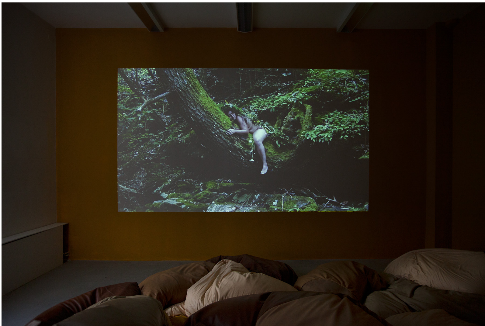
Night Soil – Nocturnal Gardening , 2016, full HD one-channels colour video with sound, 49:47 minutes