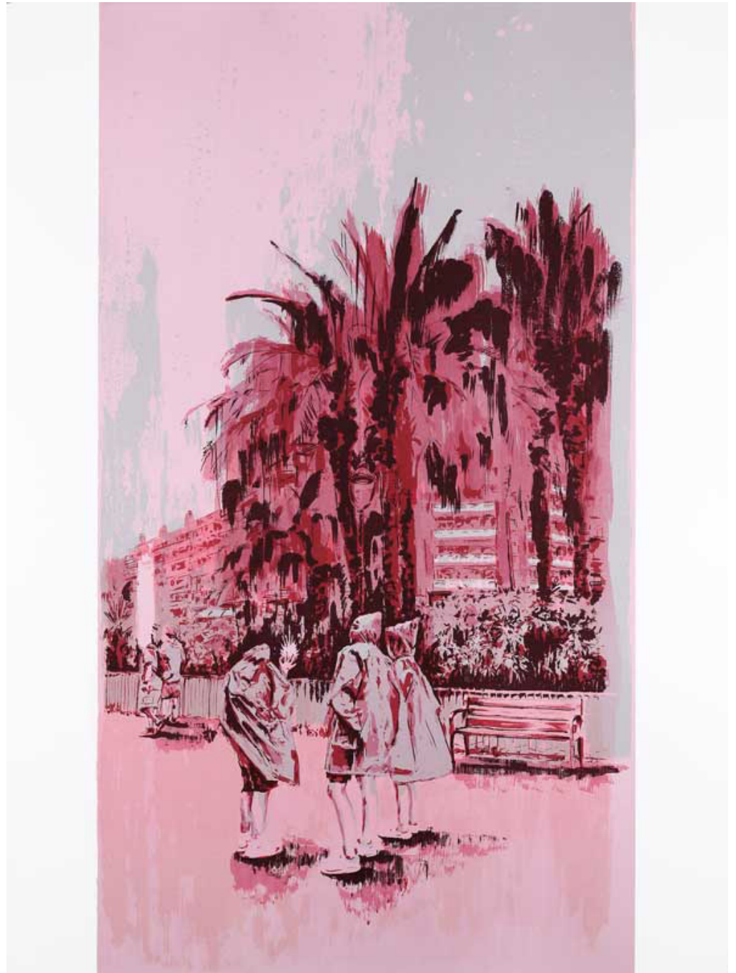
Fever in the Whisper, 2017, silkscreen print on archival cotton-paste paper, framed, 76 x 56 cm