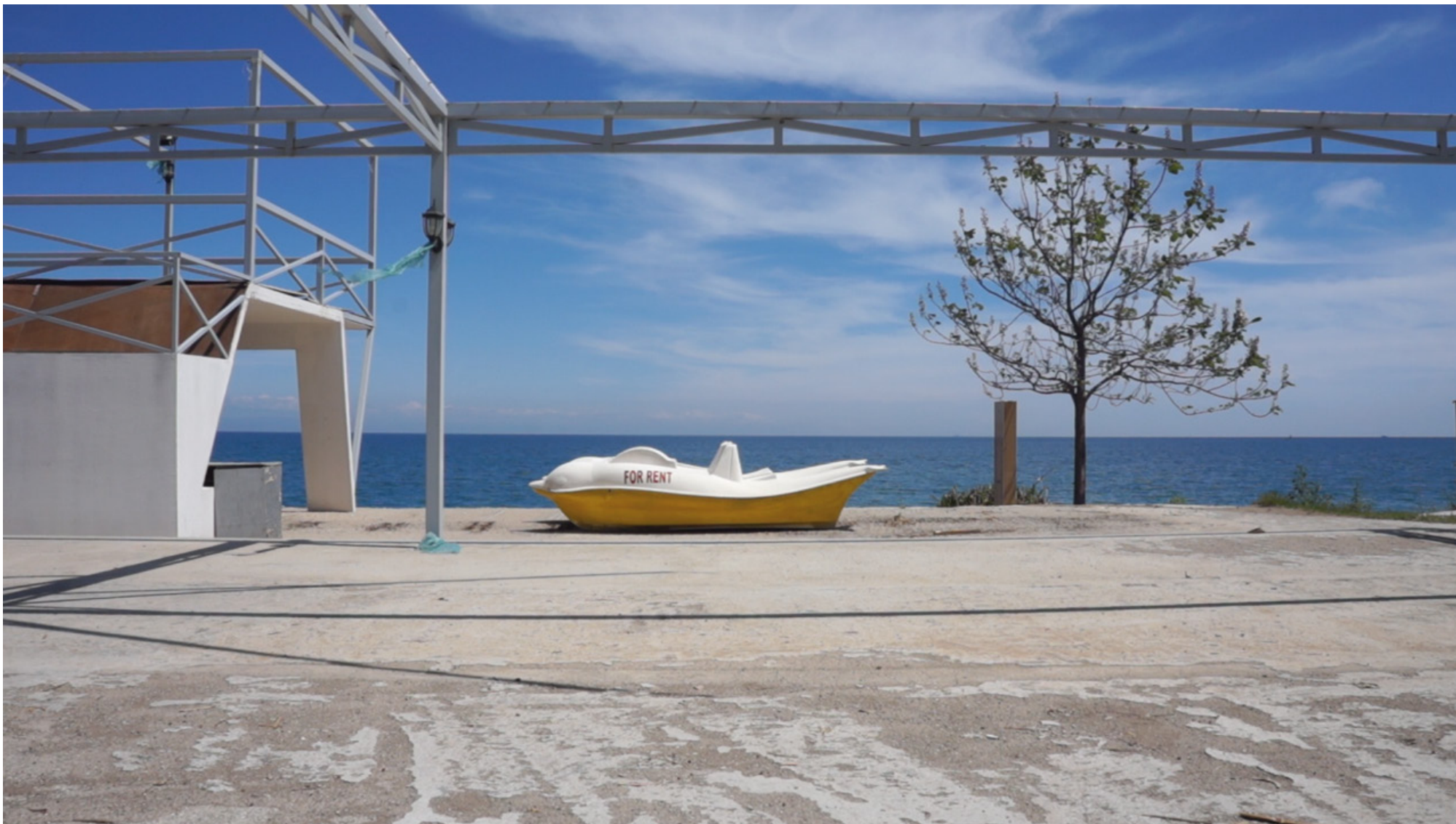
Inge meijer, For Peter , (film still) HD video, loop, stereo sound, 2018