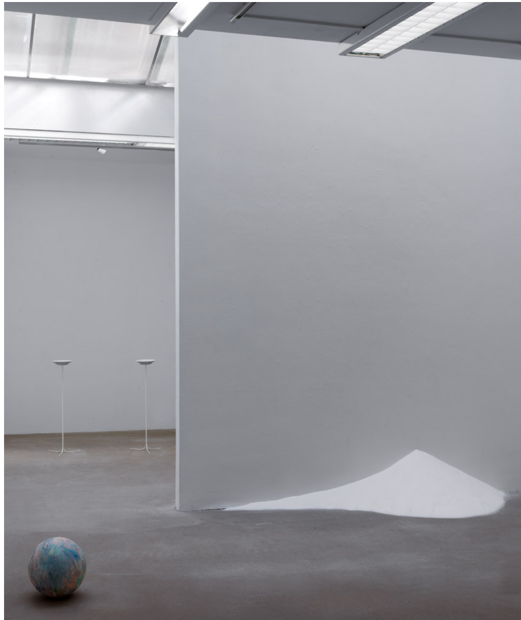
Charbel - joseph H. Boutros, Dream Salt , 2014, sugar and salt, size variable in: What Can A Dot Become? Overview at AKINCI, 2019