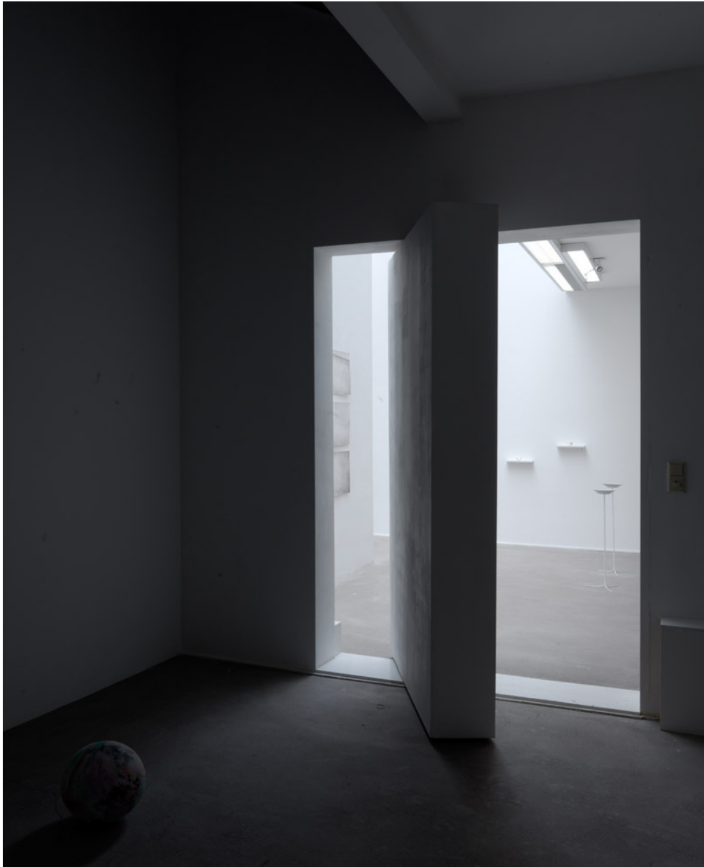
What Can A Dot Become? Overview at AKINCI, 2019