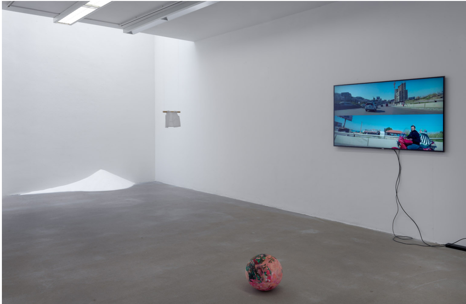
What Can A Dot Become? Overview at AKINCI, 2019