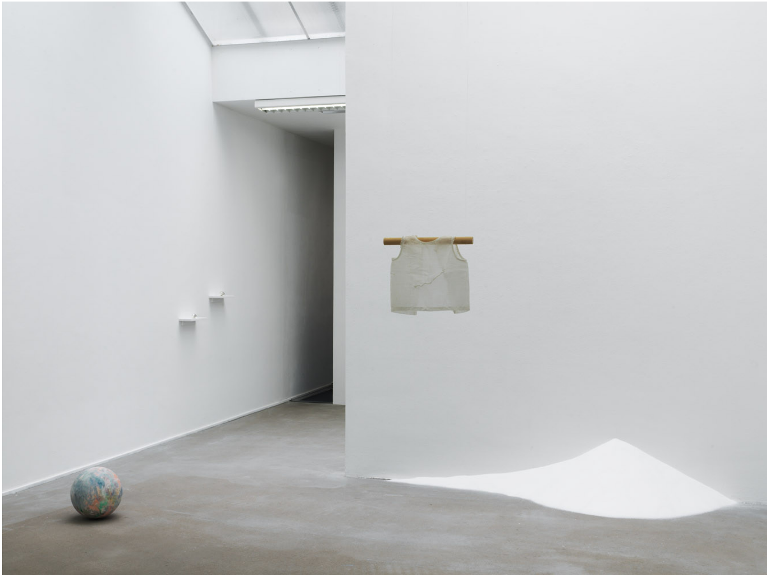
What Can A Dot Become? Overview at AKINCI, 2019