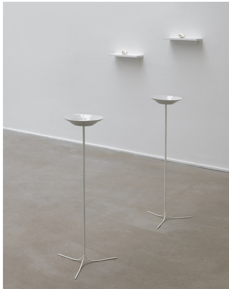
Stéphanie Saadé, Contemplating an Old Memory , 2017, 24-carat gold cast of a lentil seed, live lentil sprout of the same seed, plates, iron, water, dimensions variable in: What Can A Dot Become? Overview at AKINCI, 2019

A lentil seed is moulded and cast in gold, without being damaged. Water is poured on the opening day on the same original lentil seed, which eventually sprouts and grows. The cast and the growing plant are exhibited side by side.