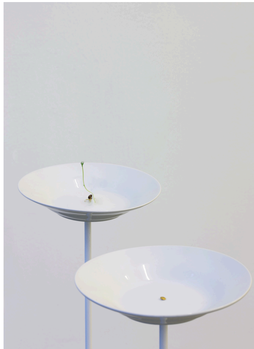
Stéphanie Saadé, Contemplating an Old Memory , 2017, 24-carat gold cast of a lentil seed, live lentil sprout of the same seed, plates, iron, water, dimensions variable

Another work, this time by Charbel-joseph H.Boutros (Lebanon, 1980), evokes sleep and unconsciousness. The subject characterises largely the artist's practice, and his work Night Cartography (2011-2019) is at the start of several other series all aiming at materializing sleep. Here, sleep takes the shape of a black hole – we