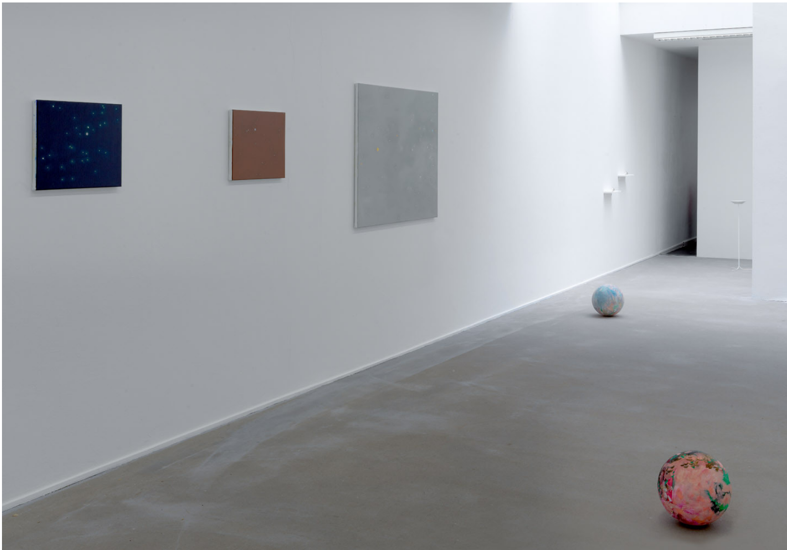
What Can A Dot Become? Overview at AKINCI, 2019