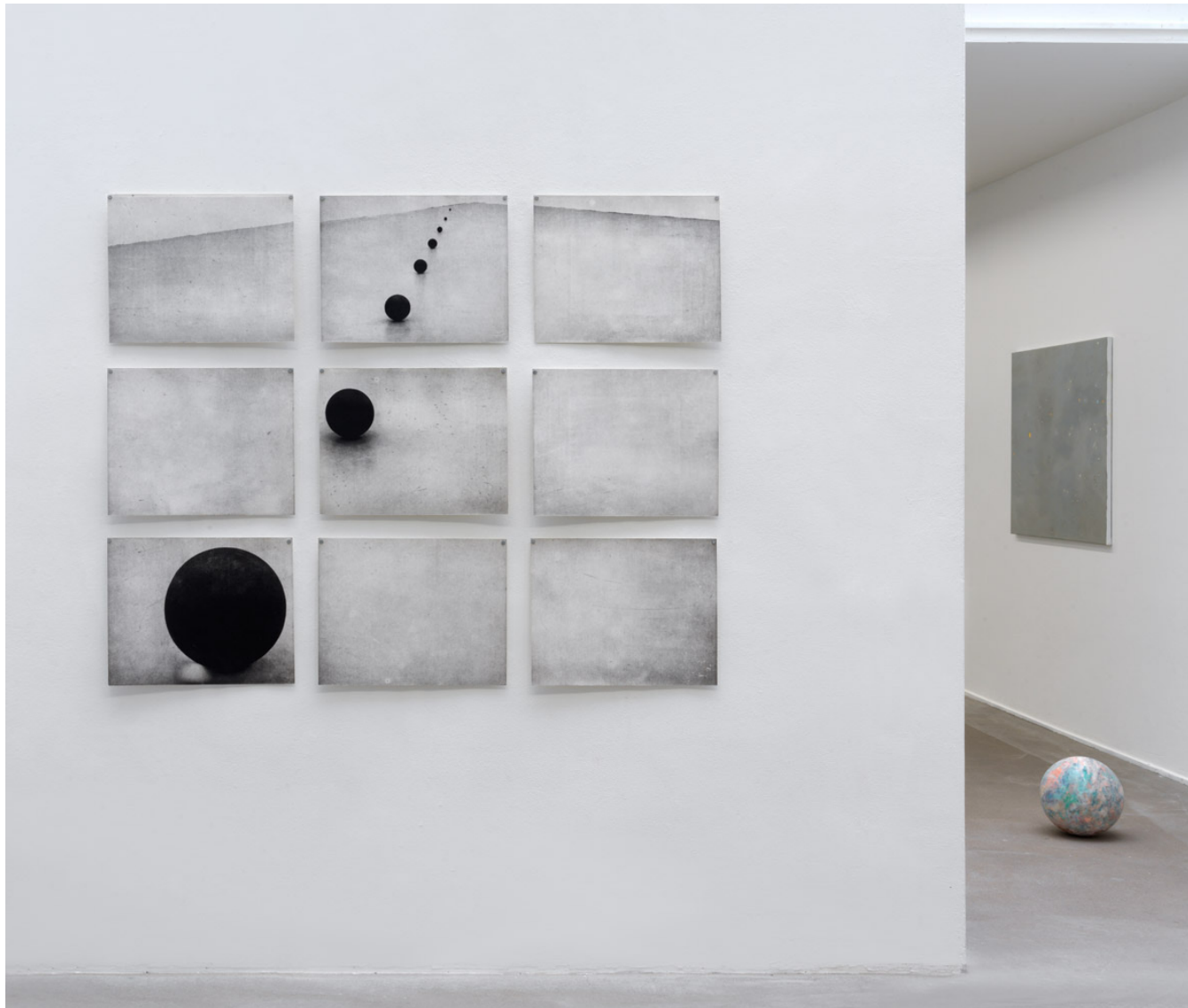
What Can A Dot Become? Overview at AKINCI, 2019