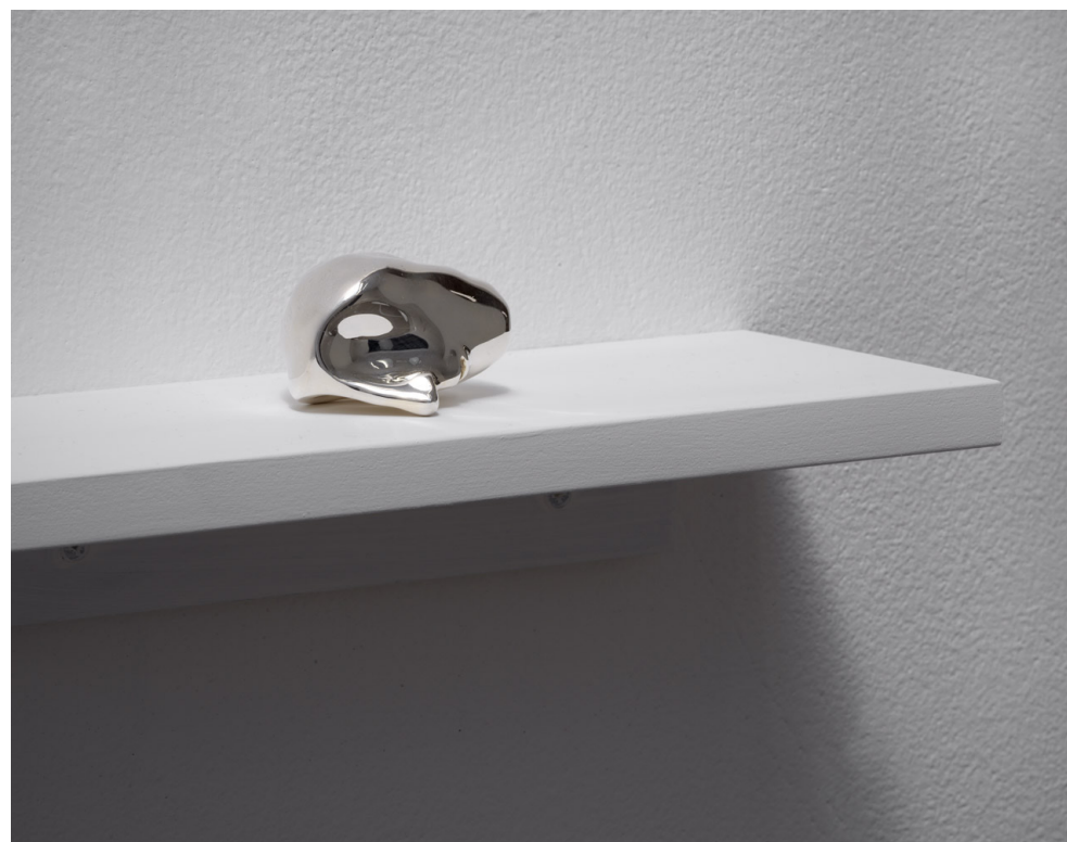
Sirine Fattouh, The Sleepers (7 individual ones) , 2019, Clay, brass, coated with silver, approx. 10x5 cm

'The Sleepers' is a project initiated in 2017 as a result of recurrent insomnia. Each sculpture corresponds to a night of insomnia. The silver sleepers can be held in hand and reflect the face of the person holding it as well as the surrounding space.