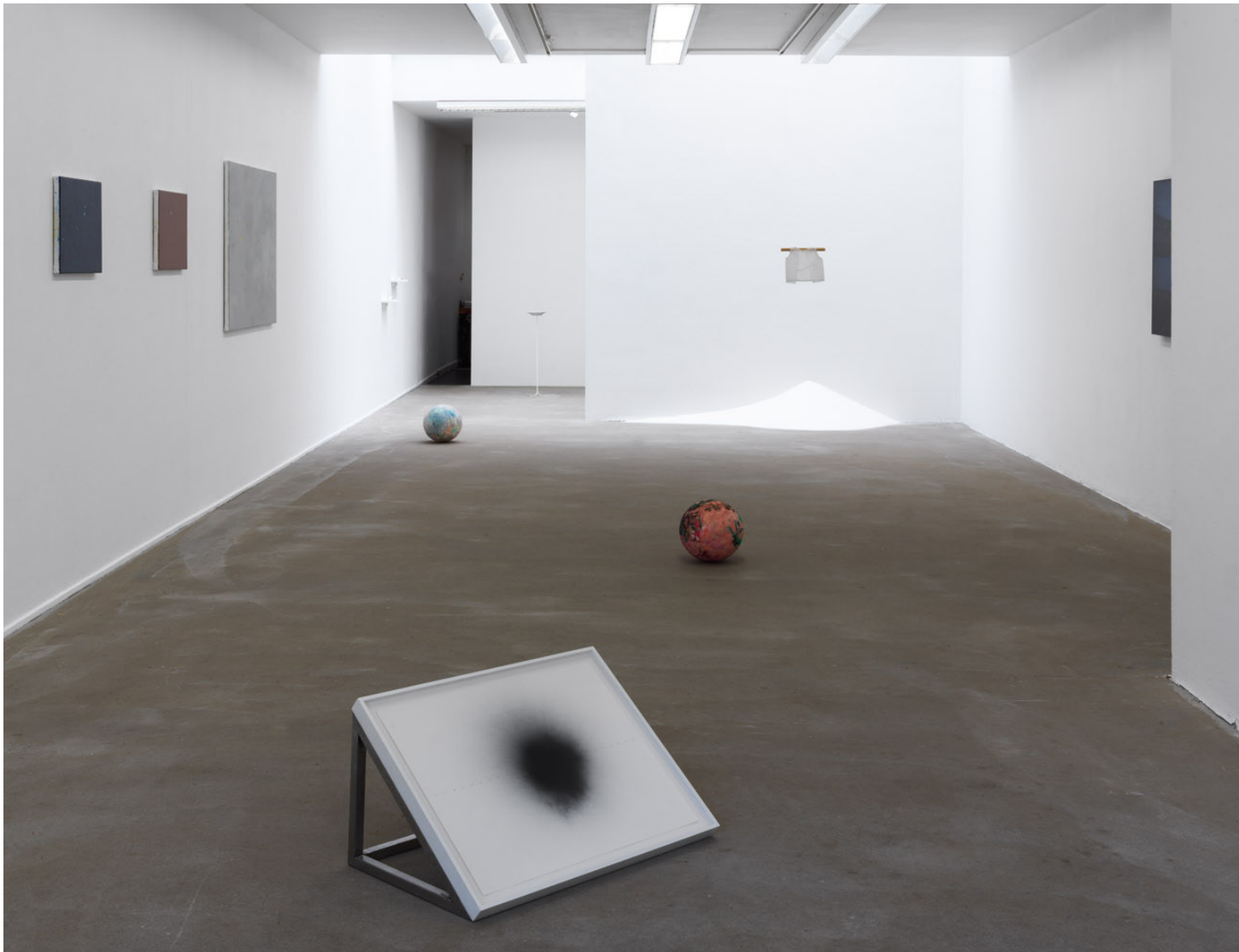
What Can A Dot Become? Overview at AKINCI, 2019