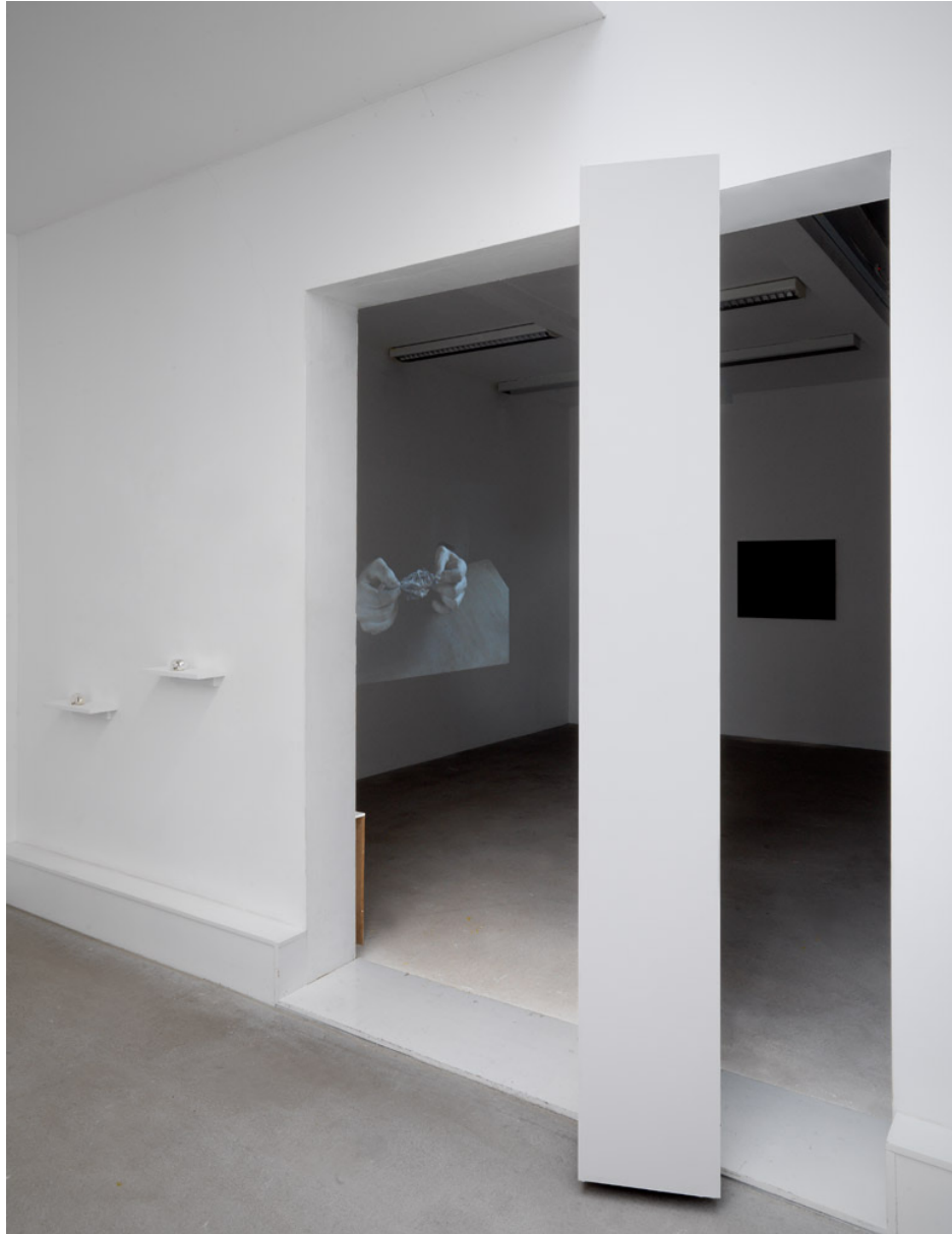
What Can A Dot Become? Overview at AKINCI, 2019