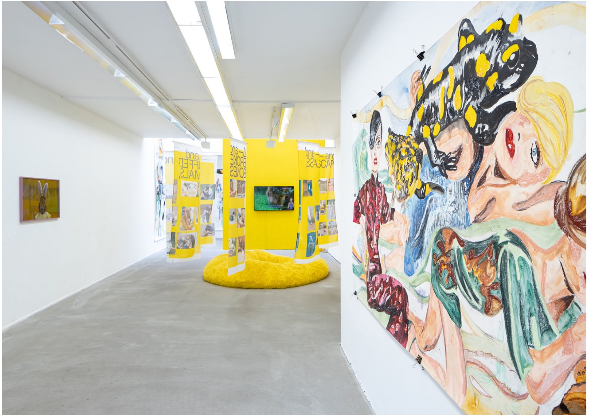
Installation View at AKINCI