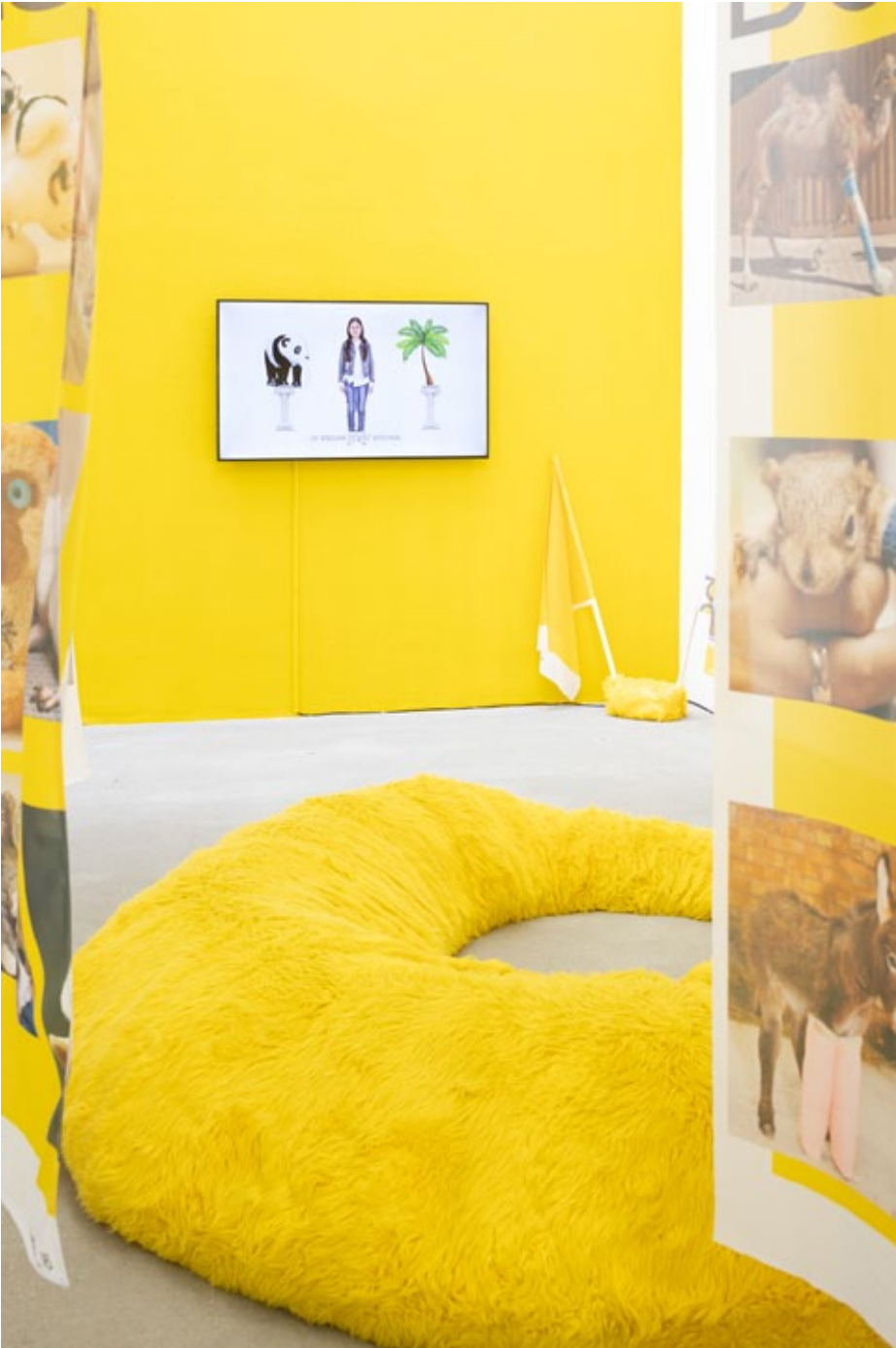
melanie bonajo, Progress vs Sunsets, 2019, full HD one-channel colour video with sound, 48:20 minutes