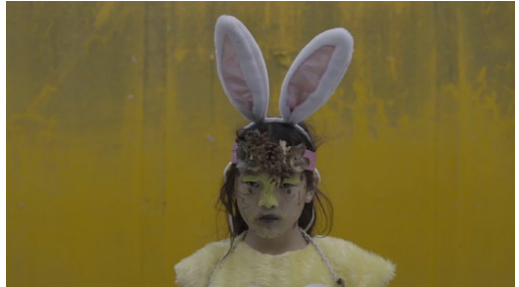
melanie bonajo, Progress vs Sunsets (Daisy), 2019, Ultra chrome, canson Lustre, museum glass, 54,5x97,5 cm

On a deeper level this film is a research about how close children are capable to feel related to non-human animals and what that could mean for the survival of the species.