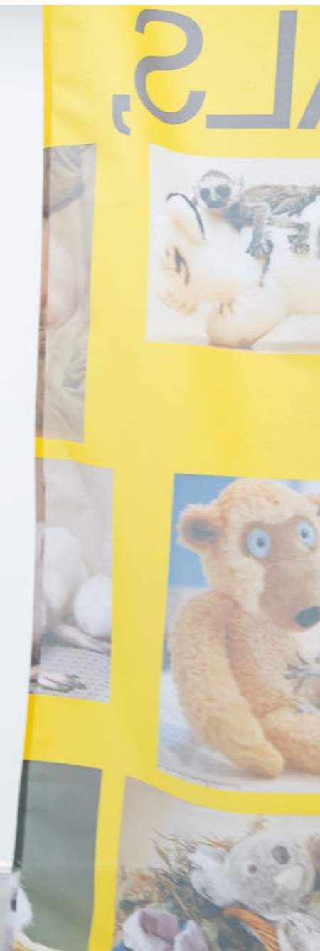
melanie bonajo, Progress vs Sunsets (Daisy), 2019, Ultra chrome, canson Lustre, museum glass, 54,5x97,5 cm