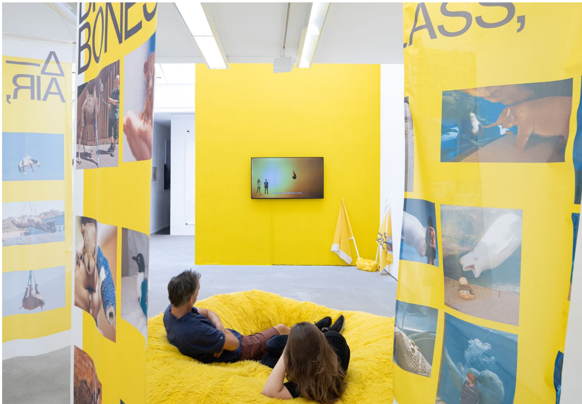
Installation View at AKINCI