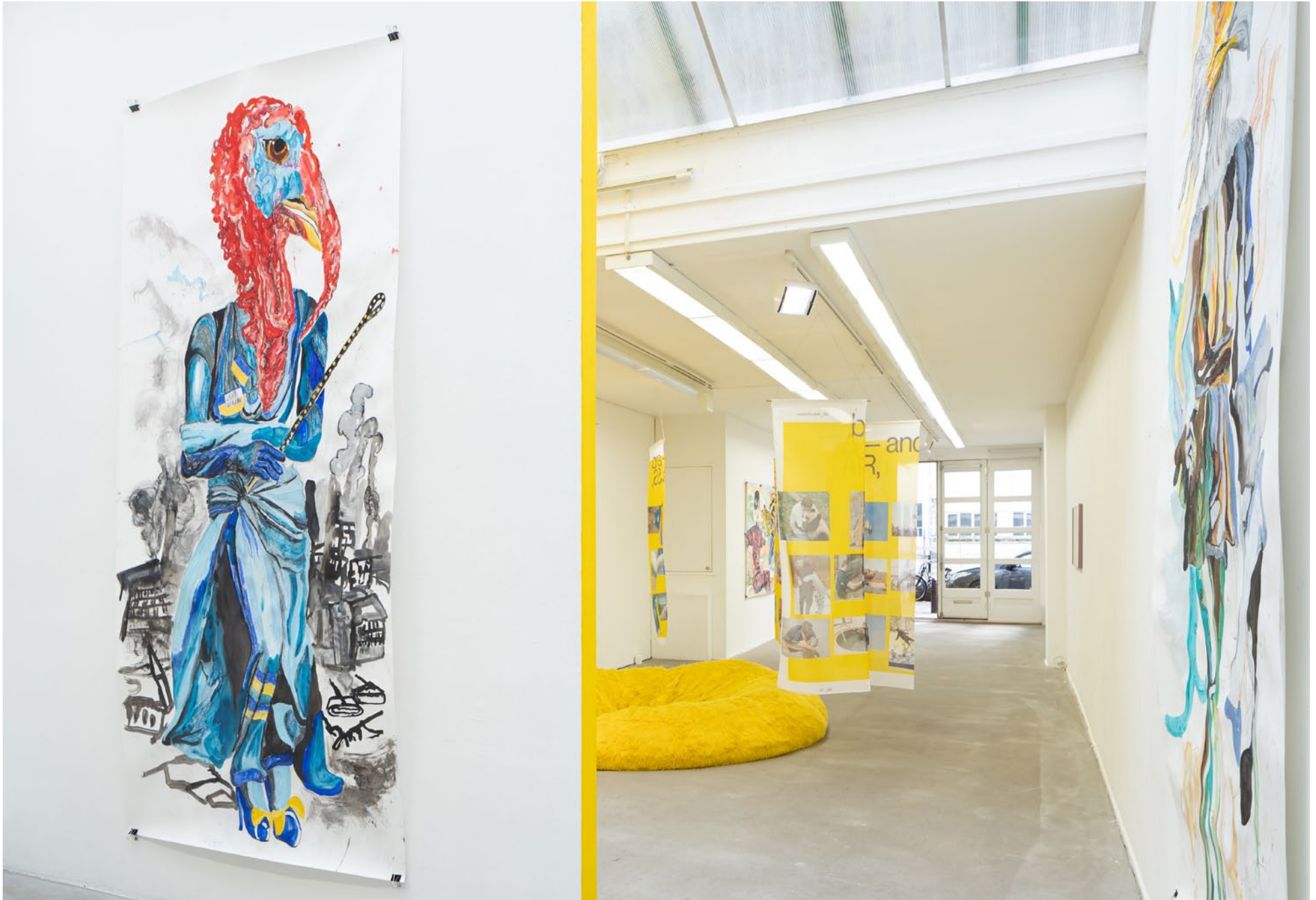
Installation View at AKINCI