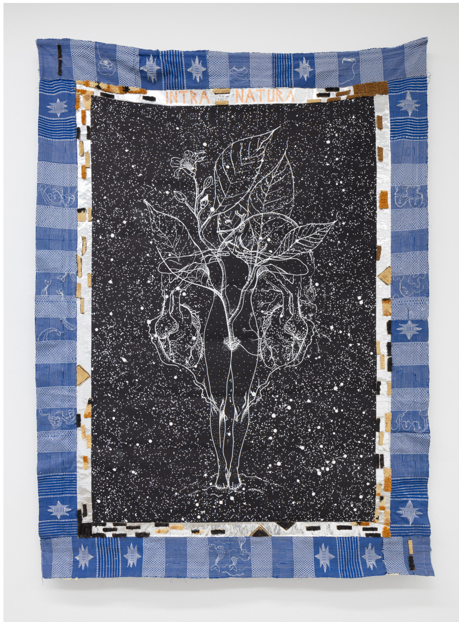
Human intra natura #2 La Nuit, 2021, Raphia Kita, various threads, aluminium, canvas 135 x 185 cm