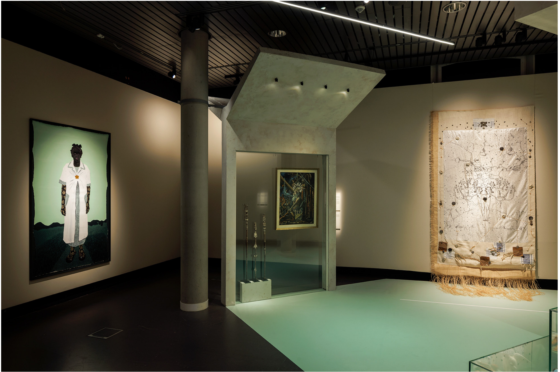
Ofi titi , 2022, installation view In Schitterend Licht , Wereldmuseum Leiden, 2023, photo by Aad Hoogendoorn