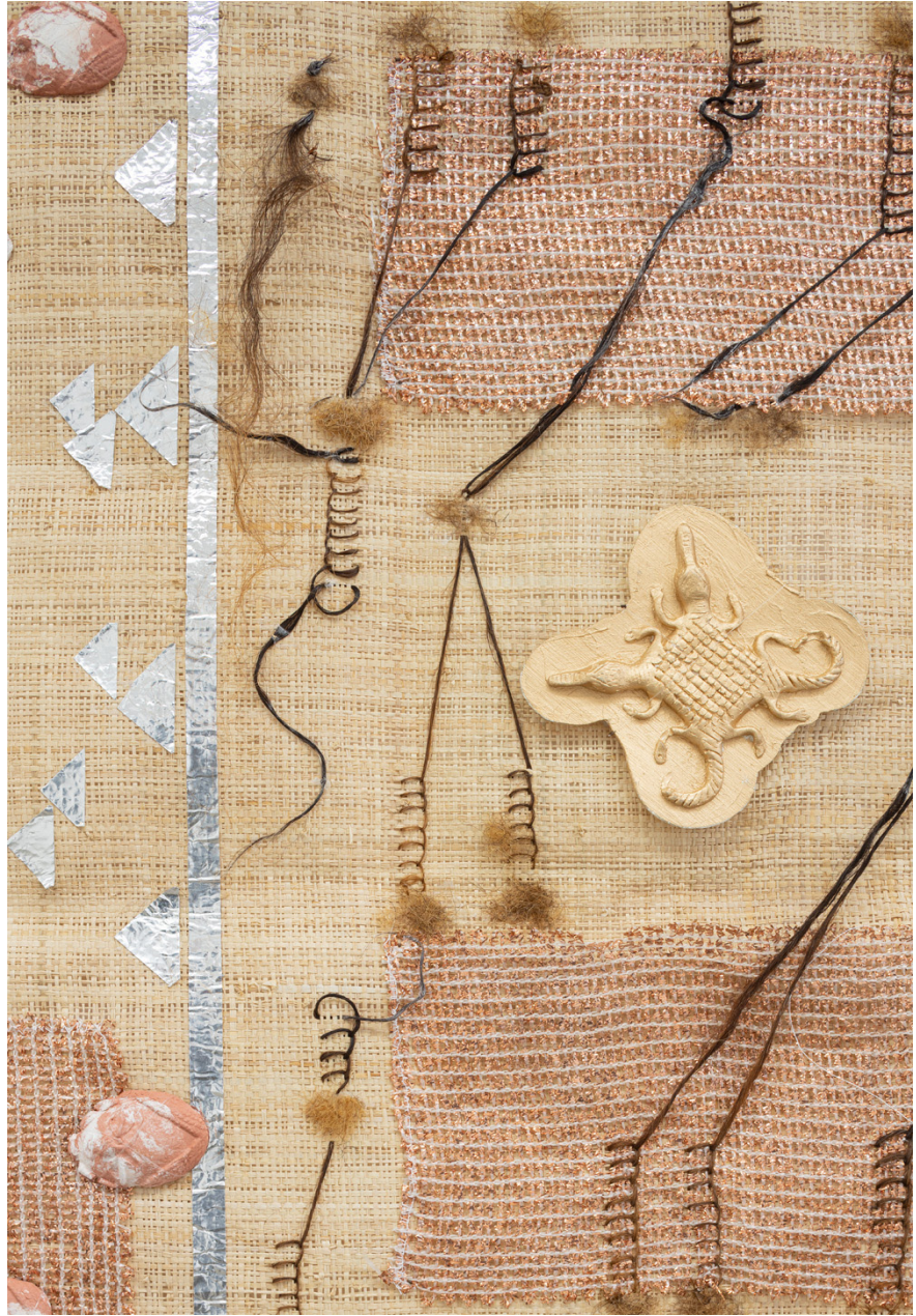
Interconnection (with drawing), 2022, mixed materials, 90 x 150 cm