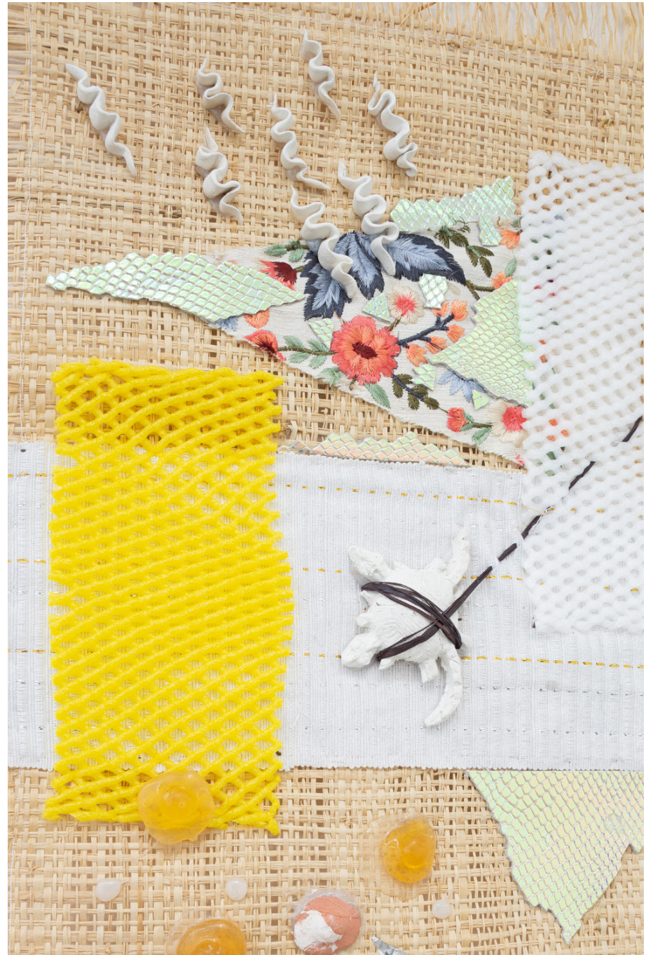
Interconnection (with drawing), 2022, mixed materials, 90 x 150 cm (detail), photo by Peter Tjihuis