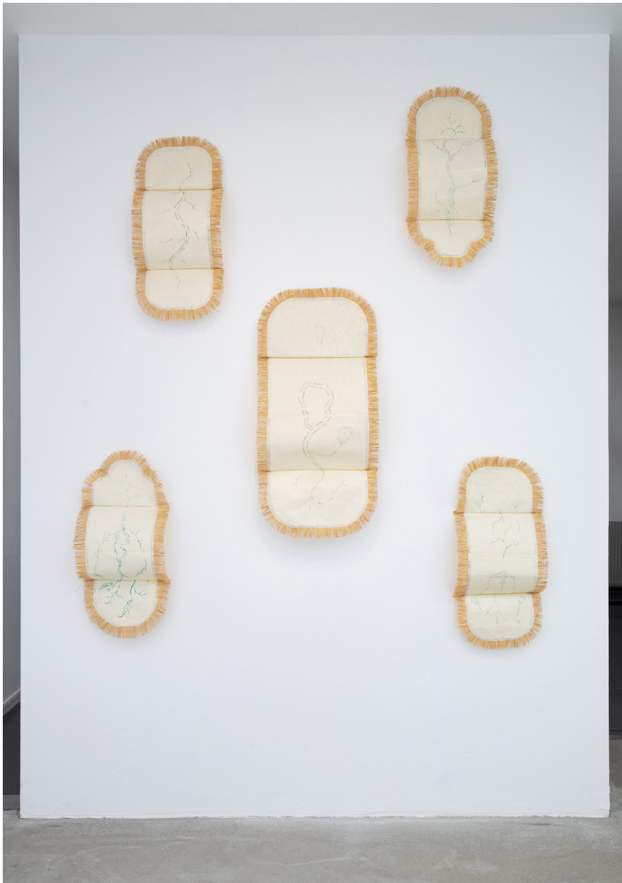
Flora 1-5, 2023, tenjin paper, ink, vegetable, 75 x 35 cm each