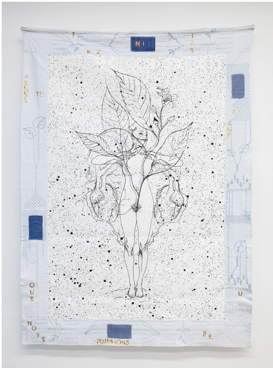
Human intra natura #2 Le Jour, Raphia Kita, various threads, aluminium, canvas 135 x 185 cm