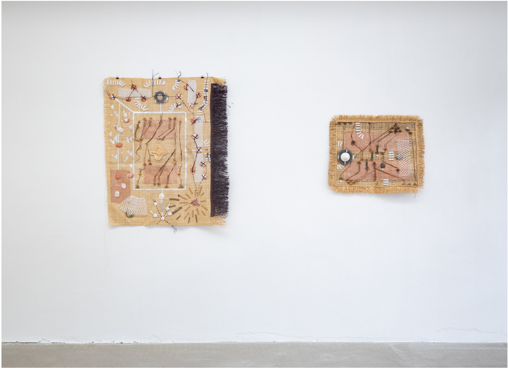
Installation view group exhibition rooted, AKINCI, 2023