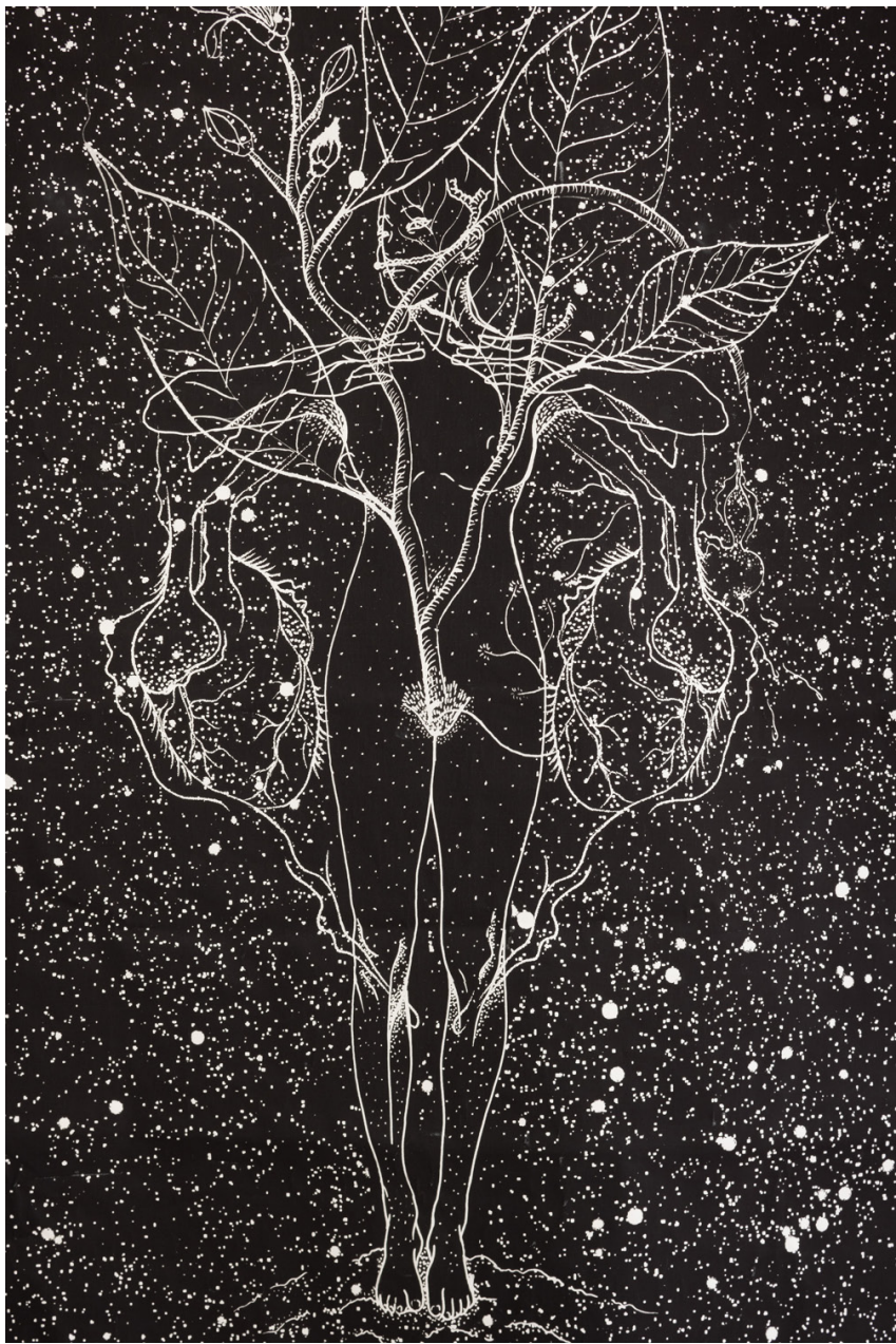
Marie-Claire Messouma Manlanbien, Human intra natura #2 La Nuit , 2021, raphia, various threads, aluminium, canvas 135 x 185 cm (detail)