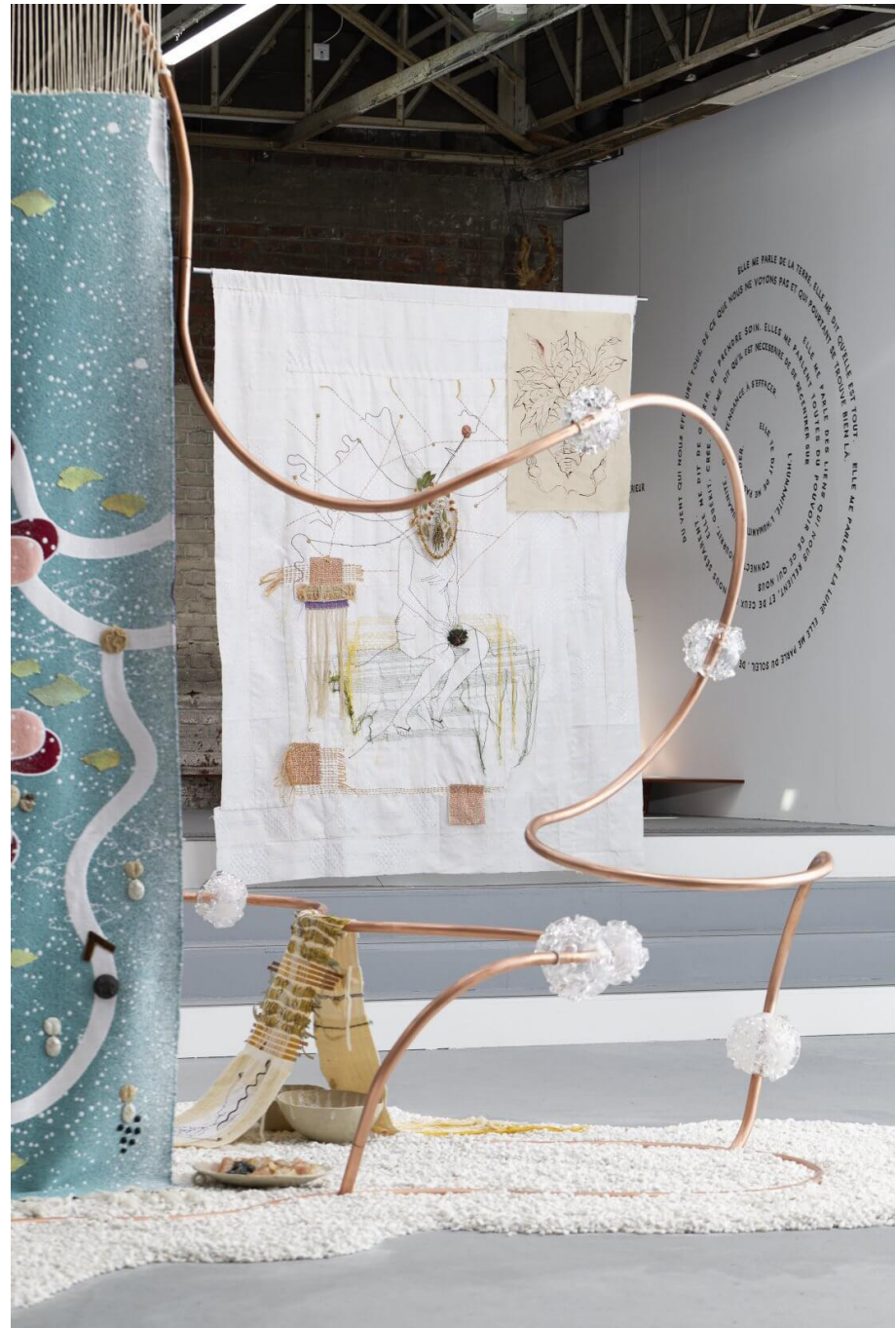
Installation view solo exhibition L'être, l'autre et l'entre , Palais de Tokyo, 2023, Paris, photo by Quentin Chevrier