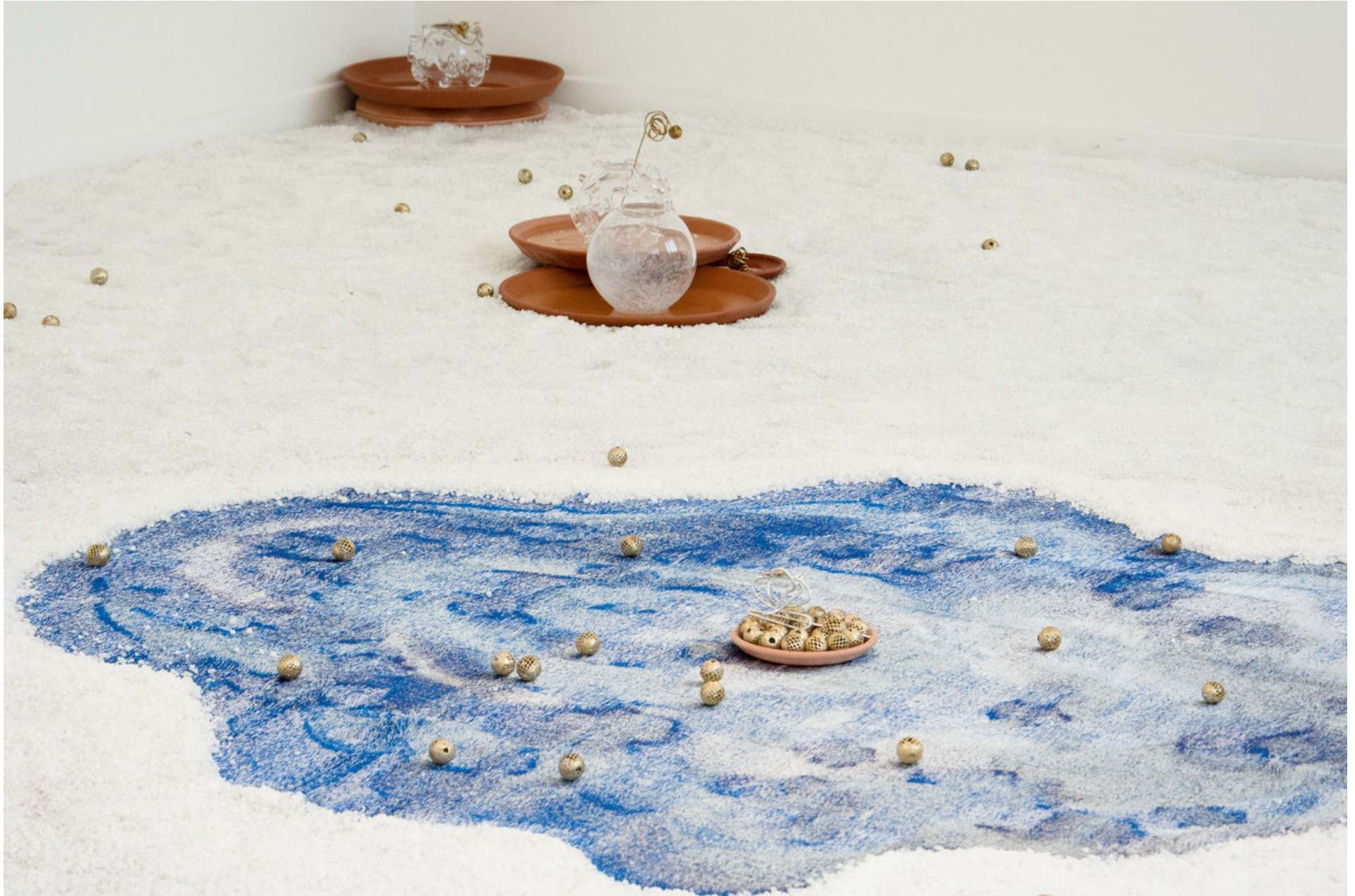
Installation view La Biennale di Venezia 60th international art exhibition, presenting Ivory Coast with the exhibition The Blue Note, Centro Culturale Don Orione Artigianelli, Venice, Italy, 2024