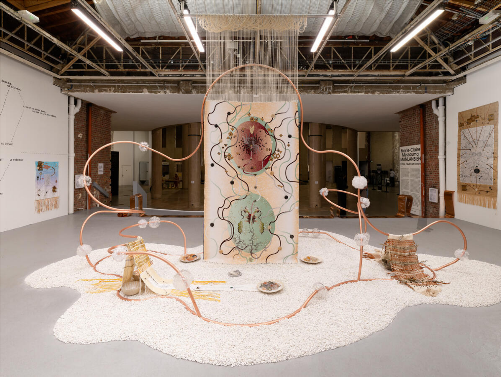
Installation view solo exhibition L'être, l'autre et l'entre , Palais de Tokyo, 2023, Paris