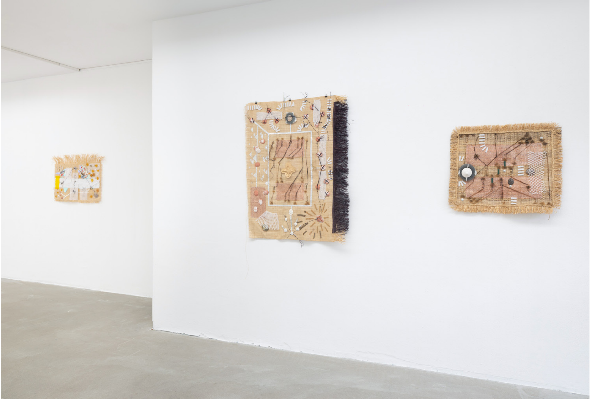
Installation view group exhibition rooted, AKINCI, 2023