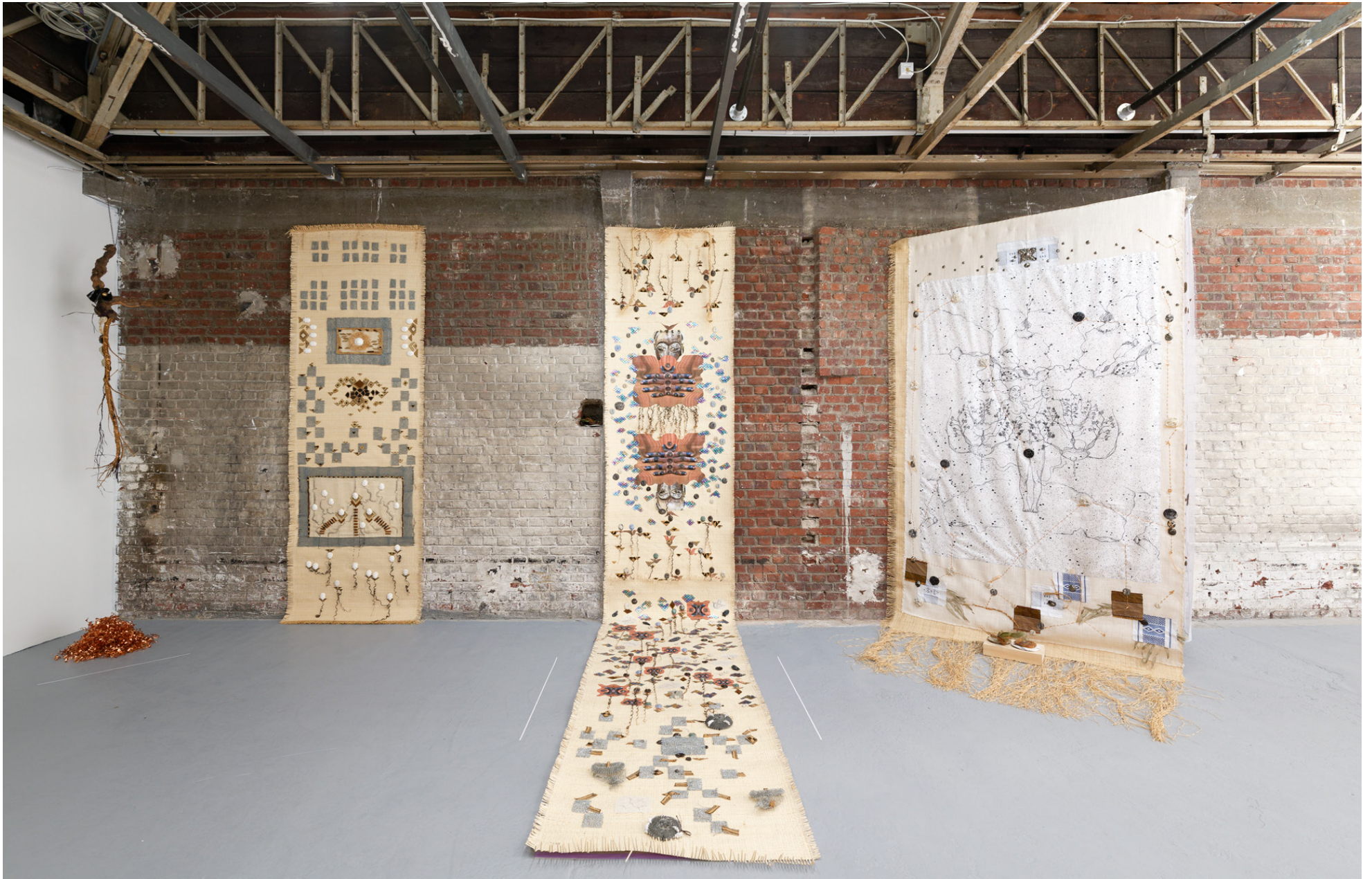
Installation view solo exhibition L'être, l'autre et l'entre, Palais de Tokyo, 2023, Paris