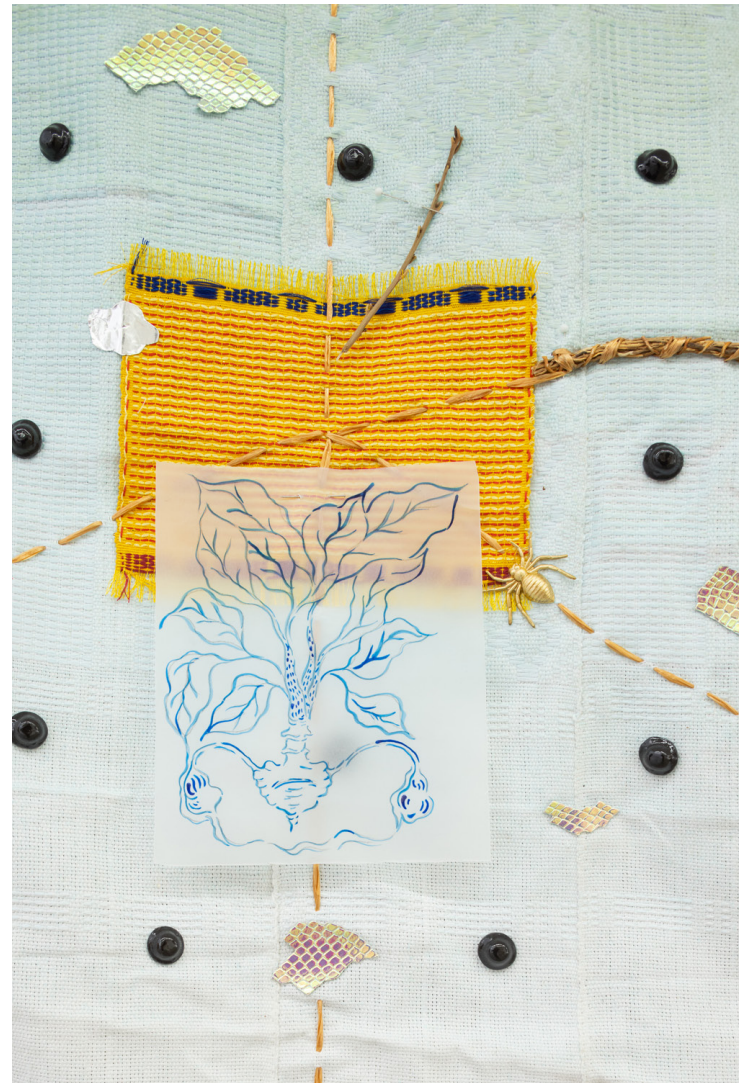
Marie-Claire Messouma Manlanbien, Paysage de soin #9 , 2024, textile, ceramic, shell, cuir de sirène, drawing on paper, raffia, 120 x 99 cm (detail)