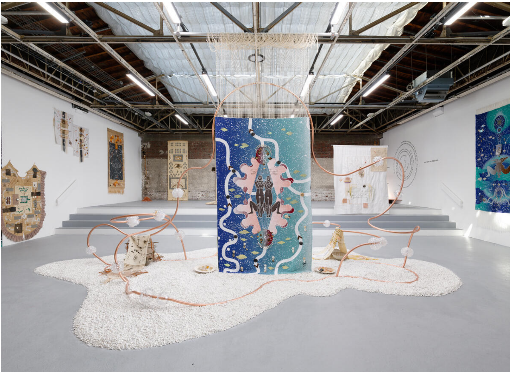
Installation view solo exhibition L'être, l'autre et l'entre, Palais de Tokyo, 2023, Paris