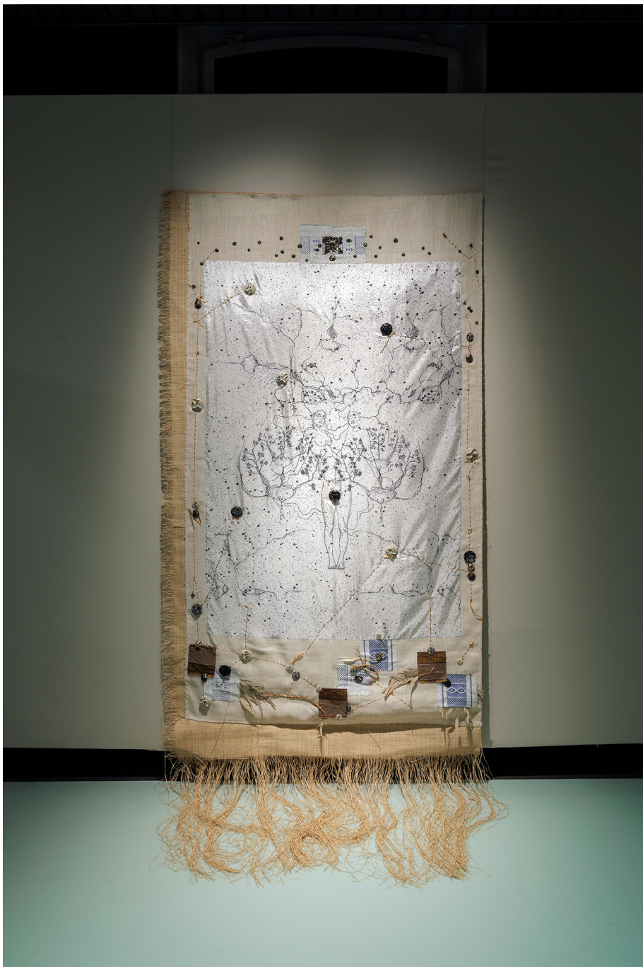
Ofi titi, 2022, installation view In Schitterend Licht, Wereldmuseum Leiden, 2023, photo by Aad Hoogendoorn