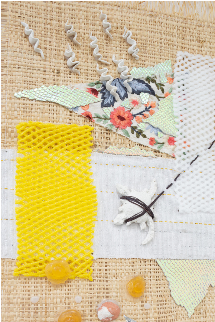
Interconnection (with drawing), 2022, mixed materials, 90 x 150 cm