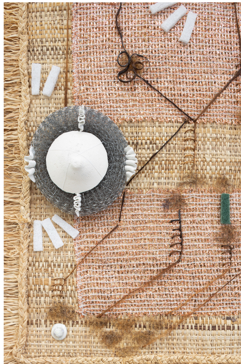
Map, 2019-23, mixed materials, 61 x 72 cm (detail)