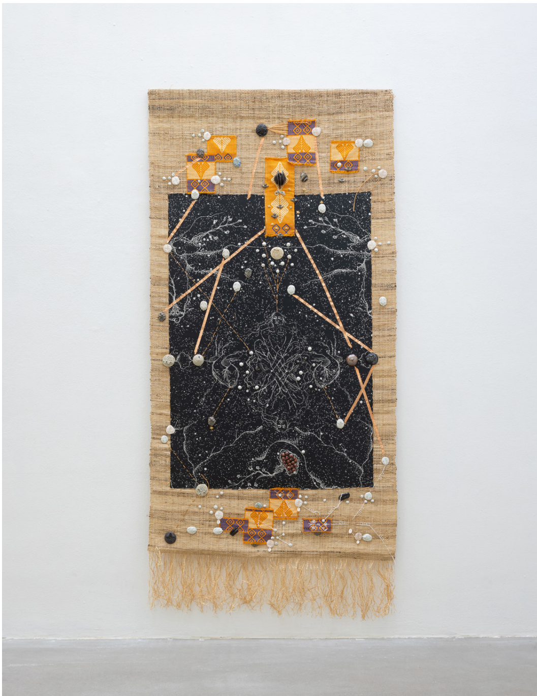
Marie-Claire Messouma Manlanbien, Organic Landscapes - La nuit #2, 2023, cotton, raffia, silk, ceramic, shells, plants, 250 x 120 cm