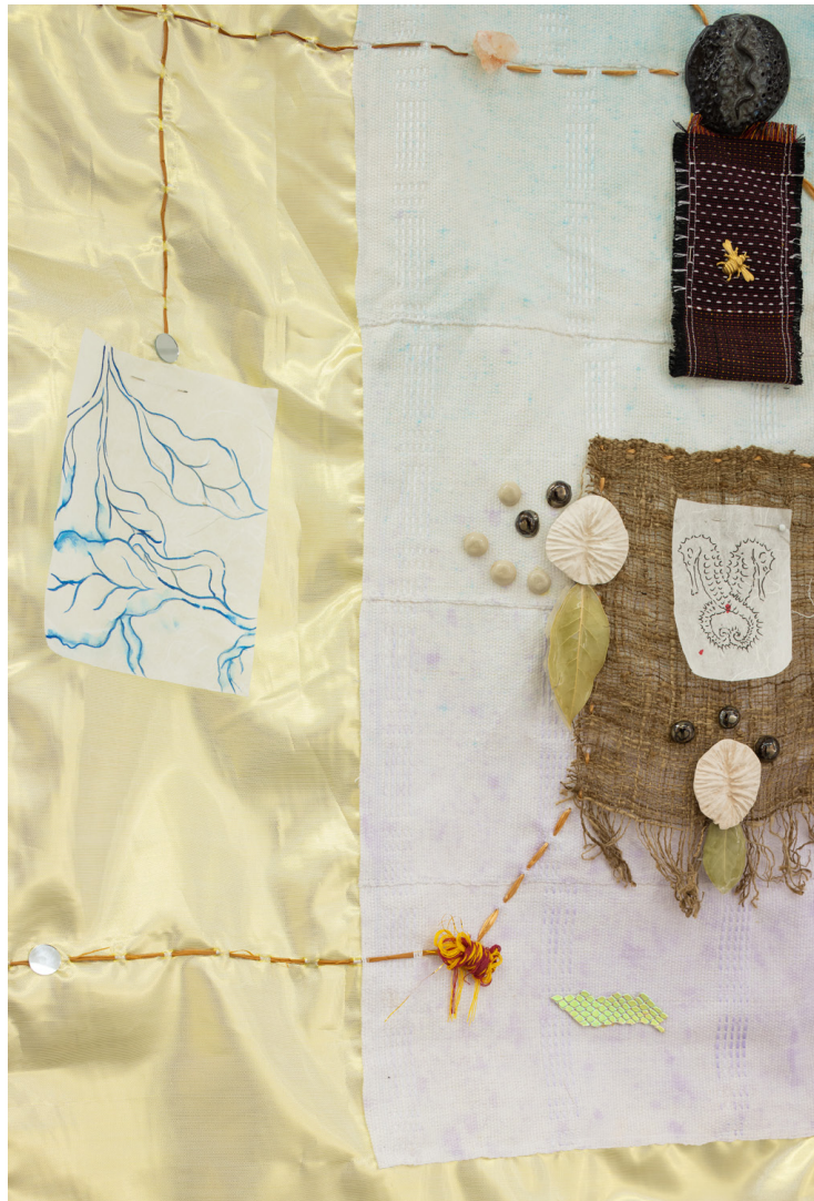
Marie-Claire Messouma Manlanbien, Paysage de soin #1 , 2024, ceramic, jute, plant, textile, tenjin paper, silk, cotton, mirror, 120 x 92 cm (detail)