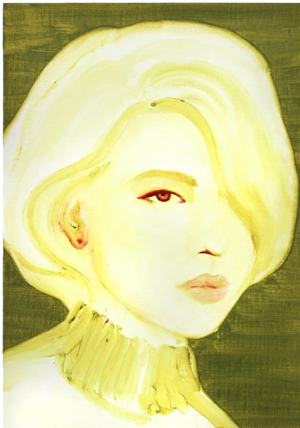
Inconnue que j'ai connue 6, 2023, watercolor on paper, 21 x 15 cm