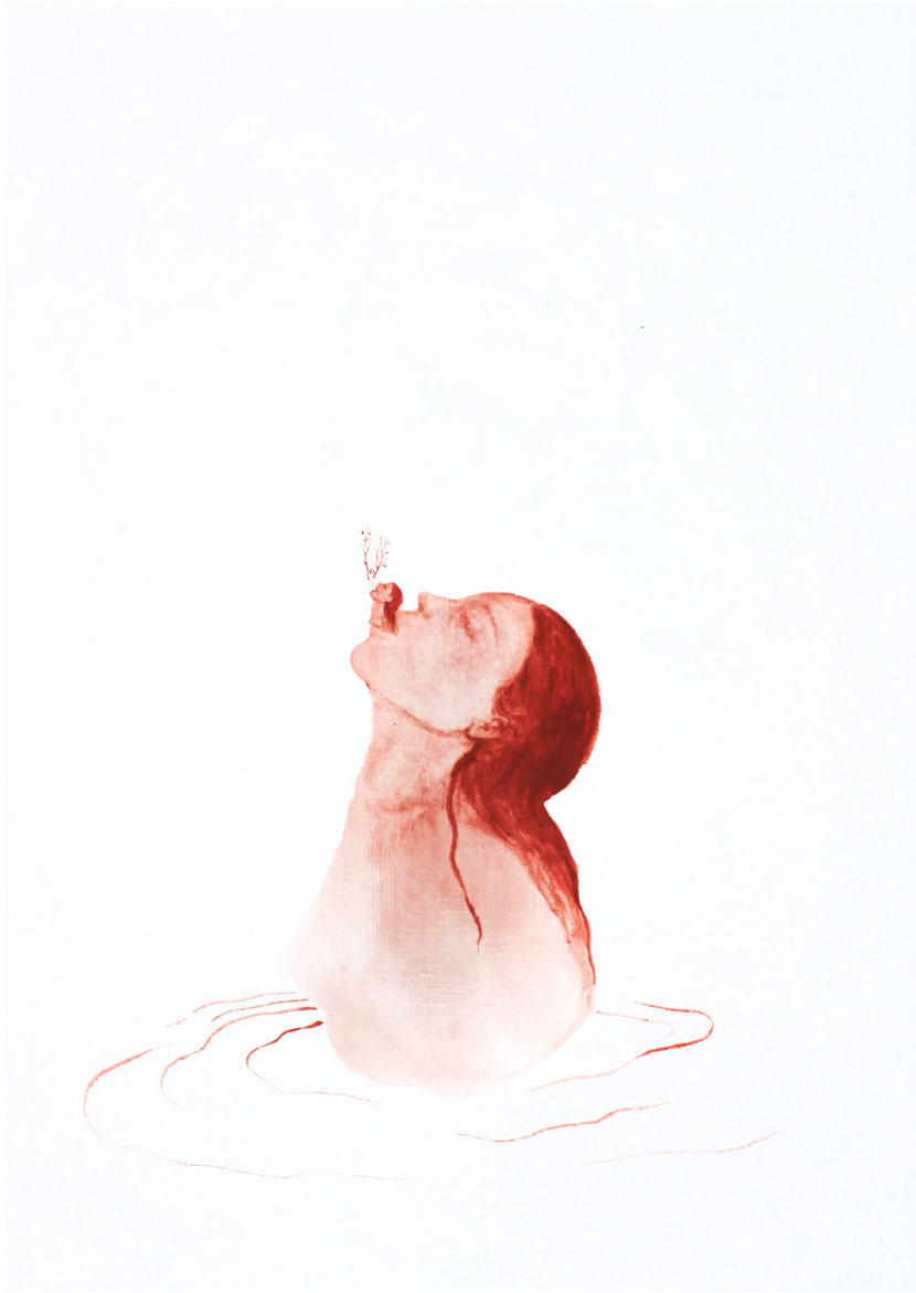
Soul growing 2, 2023, watercolor on paper, 29,5 x 21 cm