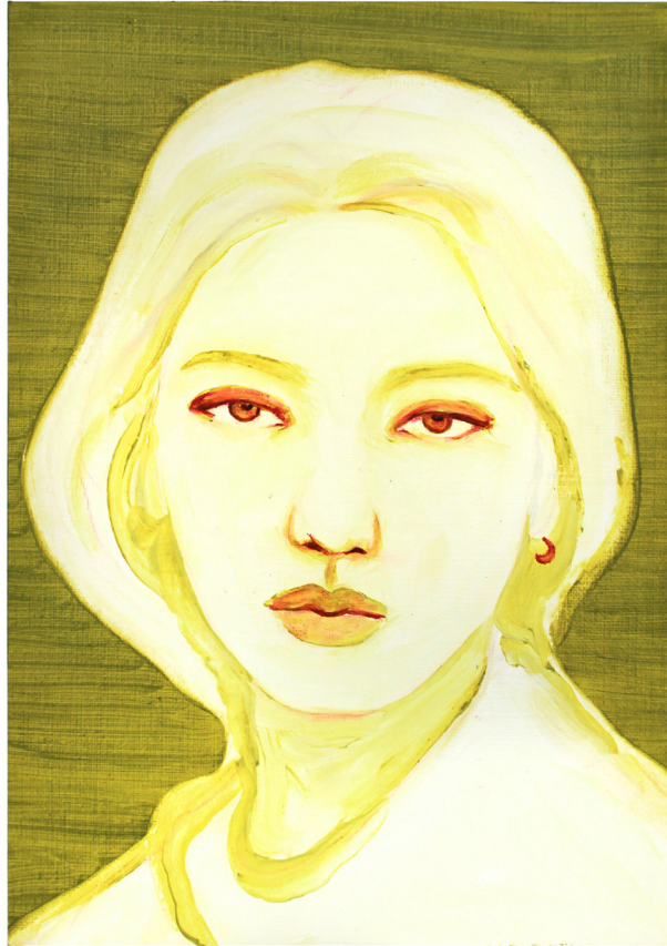
Inconnue que j'ai connue 3, 2023, watercolor on paper, 21 x 15 cm