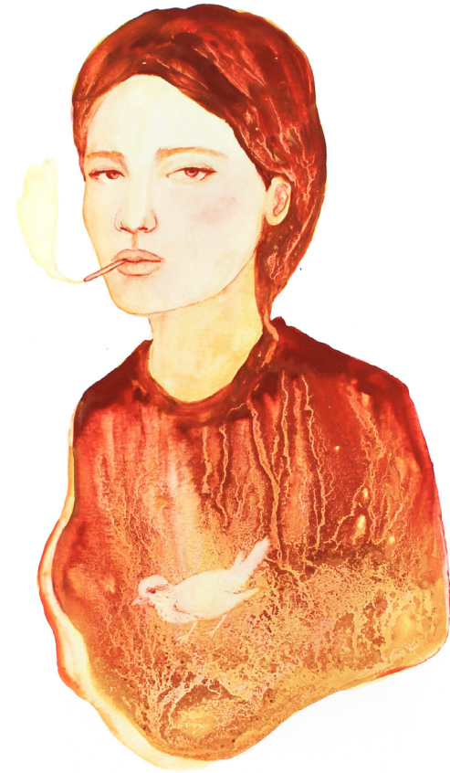
Le ciel, c'est elle 4, 2022, ink on paper, 40,5 x 29,5 cm