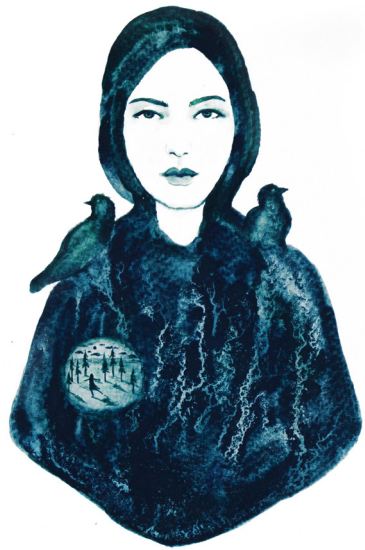
Femme de crépuscu 5, 2023, watercolor on paper, 23,5 x 19 cm