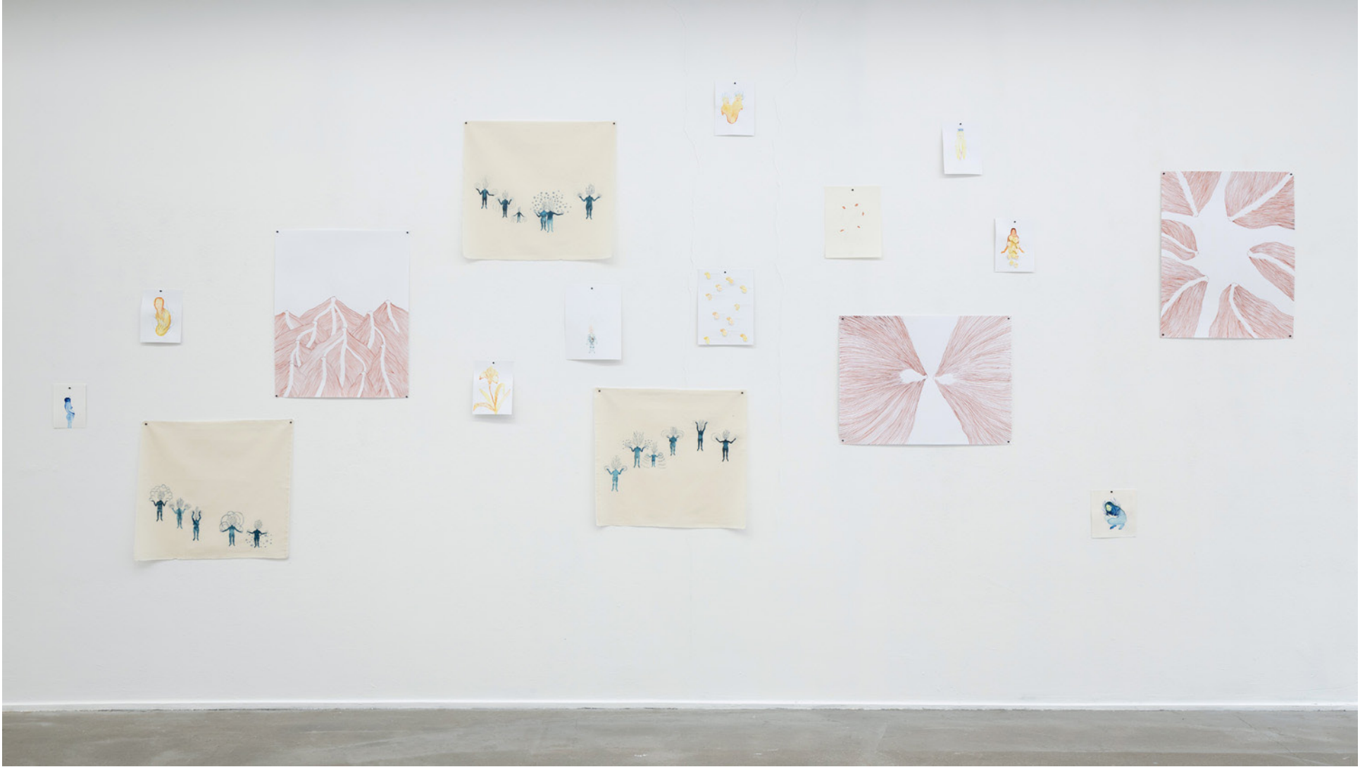
Installation view group exhibition rooted, AKINCI, 2023