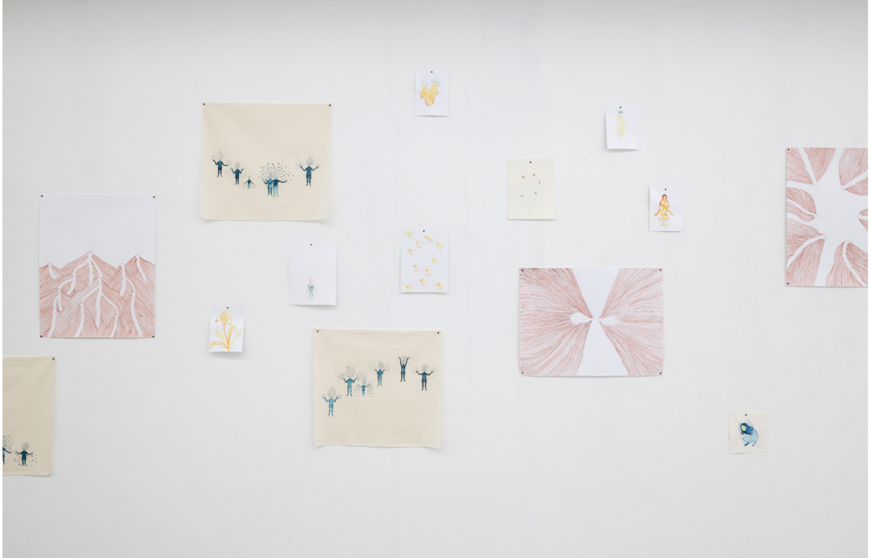
Installation view group exhibition rooted, AKINCI, 2023