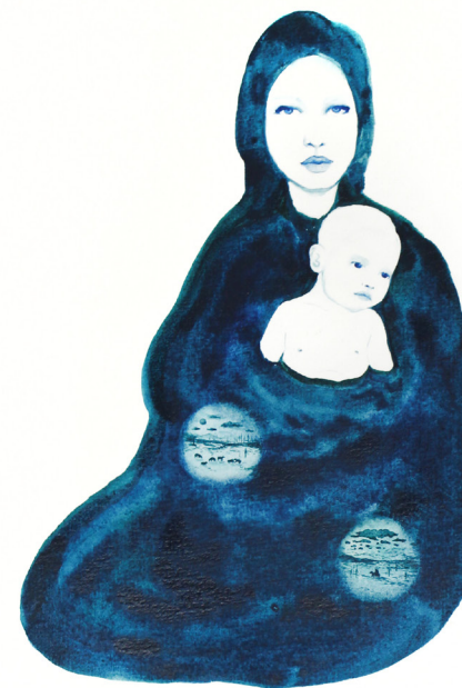
Tendresse de la nuit 2, 2023, watercolor on paper, 42 x 29,7 cm

Odonchimeg Devaadorj was born in 1990 in Mongolia and now lives and works in Paris. She studied at École nationale supérieur d’art, Paris-Cergy between 2014 and 2016 and graduated from Bohemia Institute, Czechoslovakia in 2009. Solo exhibitions in 2023 were at Museum Folkwang, Essen and at Backs\ash gallery, Paris. She recently partook in the group exhibitions at MAMAC, Nice (2023); Maison Caillebotte, Yerres (2023); l’Été des Serpents, Arles (2022); Domaine départemental de Chamarande (2022); Âme Nue, Hamburg (2021); L’Espace de Christian Brest, Paris (2021); Centre d’art Transpalette, Bourges (2021); CAC, Meymac (2019).