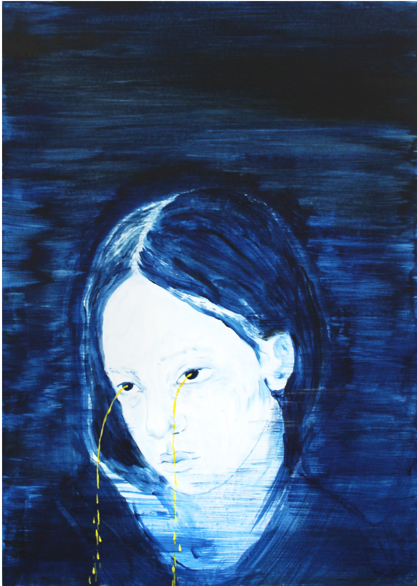
Golden tears, 2021, acrylic on paper, 27 x 21 cm