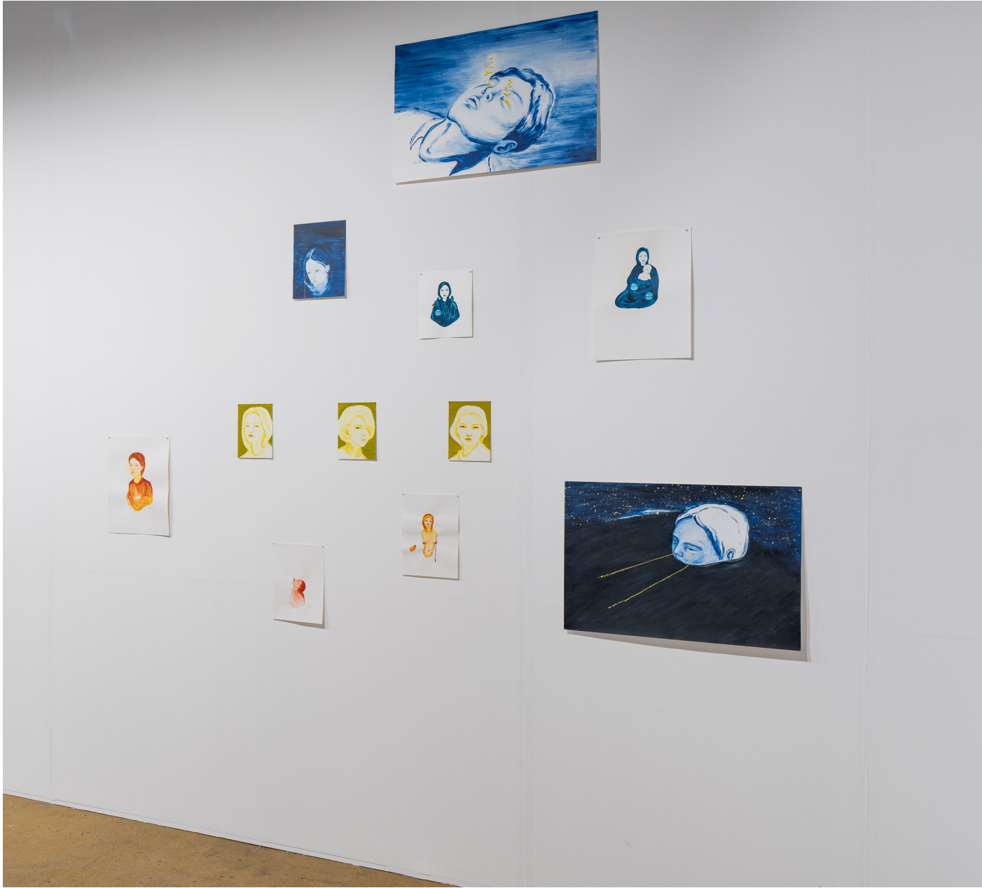
Installation view at AKINCI's booth, Art Rotterdam, 2024