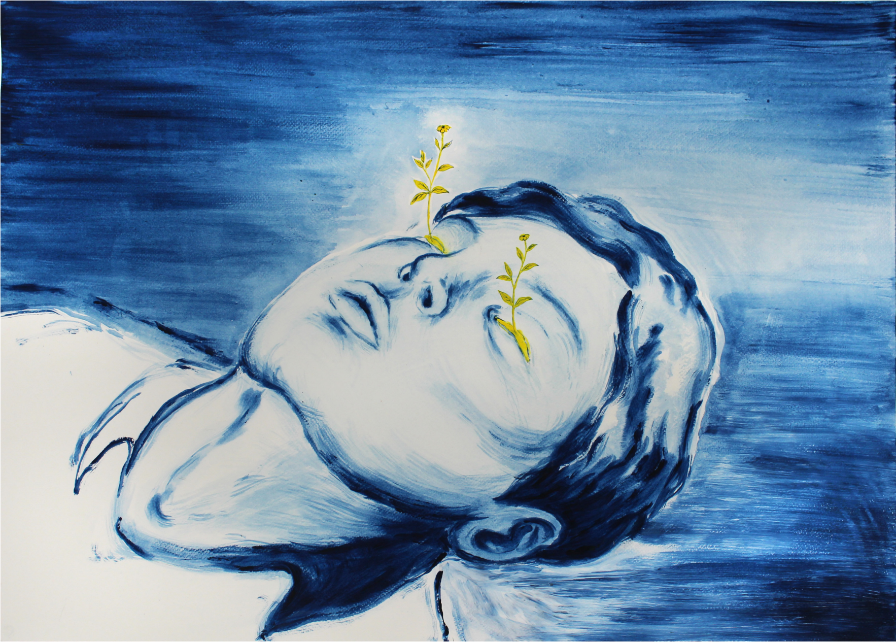
Germinal II, 2020, acrylic on paper, 50 x 65 cm