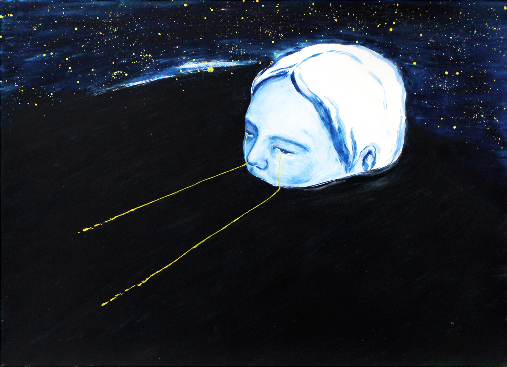
Germinal III, 2020, acrylic on paper, 50 x 70 cm