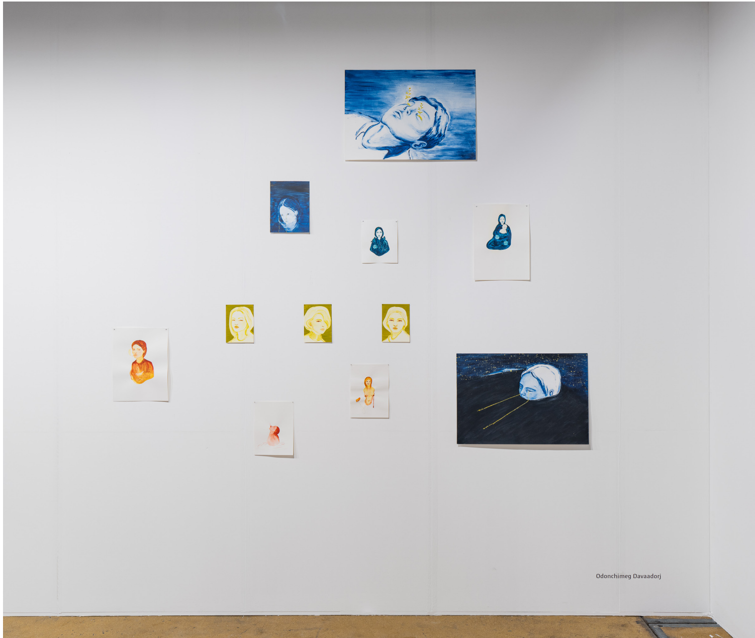
Installation view at AKINCI's booth, Art Rotterdam, 2024