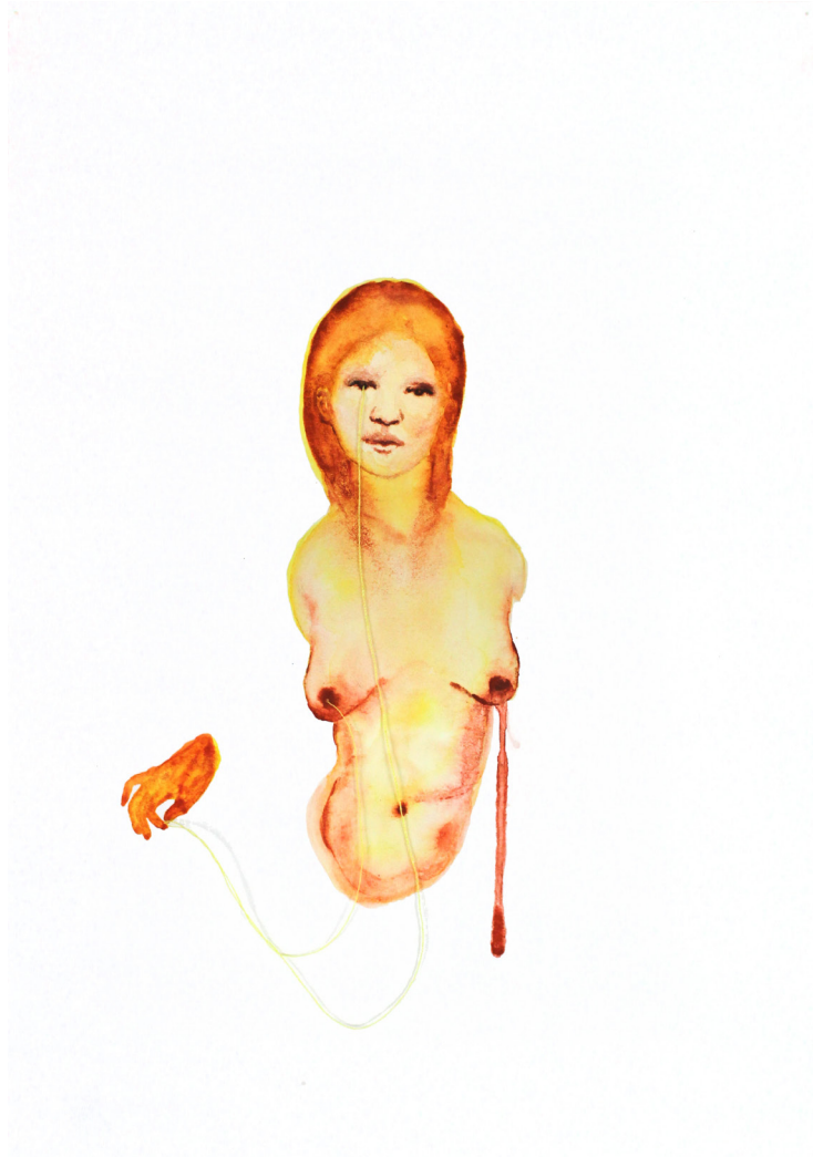
Untitled, 2021, watercolor and thread on paper, 29,5 x 20,5 cm