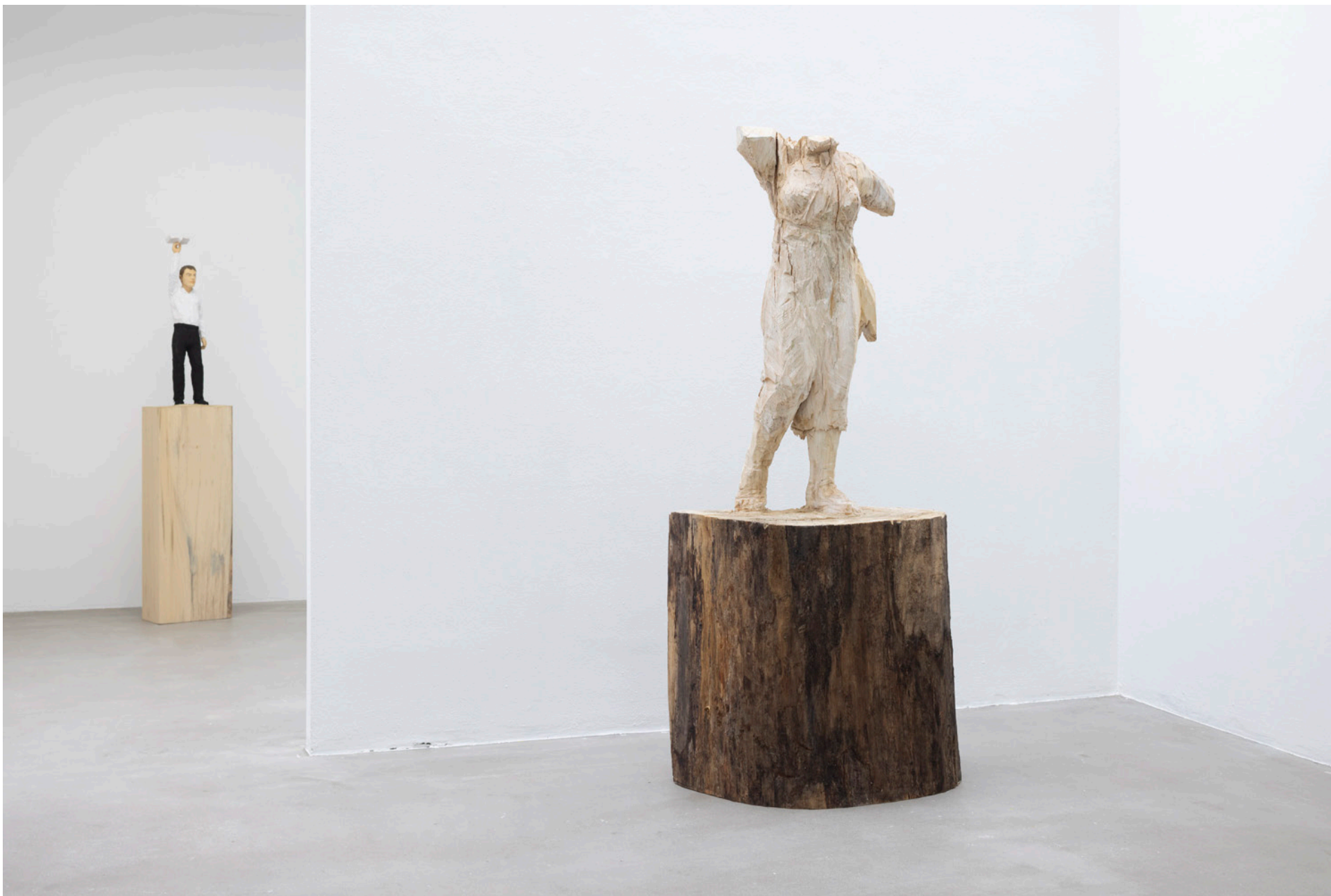
Installation view Stephan Balkenhol, New Works, AKINCI, 2024