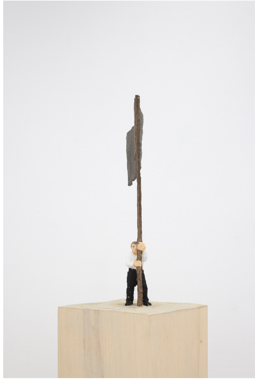
Kleiner Mann mit grauer Fahne, 2022, wawa wood, coloured, 171,5 x 34 x 35 cm