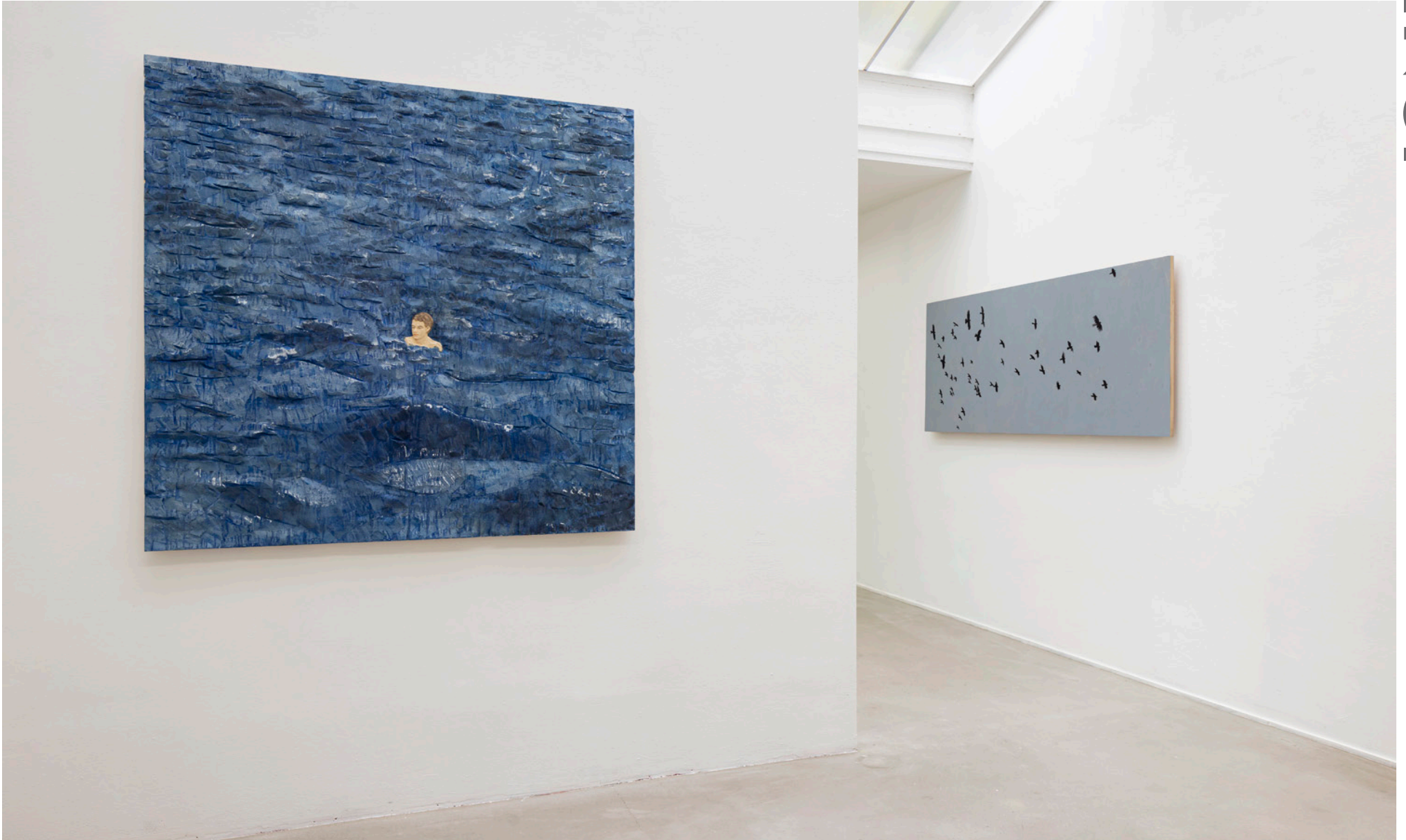
Installation view Stephan Balkenhol, New Works, AKINCI, 2024