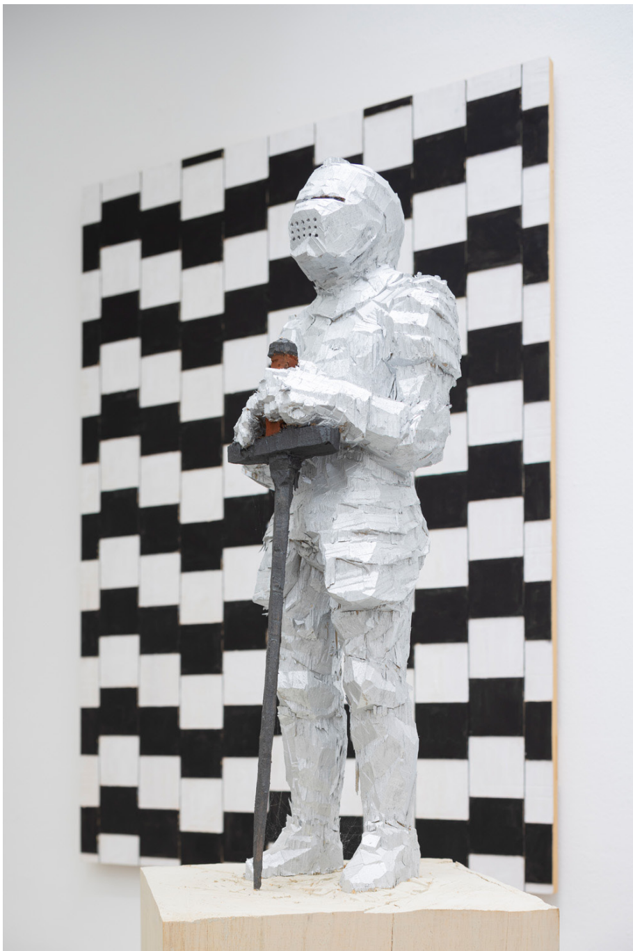
Ritter, 2023/2024, wawa wood, coloured, 172 x 33,5 x 32 cm