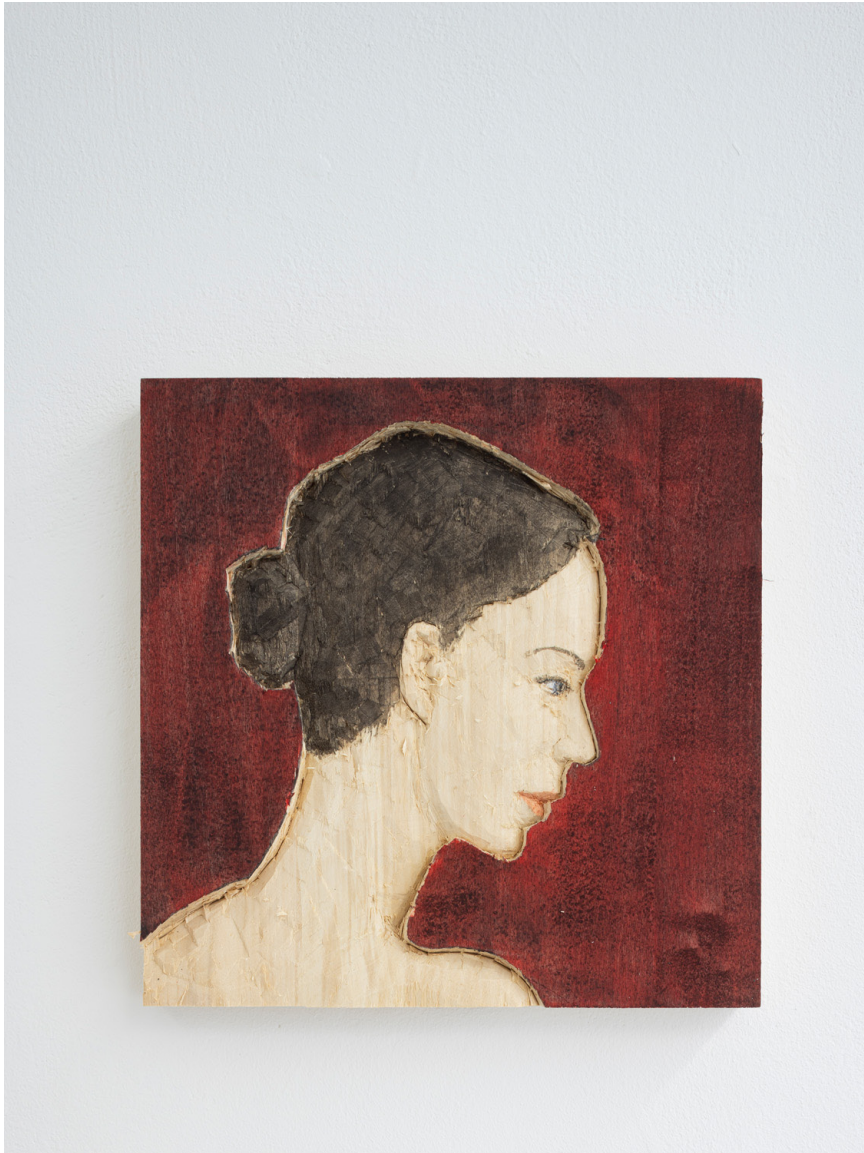
Kleines Relief Frau, 2024, wawa wood, coloured, 30 x 30 cm