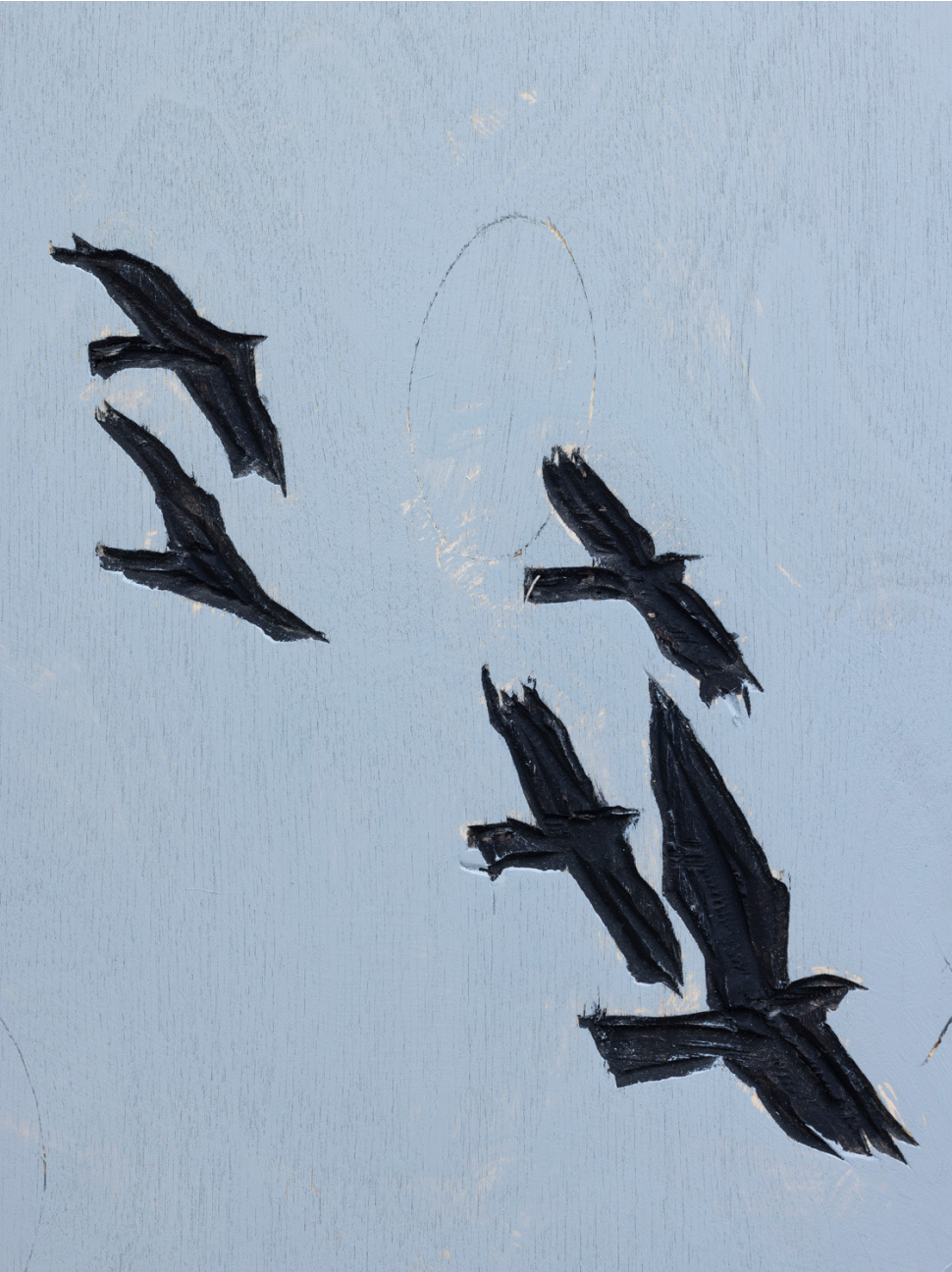
Relief Vögel, 2024, birch, coloured, 200 x 100 x 4,5 cm