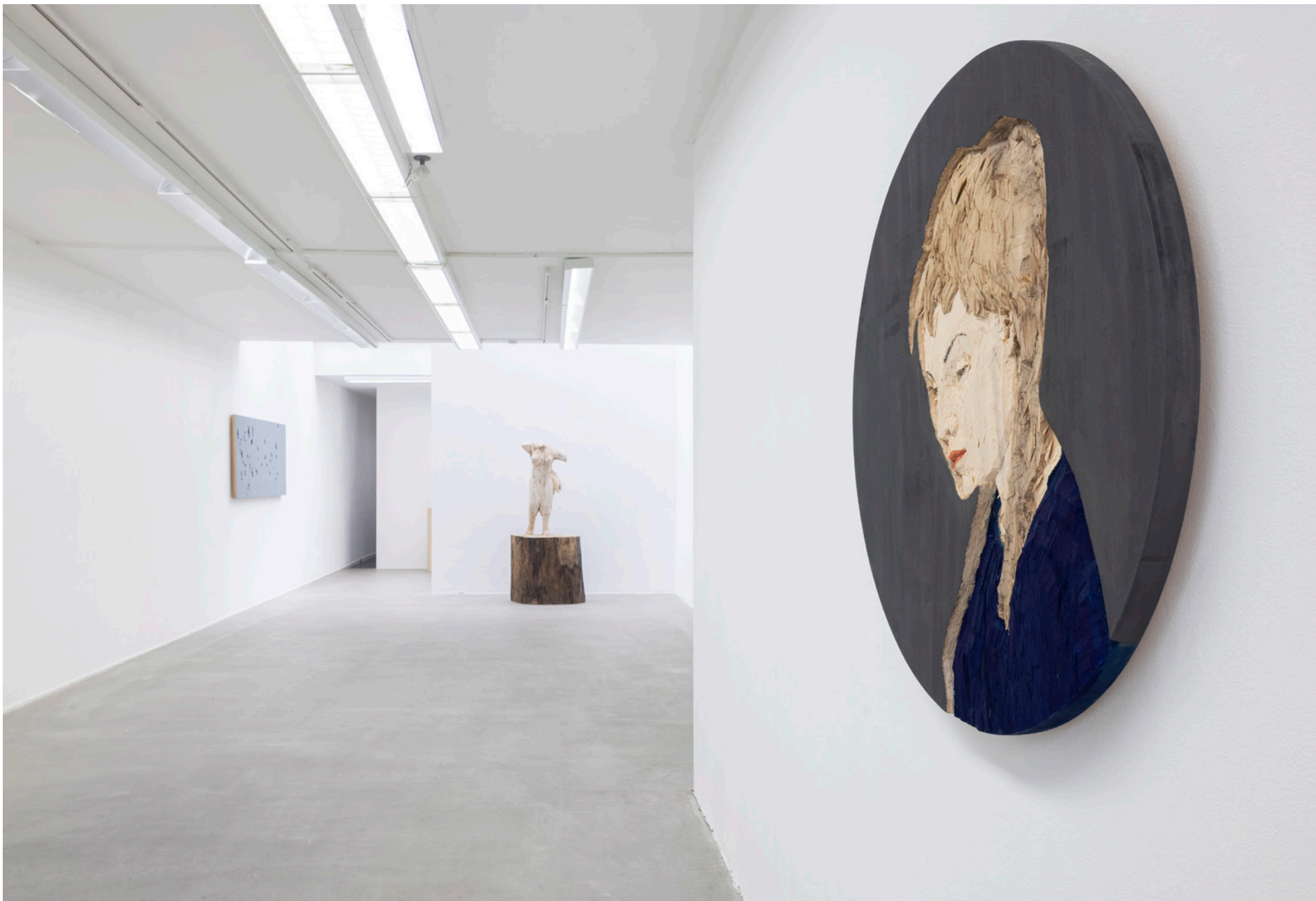
Installation view Stephan Balkenhol, New Works, AKINCI, 2024