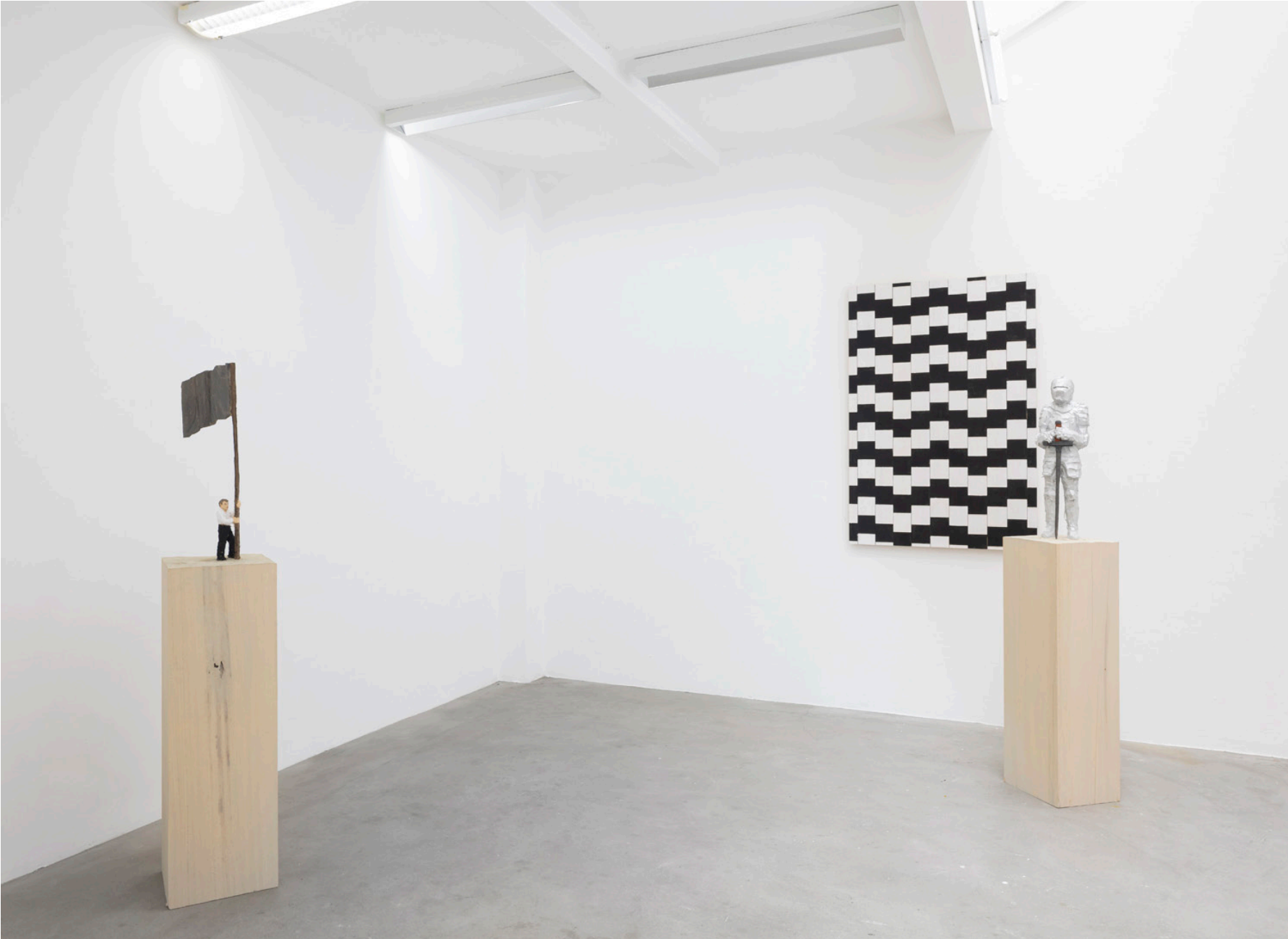
Installation view Stephan Balkenhol, New Works, AKINCI, 2024