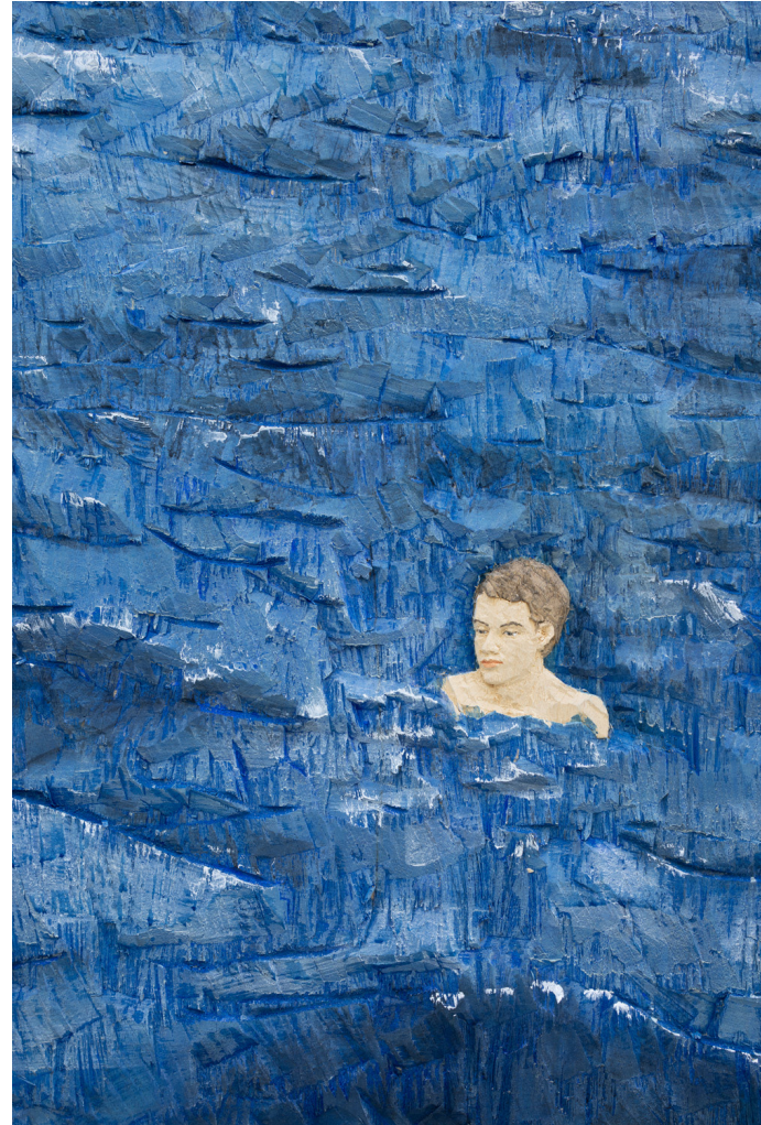
Relief Schwimmer, 2024, wawa wood, coloured, 160 x 157 x 4,5 cm