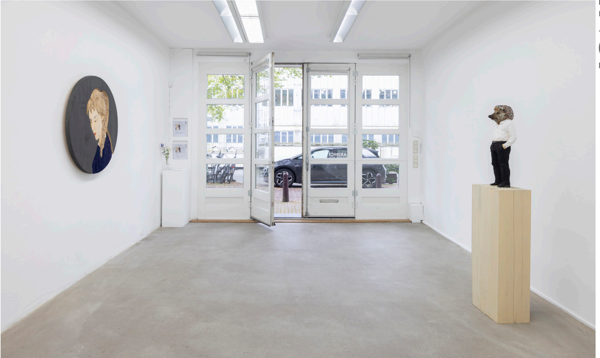
Installation view Stephan Balkenhol, New Works, AKINCI, 2024