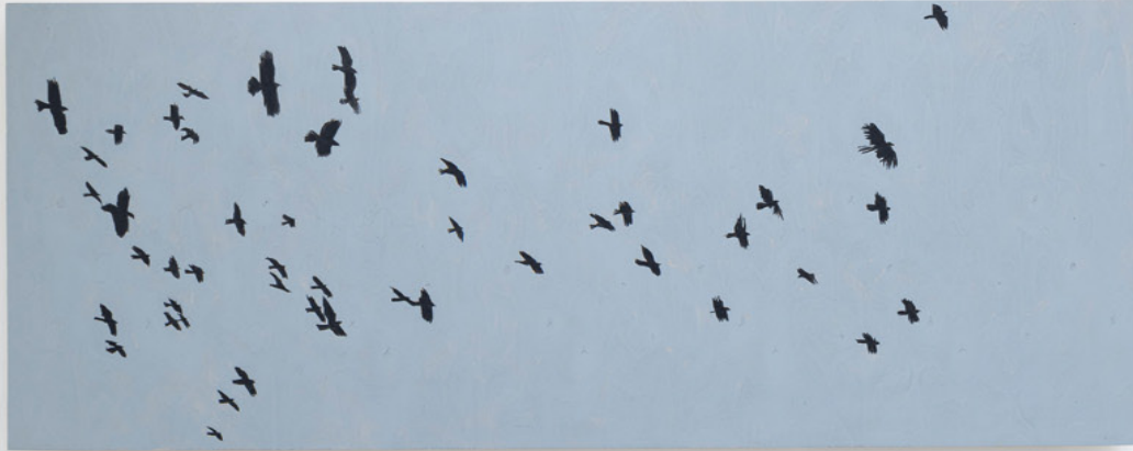
Relief Vögel, 2024, birch, coloured, 200 x 100 x 4,5 cm