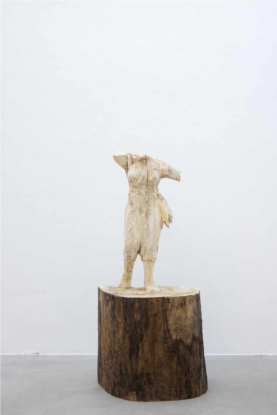
Bozetto, 2024, poplar wood, 193 x 80 x 49 cm