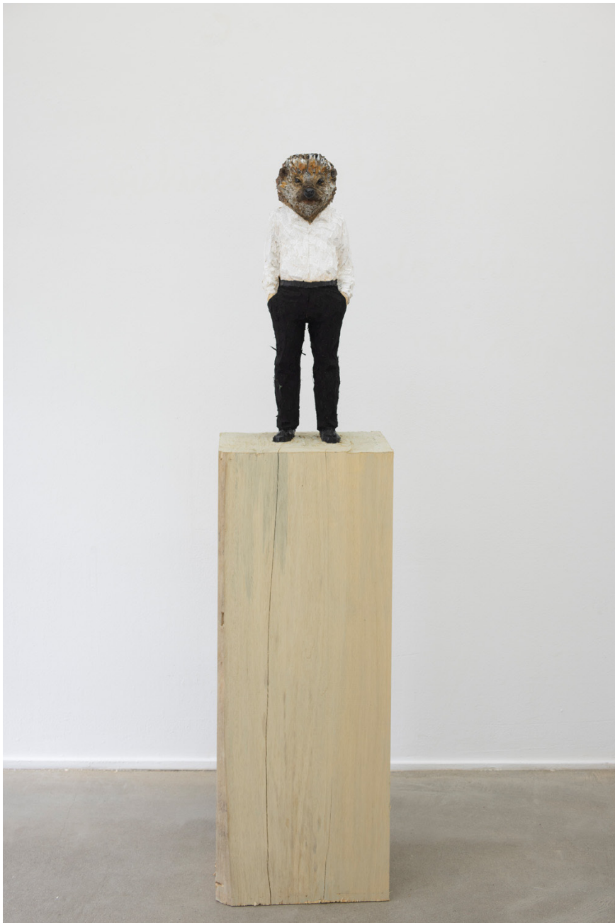
Igel Mann, 2024, wawa wood, coloured, 170 x 39,5 x 24,5 cm