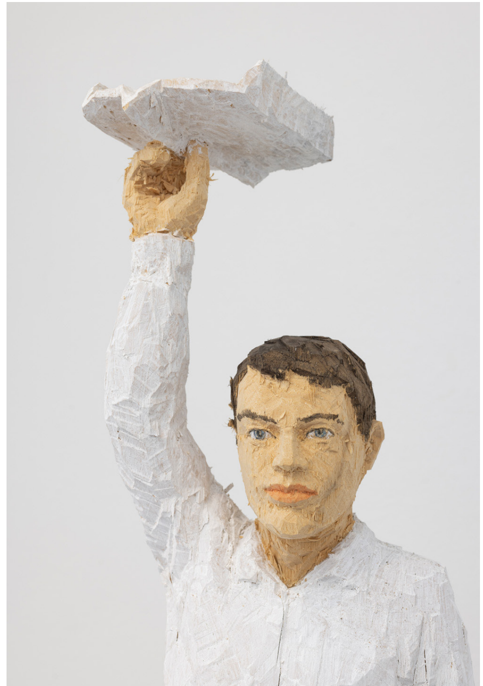
Papier Flieger, 2024, wawa wood, coloured, 184 x 29,5 x 24,5 cm (detail)