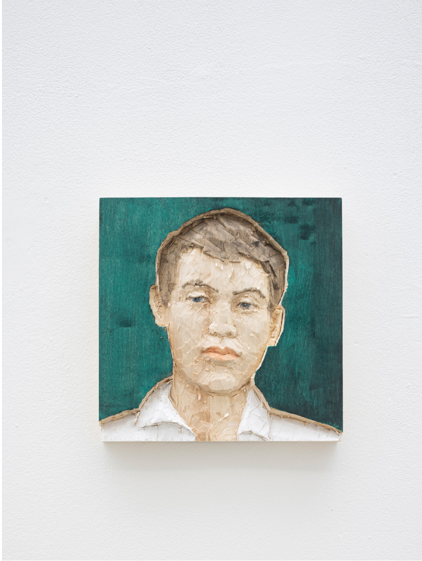
Kleines Relief Frau, 2024, wawa wood, coloured, 30 x 30 cm