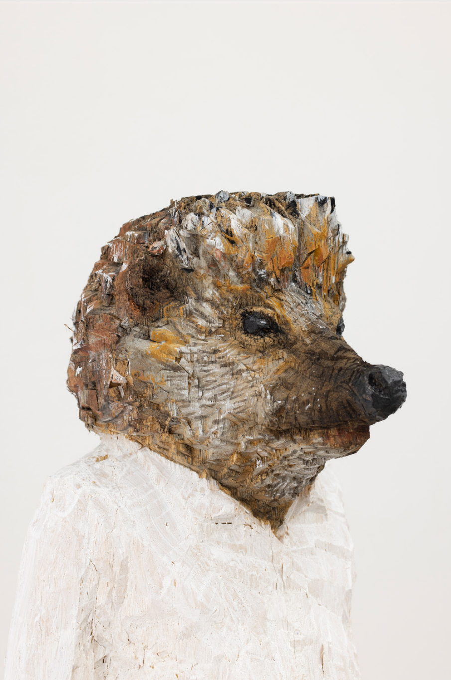
Igel Mann, 2024, wawa wood, coloured, 170 x 39,5 x 24,5 cm (detail)