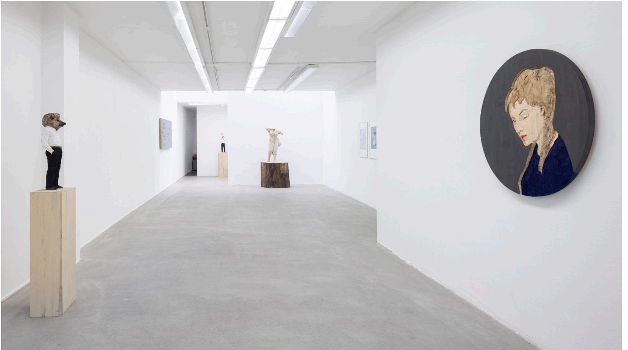
Installation view Stephan Balkenhol, New Works, AKINCI, 2024