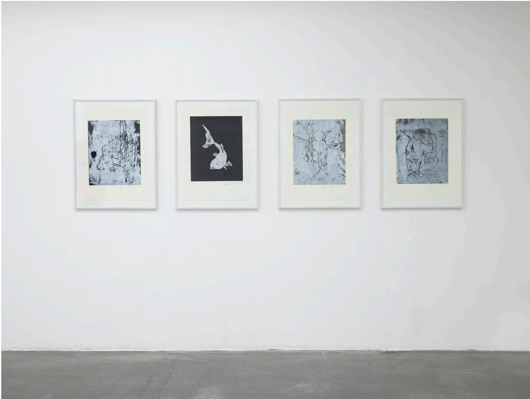
From left to right: Holzschnitt Igel / Fisch / Holzschnitt Steinbock / Holzschnitt Affe, 2020, woodcut on paper, 70 x 50 cm, 10 + 2ap