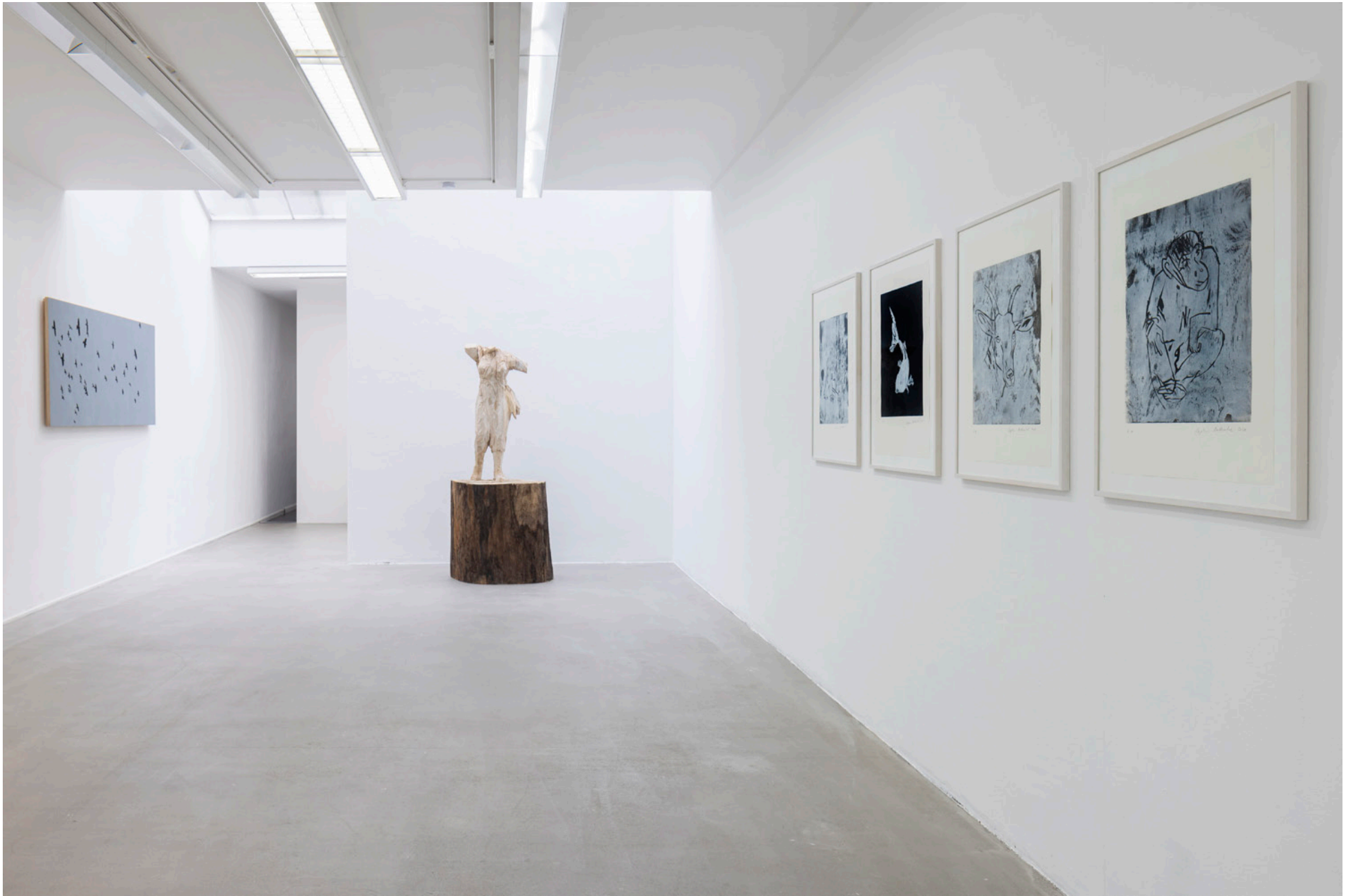
Installation view Stephan Balkenhol, New Works, AKINCI, 2024