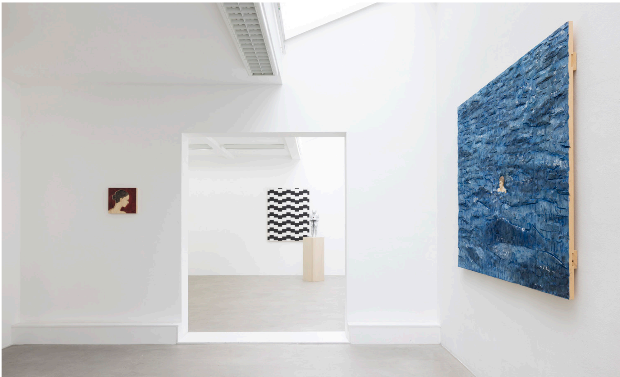
Installation view Stephan Balkenhol, New Works, AKINCI, 2024