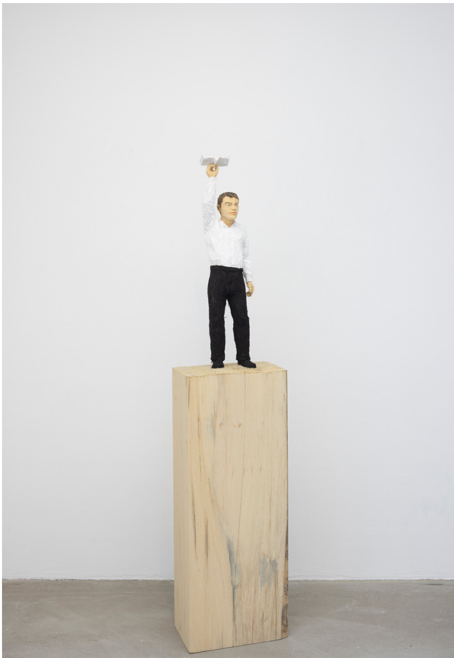
Papier Flieger, 2024, wawa wood, coloured, 184 x 29,5 x 24,5 cm