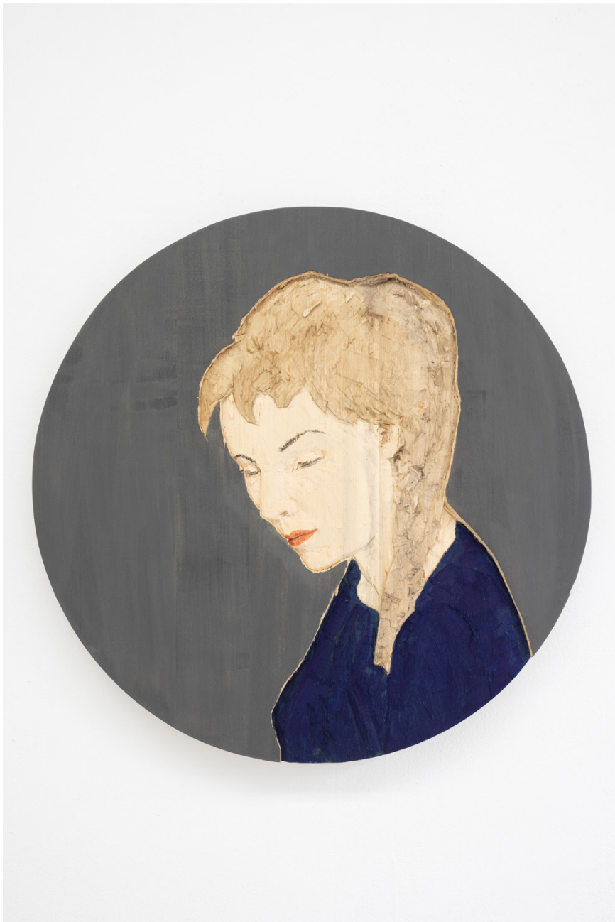
Relief Tondo (Frau), 2024, wawa wood, coloured, diameter 100 x 4,5 cm