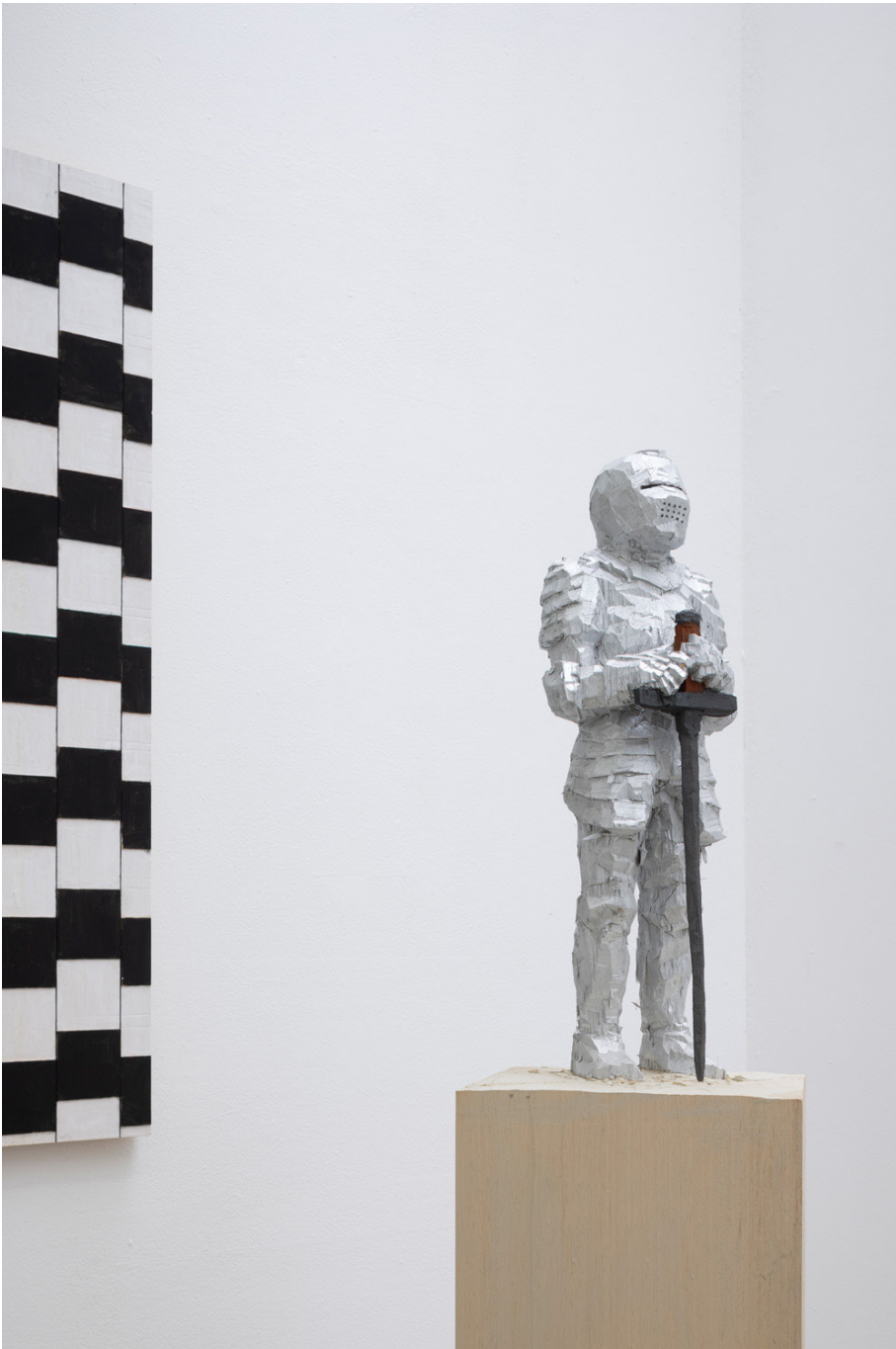
Ritter, 2023/2024, wawa wood, coloured, 172 x 33,5 x 32 cm