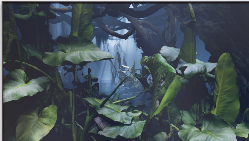
Ouverture, 2024, Fine Art Bayta print Hahnemuhle, dibond, framed, 80 x 143 cm ed. 1/5 + 2ap