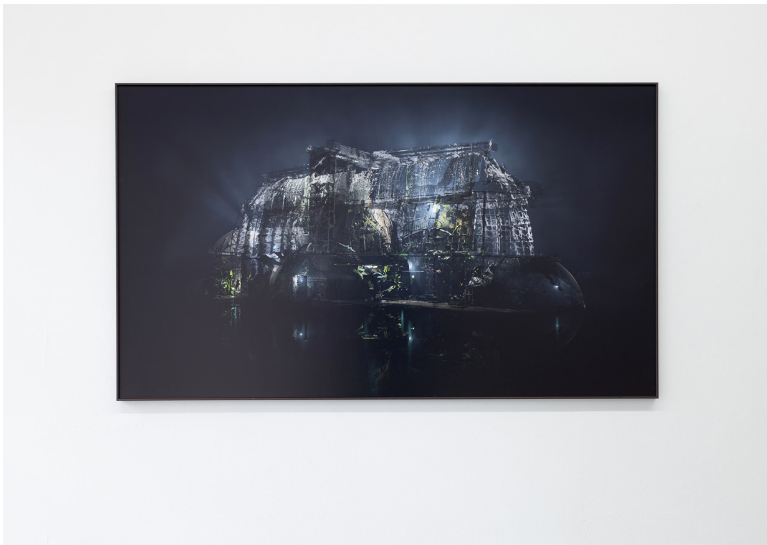
Glass House, 2024, Fine Art Bayta print Hahnemuhle, dibond, framed, 104 x 178 cm ed. 1/5 + 2ap