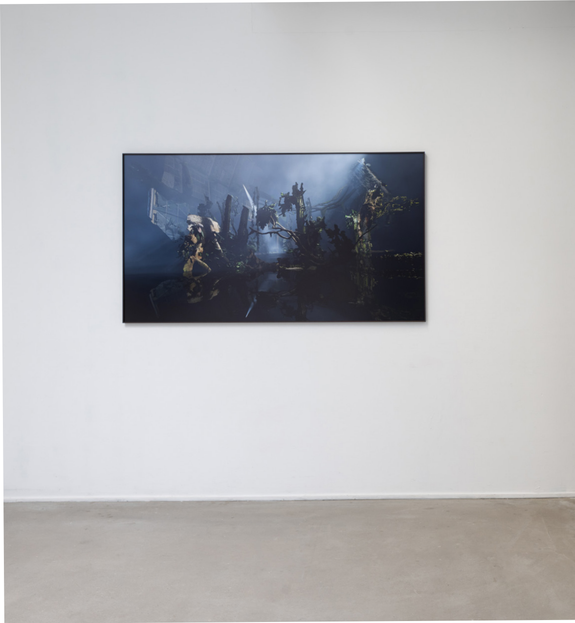
Jungle, 2024, Fine Art Bayta print Hahnemuhle, dibond, framed, 100 x 178 cm, ed. 1/5 + 2ap