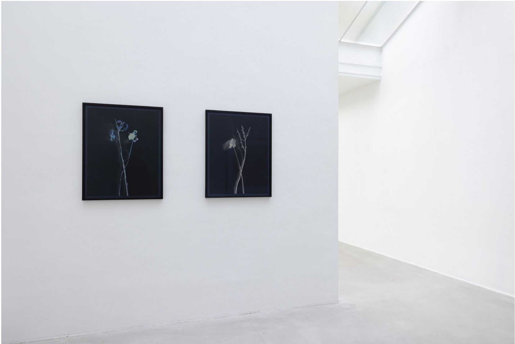
Left: Flower_m_co_8299, 2021, metalprint, framed, 83 x 66 cm, ed. 1/4 Right: Flower_m_sw_0547, 2021, metalprint, framed, 83 x 66 cm, ed. 1/4