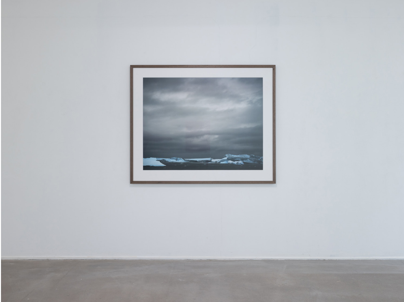
Lemaire_Channel-1, Antarctica, 2017, inkjet print, framed, 135 x 165 cm ed. 1/4